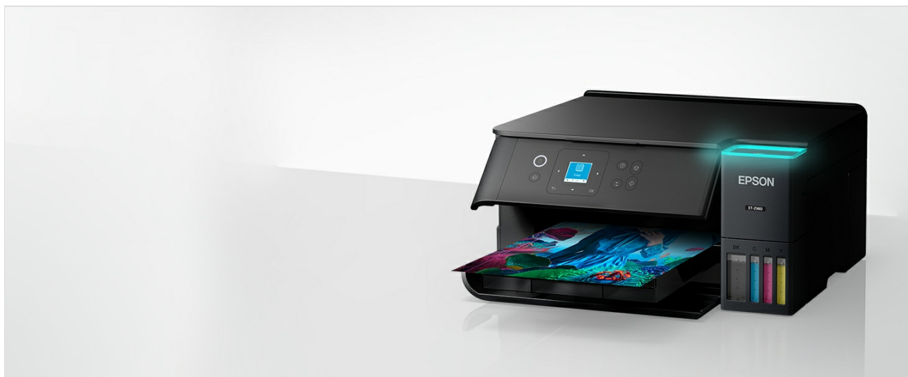
Image: Overview of Epson EcoTank ET-2980 features, highlighting print speeds (15 ppm black, 8 ppm color), Wi-Fi connectivity, auto 2-sided printing, 100-sheet paper capacity, and the 1.44-inch color display.

The 1.44-inch color display allows for easy navigation through printer functions, including copy, scan, and network settings. Use the directional buttons and 'OK' button to make selections.