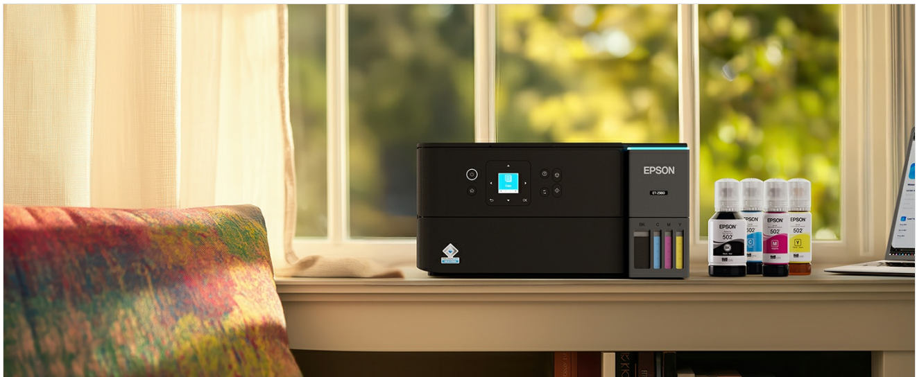
Image: Illustration of the ink refilling process for the Epson EcoTank ET-2980, showing the uniquely keyed EcoFit bottles preventing mix-ups.