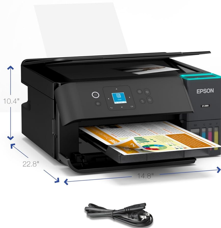
Power Cord (USB not included)