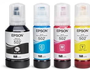
EcoTank 502® Ink Bottles

* We recommend genuine Epson® ink for the best print quality and performance.