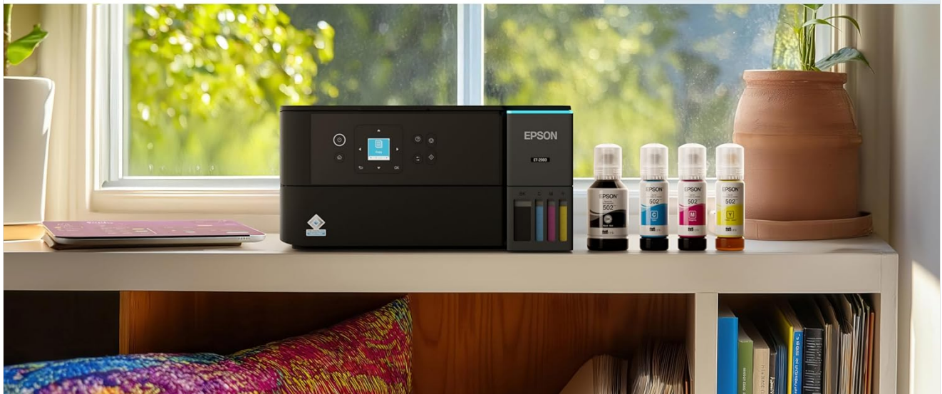
Image: A set of Epson 502 EcoFit ink bottles (Black, Yellow, Magenta, Cyan) designed for mess-free refilling of EcoTank printers.

Each replacement ink bottle set is equivalent to about 80 individual cartridges 2