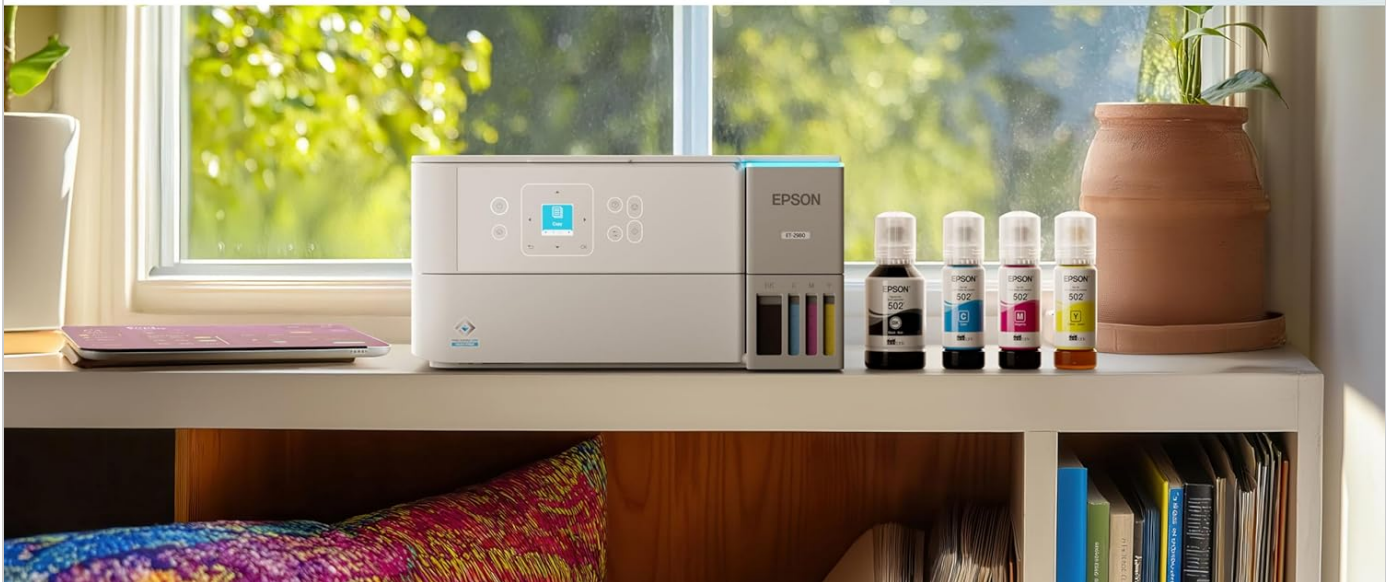
Image: The Epson EcoTank ET-2980 actively printing a document, showcasing its output tray.

Each replacement ink bottle set is equivalent to about 80 individual cartridges 2