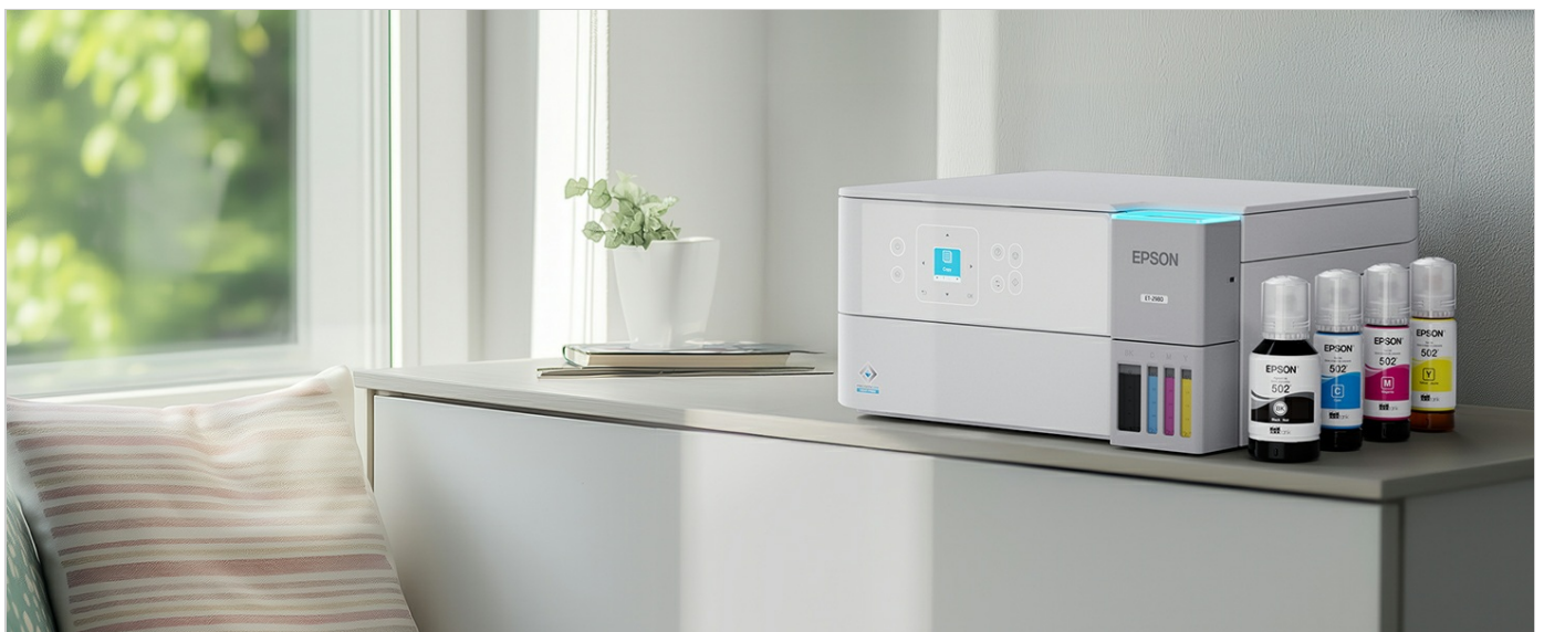
Image: The Epson Genuine Ink Promise, emphasizing the use of authentic Epson inks for optimal performance and warranty coverage.

The Epson EcoTank ET-2980 comes with a 1-Year Limited Warranty . This warranty covers defects in materials and workmanship under normal use. For full details, please refer to the warranty documentation included with your product or visit the official Epson support website.