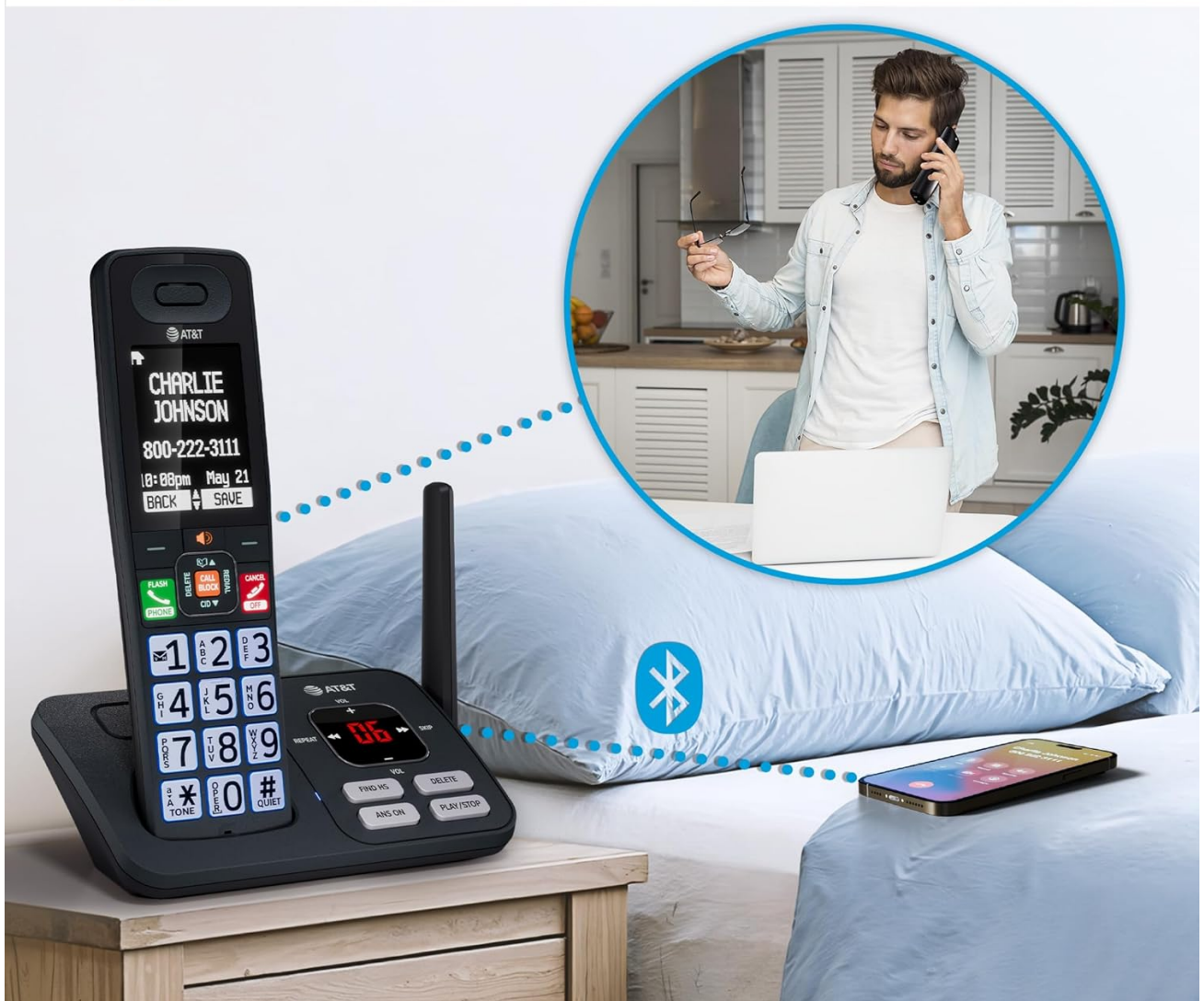
Image: A close-up of the handset displaying the "Smart Call Block" screen, with the "CALL BLOCK" button highlighted on the base unit.

Make and receive cellular calls anywhere inside your home