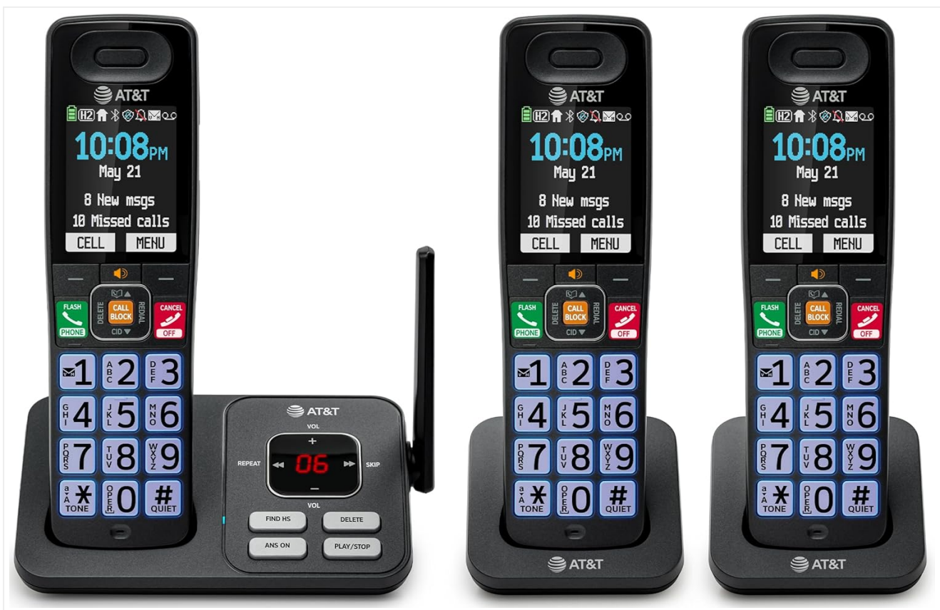
Image: The complete AT&T BL108-3 cordless phone system, showing the base unit and three handsets.