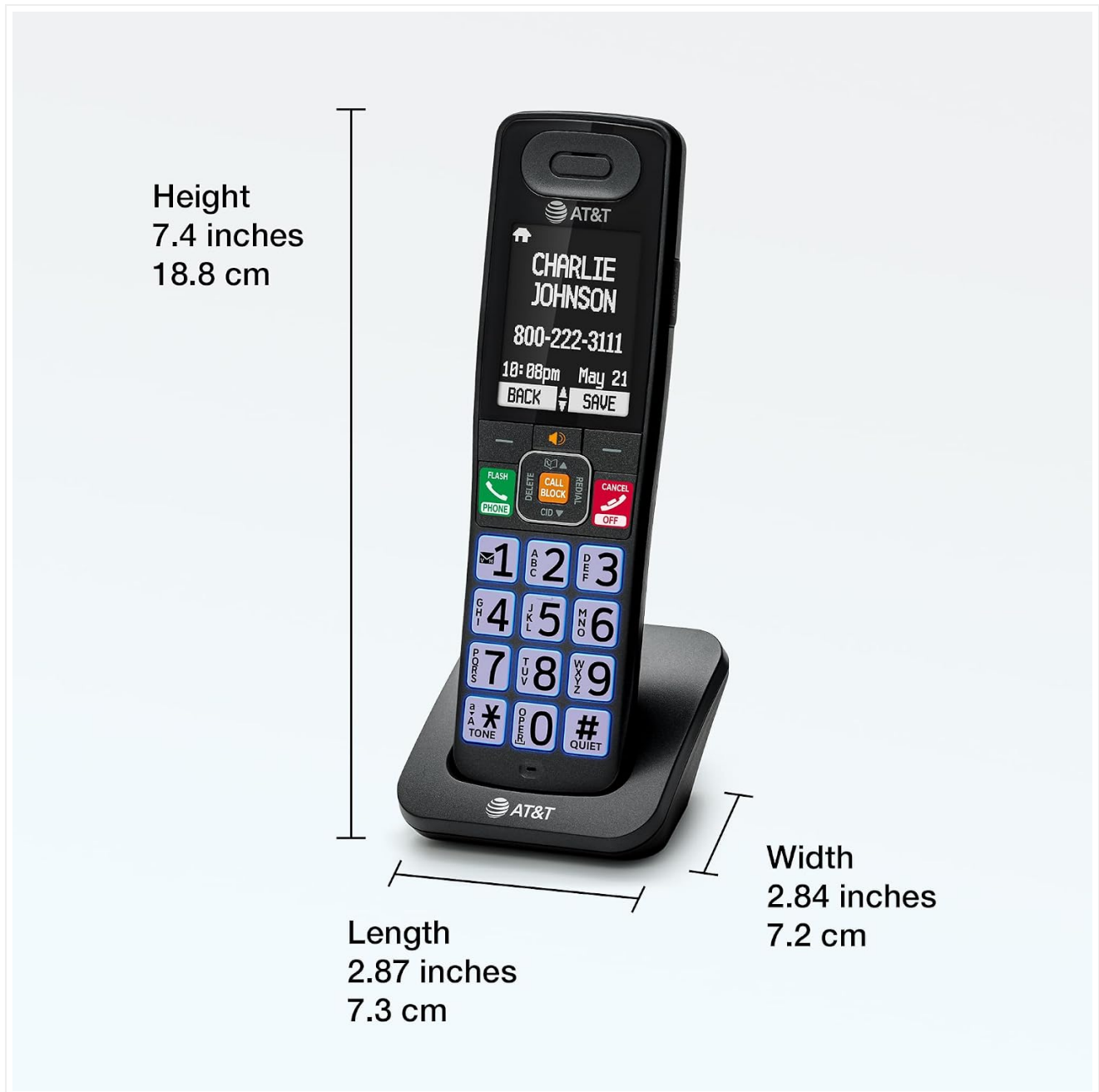
Image: Diagram showing the dimensions of the AT&T BL108-3 base unit and a handset.