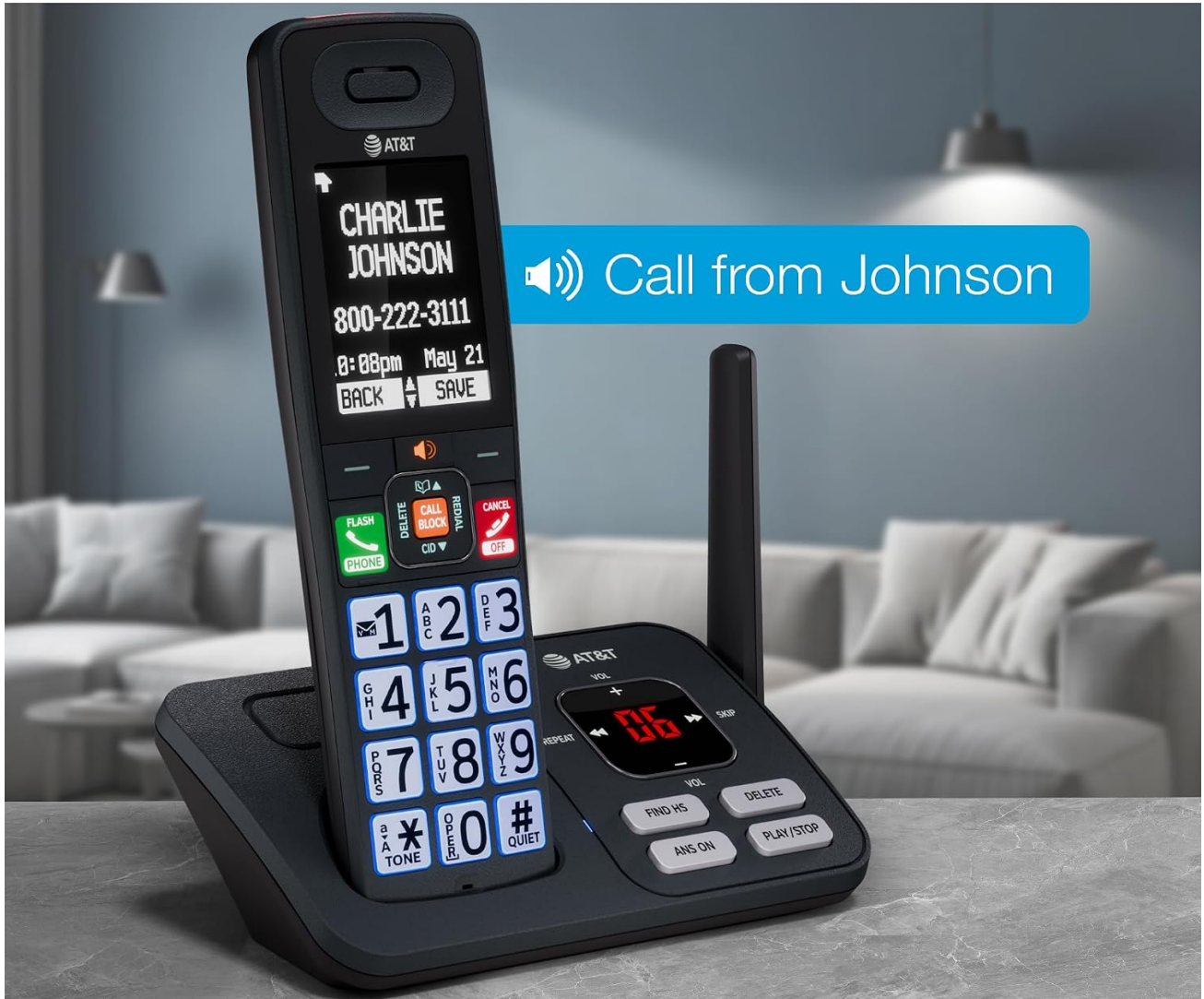
Image: The phone's base unit and handset displaying an incoming message on the answering system, with a visual of a message being left.

Hear who's calling without stopping what you're doing