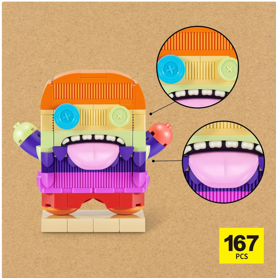
Image: All 167 building bricks and the instruction booklet, ready for assembly.