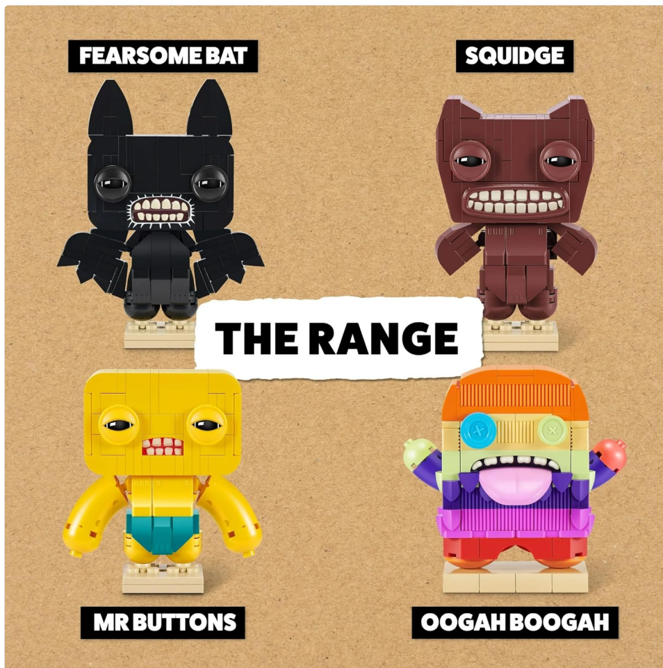
Image: The full range of ZURU MAX Build More Fuggler characters, including Oogah Boogah.