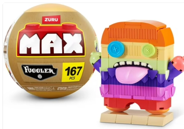
Image: The completed Oogah Boogah Fuggler on its display base.