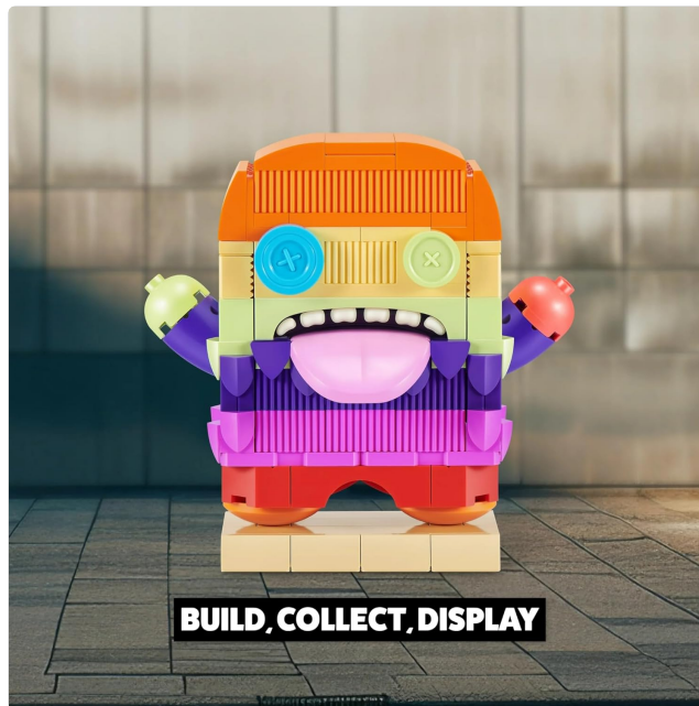
Image: The ZURU MAX Build More Fuggler Oogah Boogah set as it appears in its mystery capsule packaging.