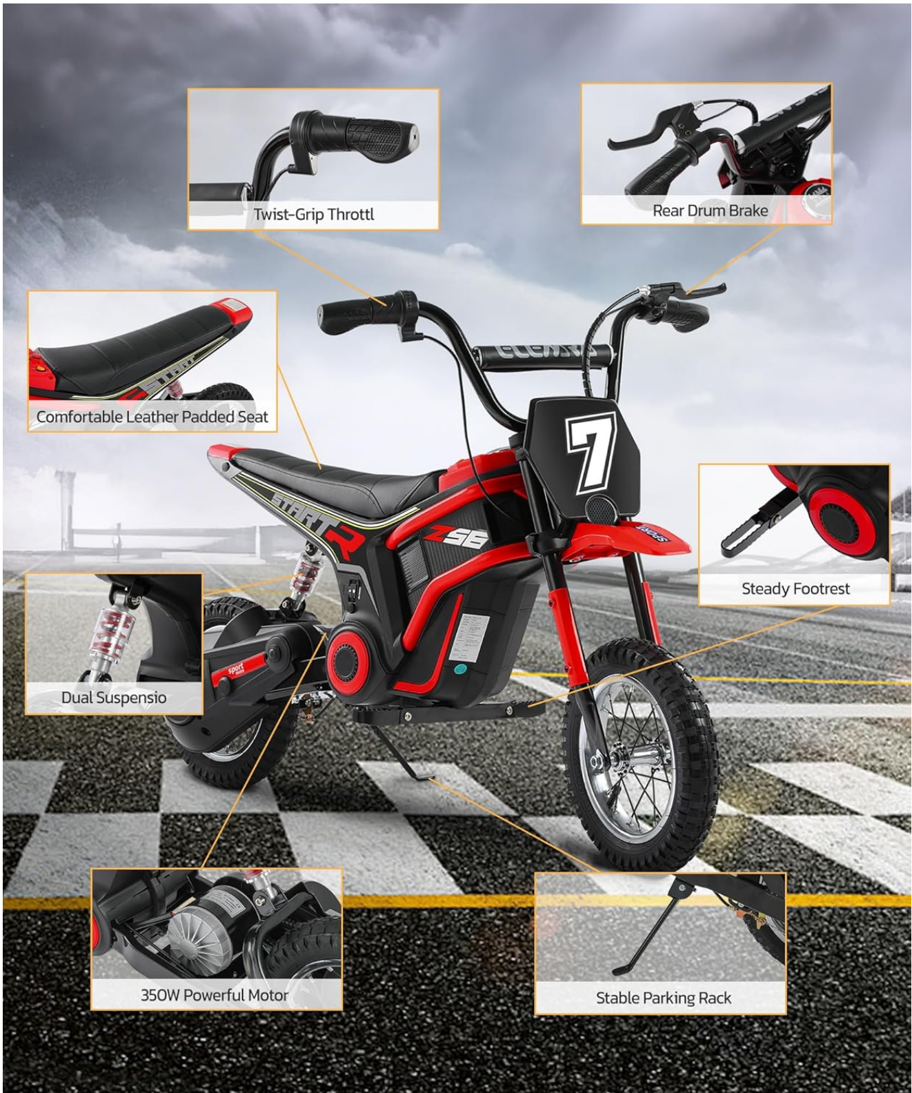
Image: Detailed view highlighting the Twist-Grip Throttle, Rear Drum Brake, Comfortable Leather Padded Seat, Steady Footrest, Dual Suspension, 350W Powerful Motor, and Stable Parking Rack.