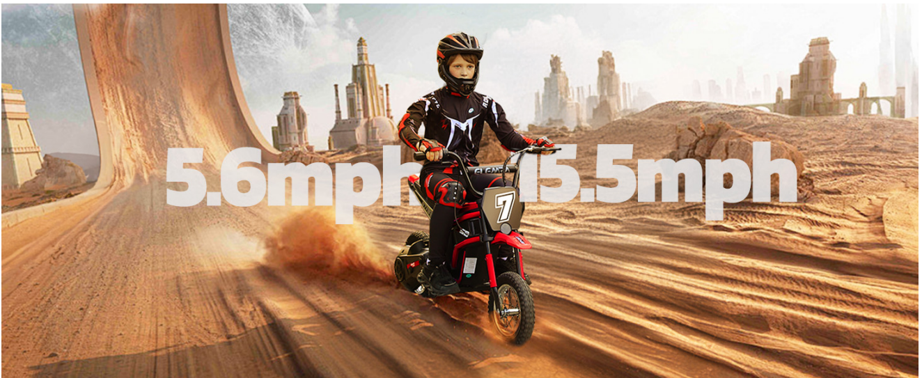
Image: The ELEMARA Electric Dirt Bike shown on different terrains, highlighting its versatility.