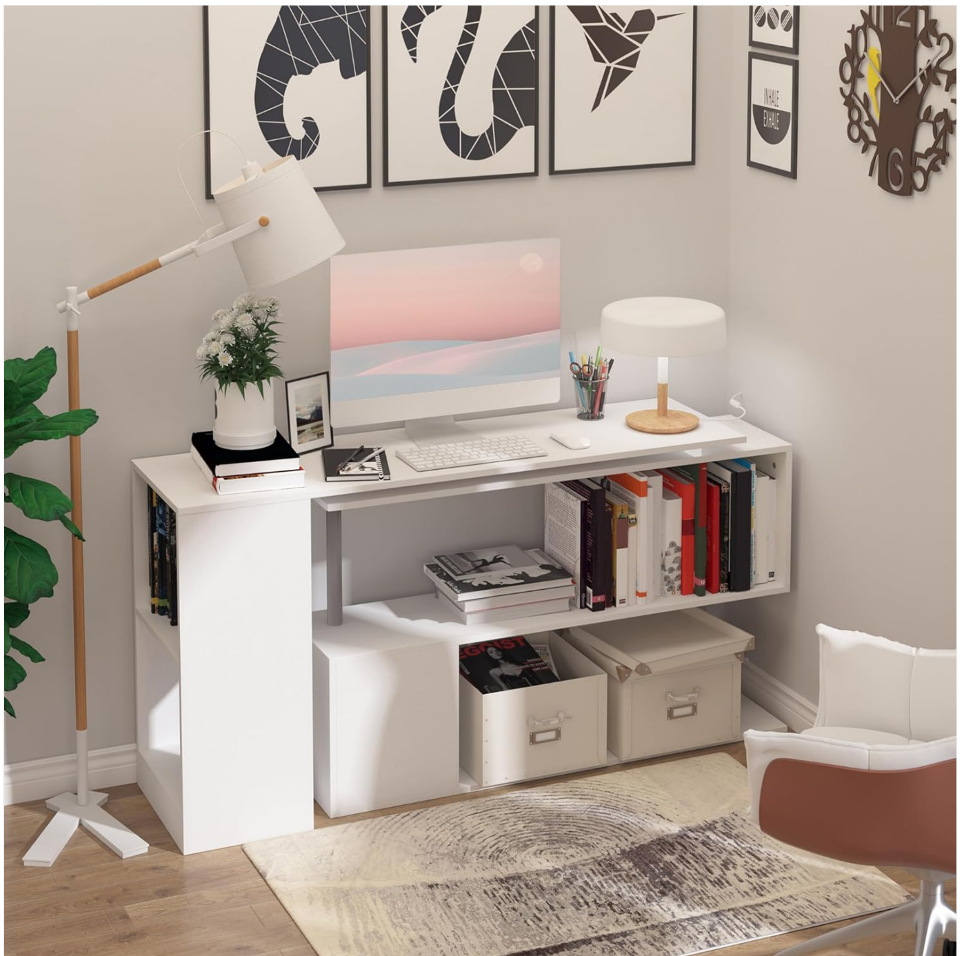
Figure 6: Desk dimensions in a compact L-shaped configuration (55" L x 47.25" W x 30.75" H).