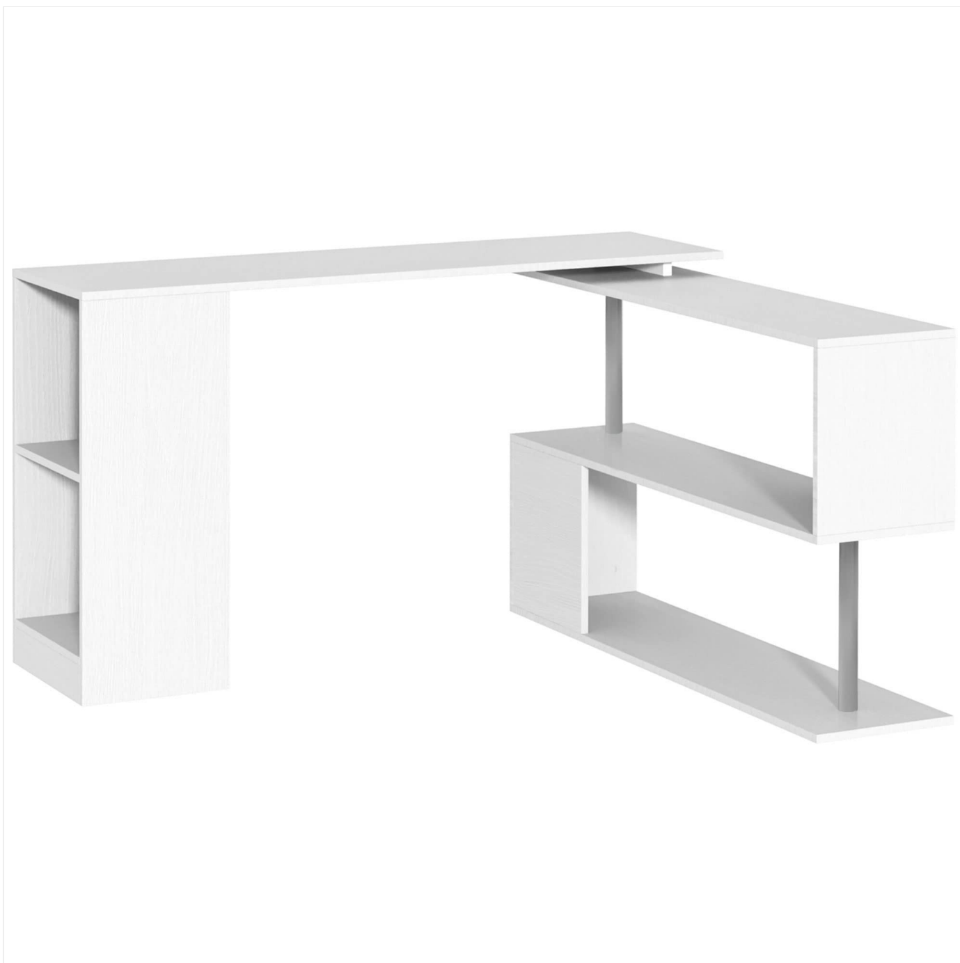
Figure 1: The 55-inch L-shaped rotating desk in a typical setup, showcasing its storage shelves and spacious desktop.