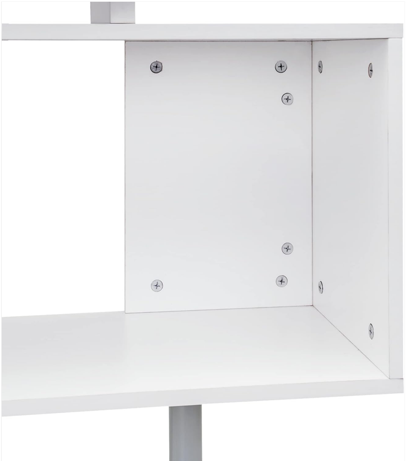
Figure 5: Detail of the rotating connection point, allowing the desk sections to pivot.