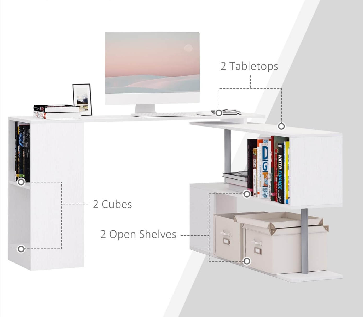
Figure 8: Various flexible configurations achievable with the 360-degree rotating desk design.