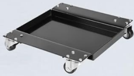
4 x 360° wheel