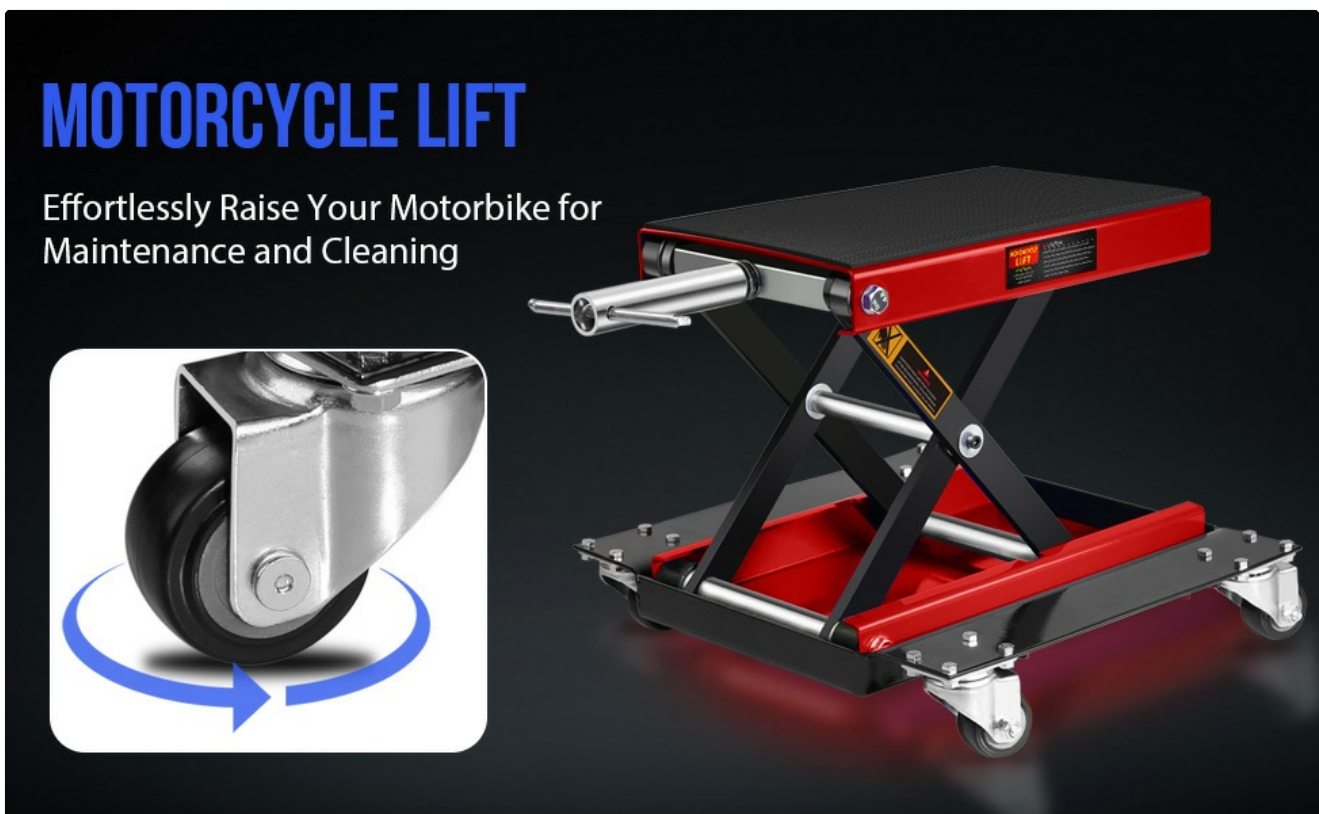
Image 1.1: Festisoul Motorcycle Scissor Jack Lift in use, supporting a motorcycle for maintenance.

This manual provides instructions for the safe and effective use of your Festisoul Motorcycle Scissor Jack Lift. This heavy-duty lift is designed to support motorcycles, dirt bikes, cruisers, and ATVs up to 1100 lbs (500 kg) for maintenance and cleaning tasks. It features a wide deck, a 3mm thick reinforced tray, and a center crank stand for stable lifting.