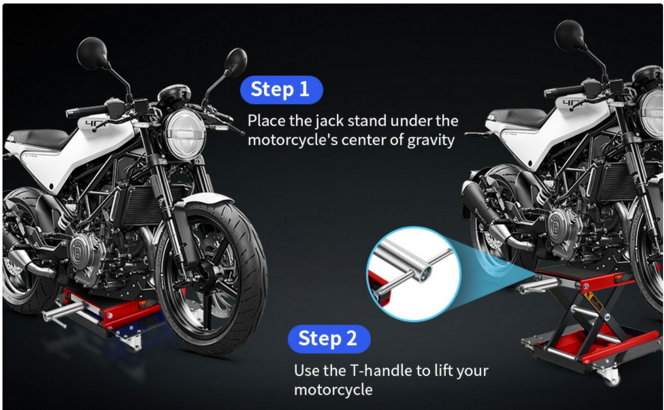
Image 5.1: Step-by-step guide for positioning the jack under the motorcycle's center of gravity and using the T-handle to lift.

mobility. Once the vehicle is lifted, you can smoothly move and adjust its position in your garage or workspace.