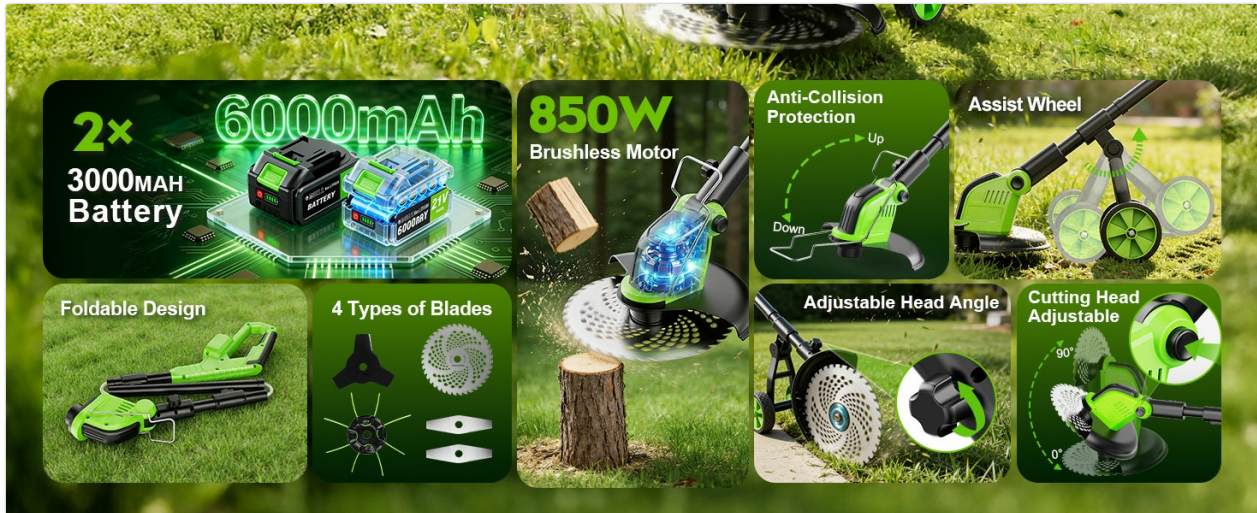
Image: Package contents including batteries, blades, and accessories.

Verify that all items are present in the package before assembly.