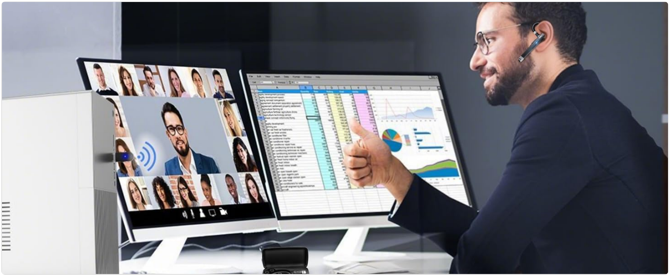
The ergonomic design of the headset with various ear tip sizes (S/M/L) for a comfortable fit.