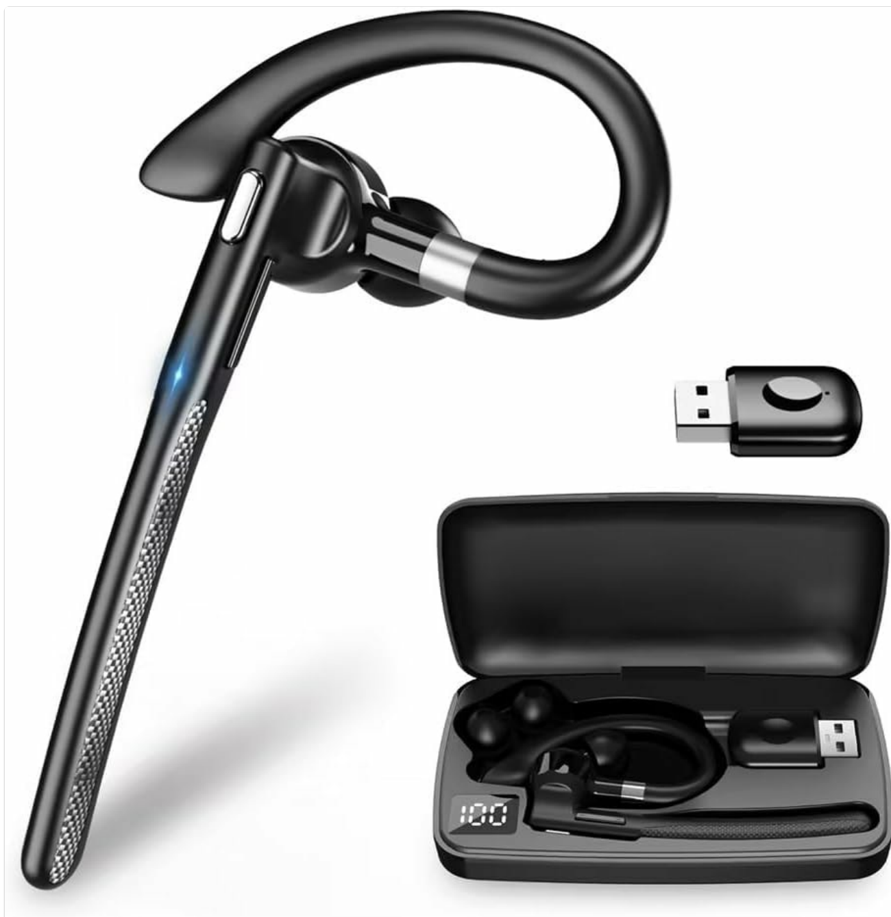
The Boytond YYK-526 Bluetooth Headset, showcasing its sleek design.