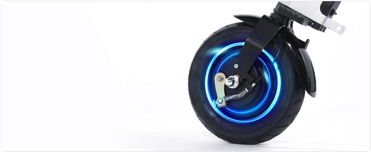
Figure 7.2: Motor specifications including power and rotating speed.