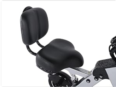
Figure 2.2: Ergonomic seat with backrest for comfortable riding.