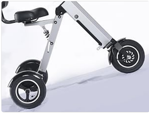
Figure 2.4: Front wheel with integrated suspension for a smoother ride.