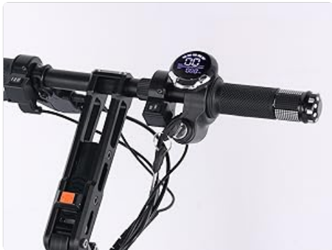
Figure 2.3: Handlebar showing the key switch, display, and brake lever.