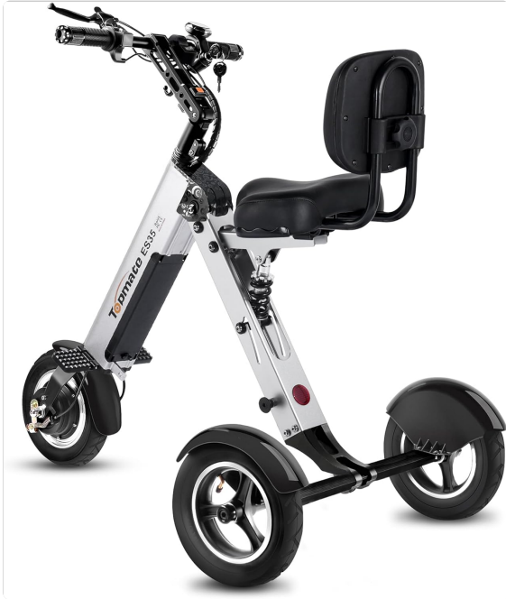
Figure 2.1: Overall view of the TopMate ES35 Powered Scooter.

Familiarize yourself with the main components of your TopMate ES35 scooter.