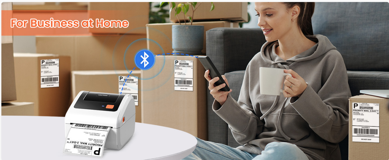
Image: The D450BT printer is suitable for multiple occasions such as office, warehouse, home, and retail.