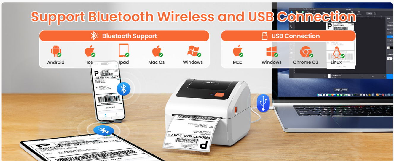
Image: The D450BT printer demonstrating both Bluetooth wireless and USB wired connection capabilities.