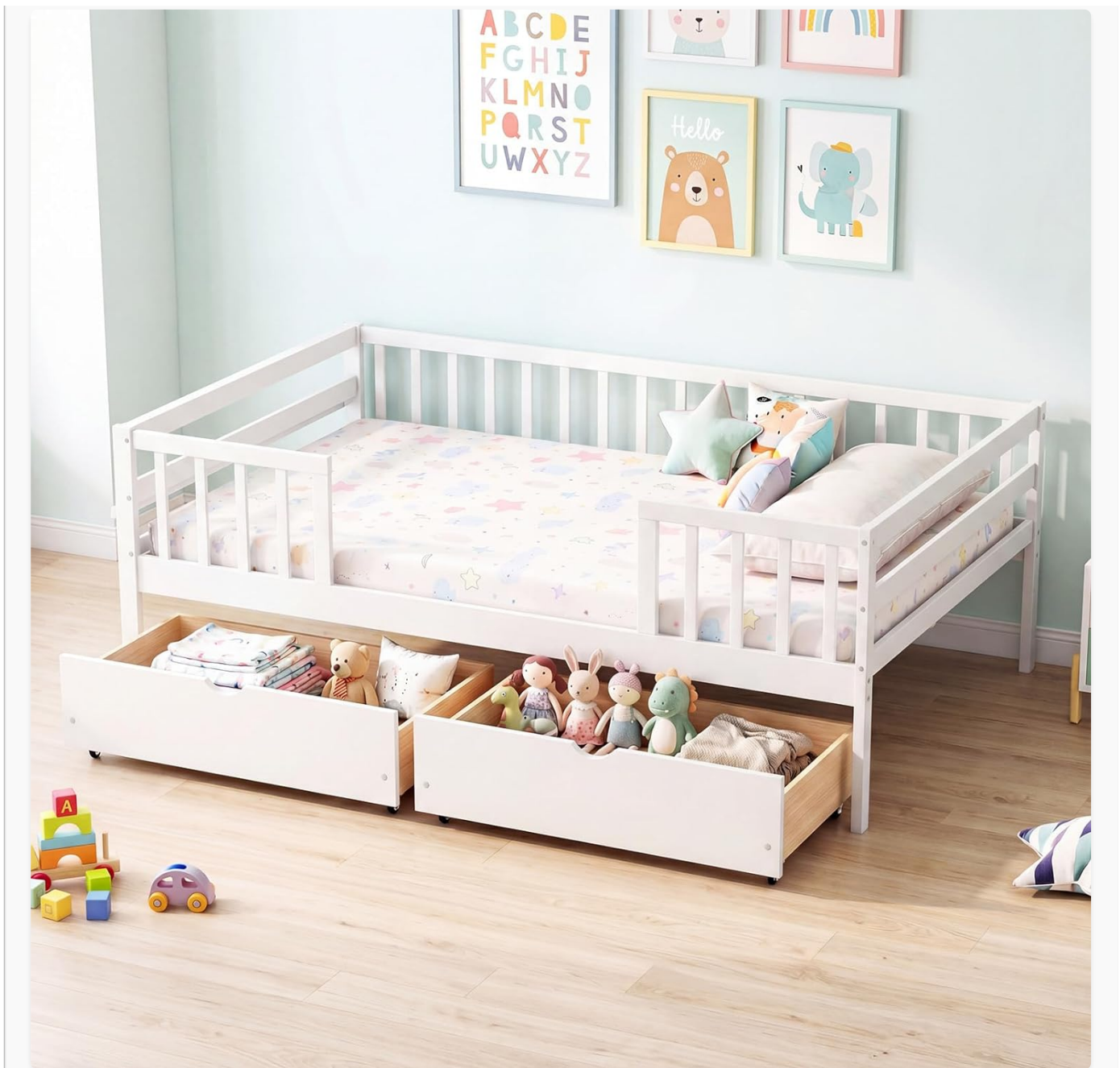
Image: The Giantex Full Kids Bed in white, showcasing its overall design with integrated storage drawers and side shelf.