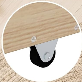
Smooth Rolling Casters

Image: A close-up view of the storage drawers, highlighting the cut-out handles and smooth rolling casters for easy operation.