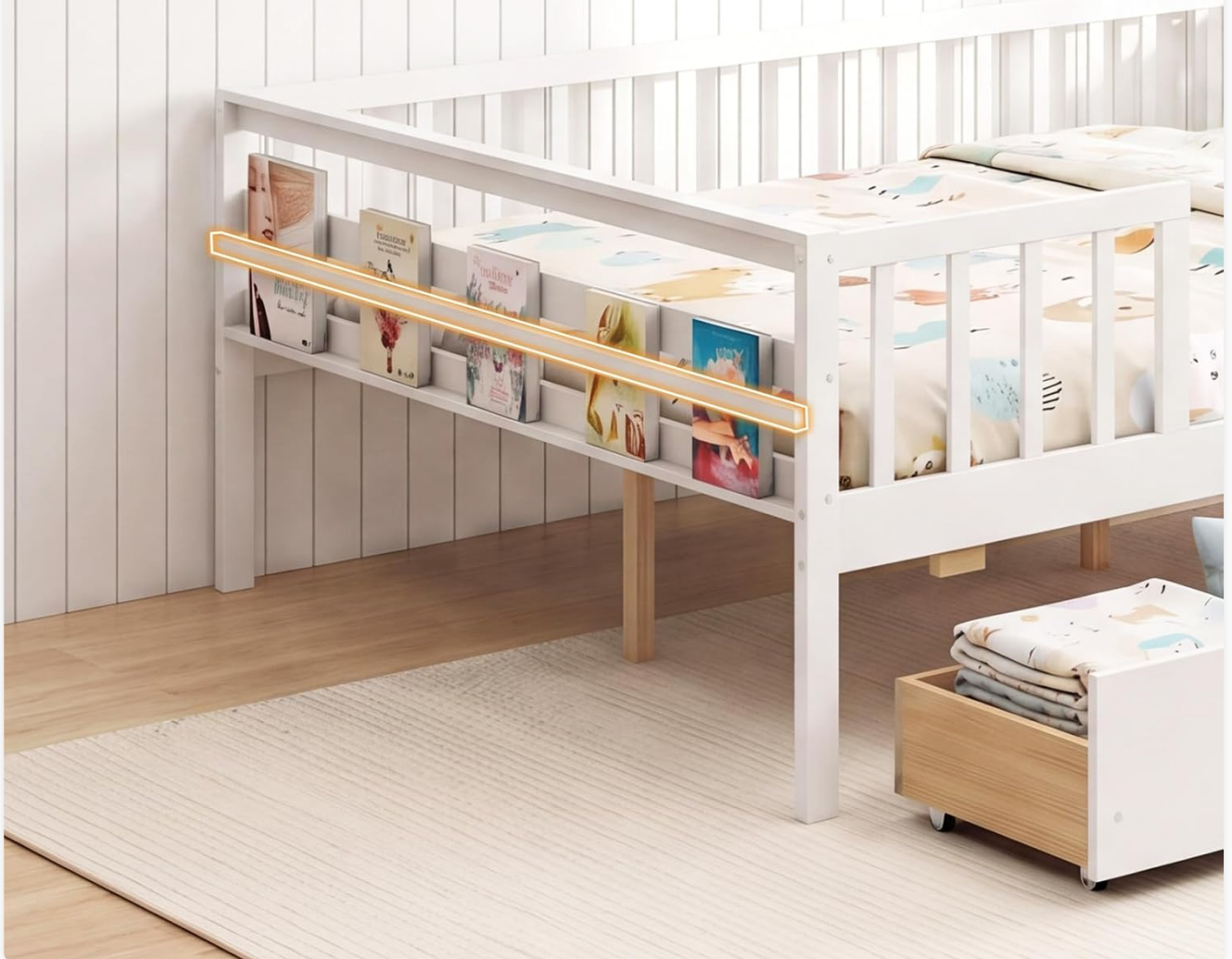
Image: The functional bookcase organizer integrated into the side of the bed, suitable for storing books and small items.