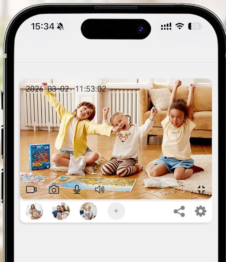
Image: WOLFANG WS03 camera demonstrating multi-user sharing and multi-view functionality on a smartphone.