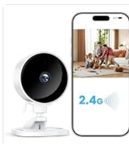
Image: WOLFANG WS03 camera with a smartphone indicating 2.4GHz Wi-Fi connectivity.