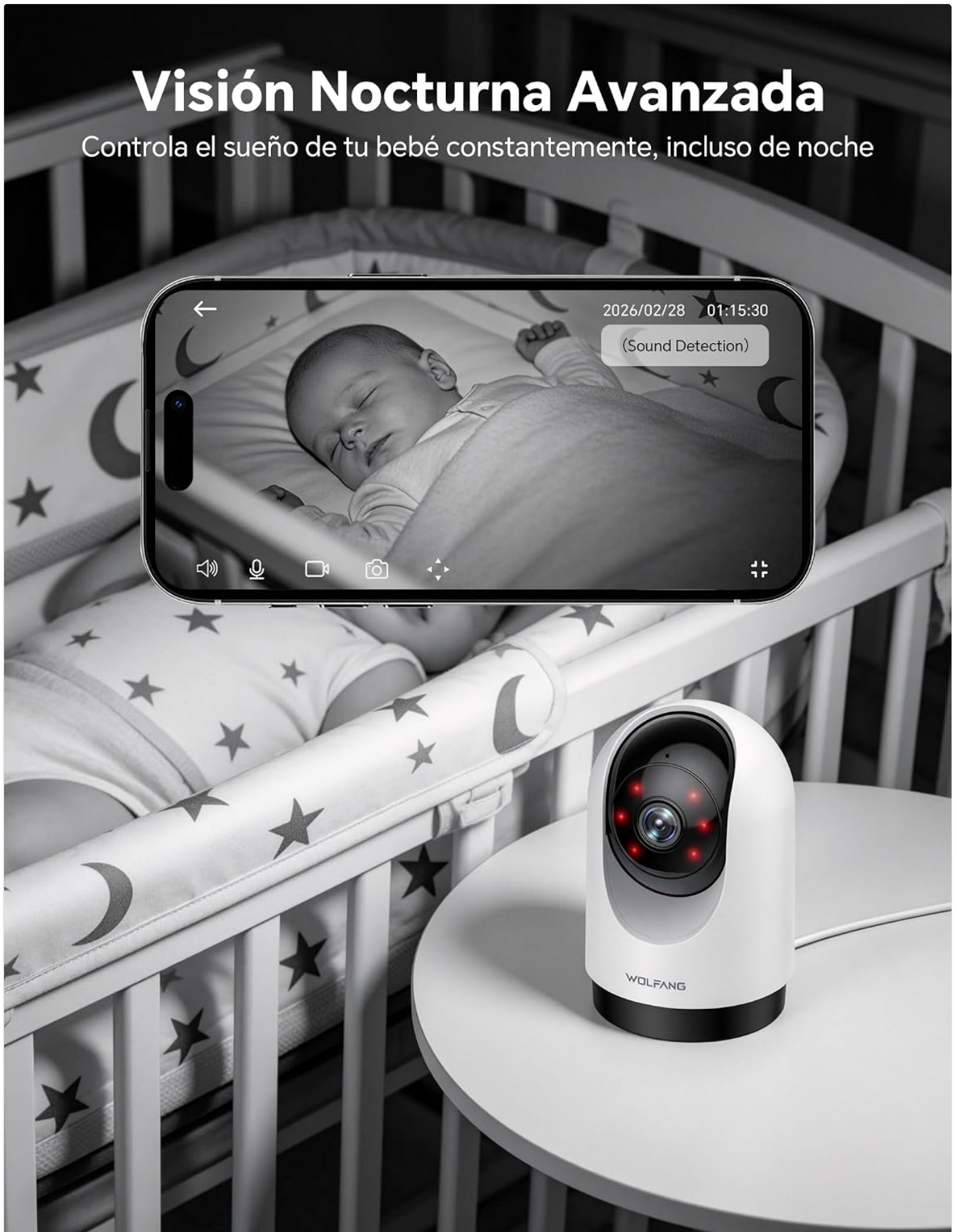
Image: WOLFANG WS03 camera monitoring a sleeping baby in night vision mode.

Controla el sueño de tu bebé constantemente, incluso de noche