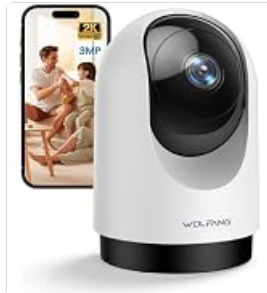
Image: WOLFANG WS03 camera placed on a surface, connected to power, with a smartphone displaying its live feed.