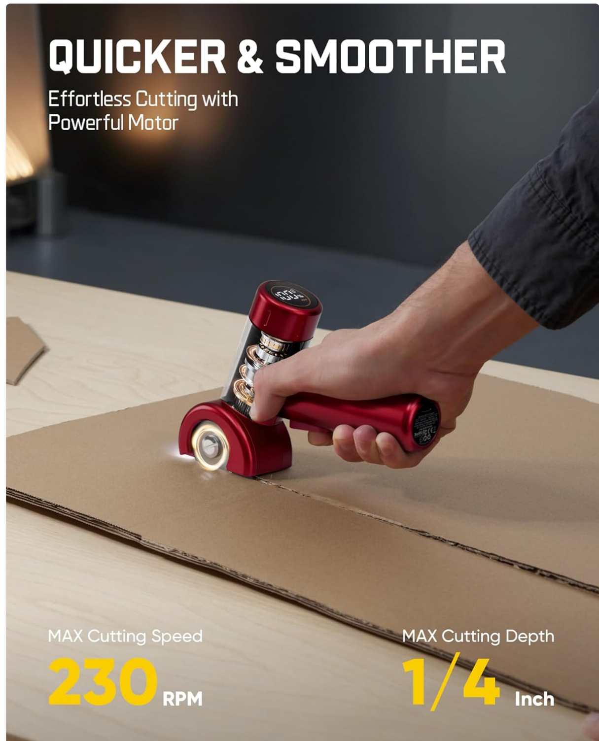
Image: The Fantik C8 Nano effortlessly cutting through a piece of cardboard, highlighting its powerful motor and smooth operation.