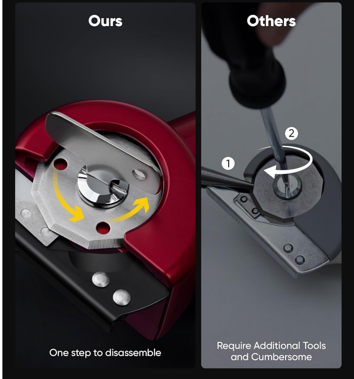
Image: Close-up view of the EasySwap blade mechanism, illustrating the simple one-step process for changing blades.