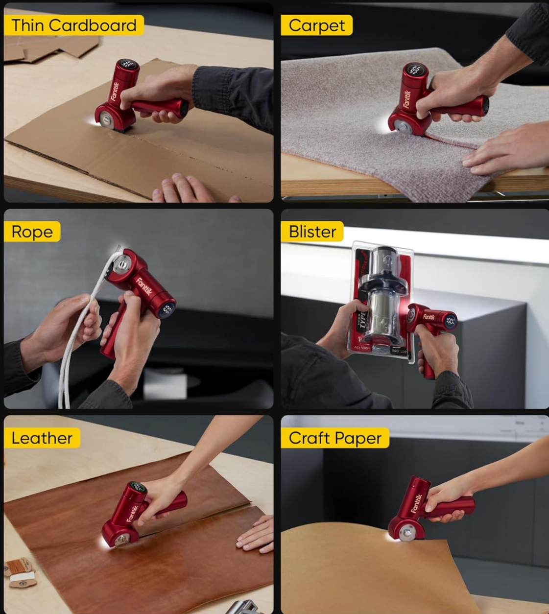
Image: Collage showing the Fanttik C8 Nano being used to cut thin cardboard, carpet, rope, blister packaging, leather, and craft paper.