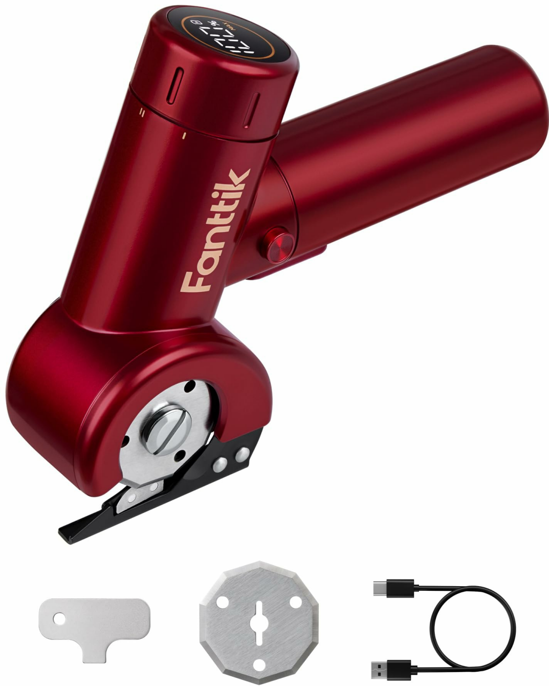
Image: Fanttik C8 Nano Cordless Electric Scissors, showcasing its compact design and cutting blade.