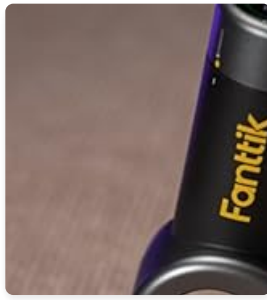
Image: The Fanttik C8 Nano connected to a Type-C charging cable, showing the charging port location.

display will indicate the battery life during charging.