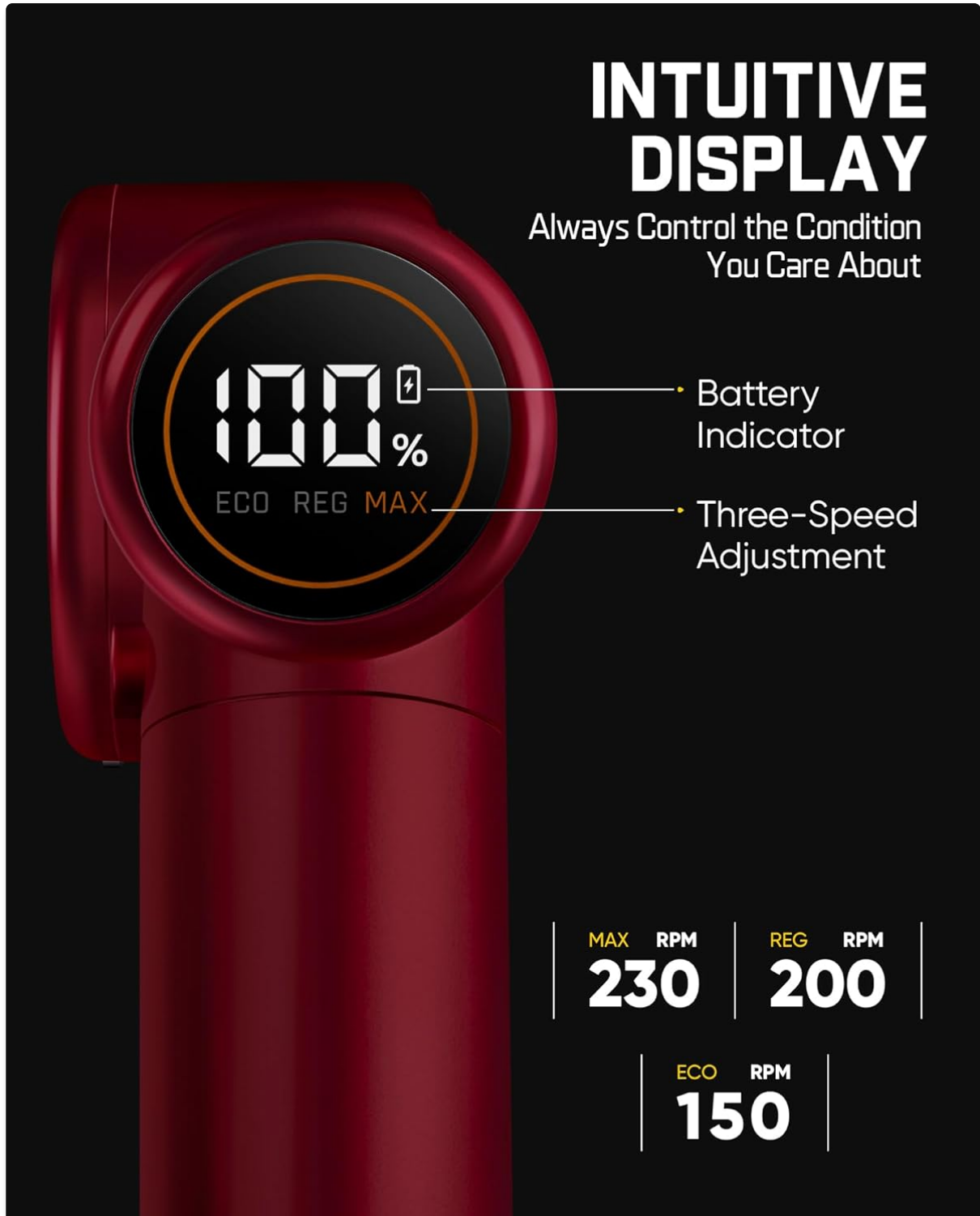
Image: The intuitive LED display of the Fanttik C8 Nano, showing battery percentage and selected speed mode (ECO, REG, MAX).