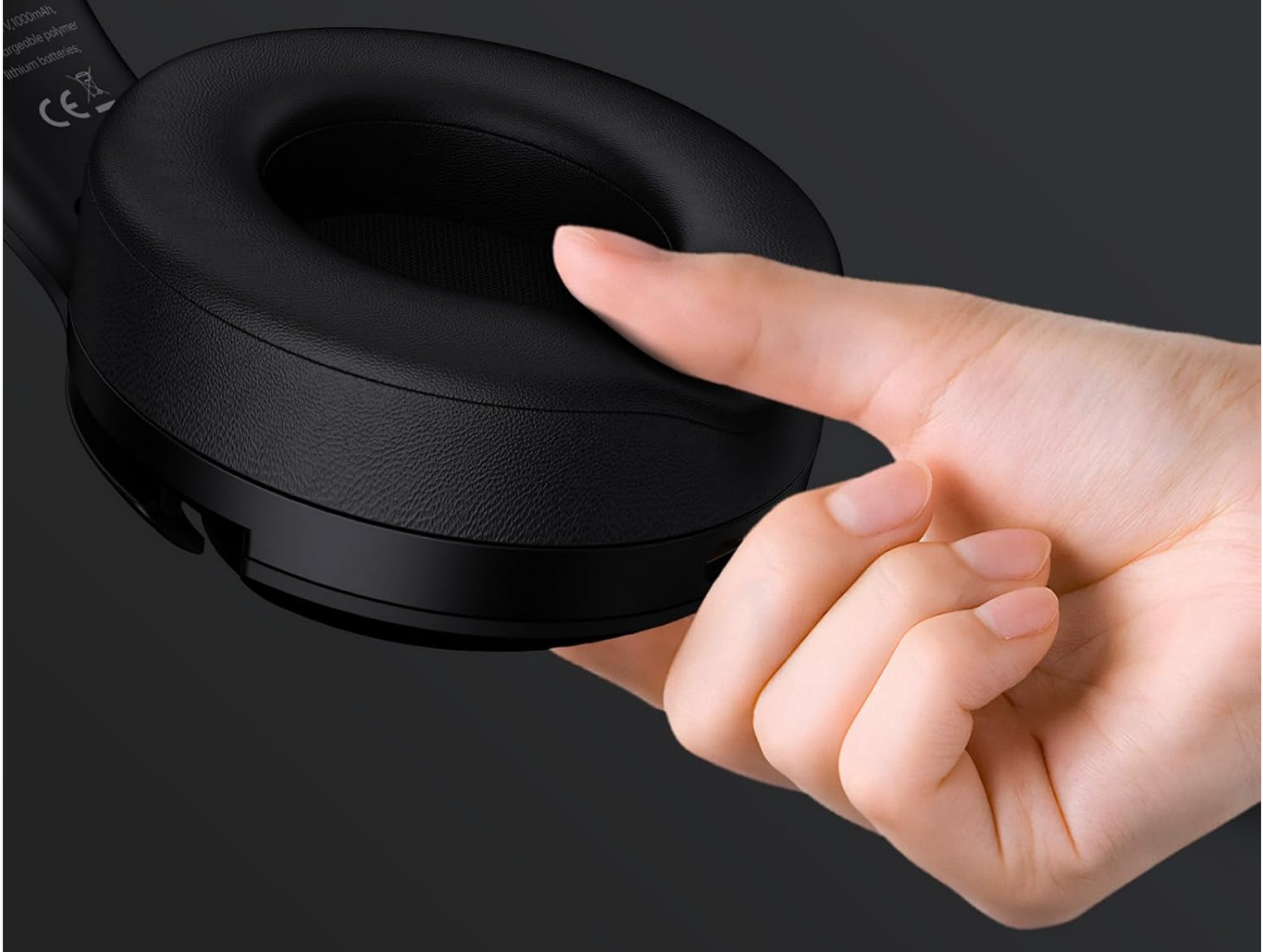
Image 3.2: Detachable noise-canceling microphone for clear communication.

Comfortable to wear, skin-friendly and breathable