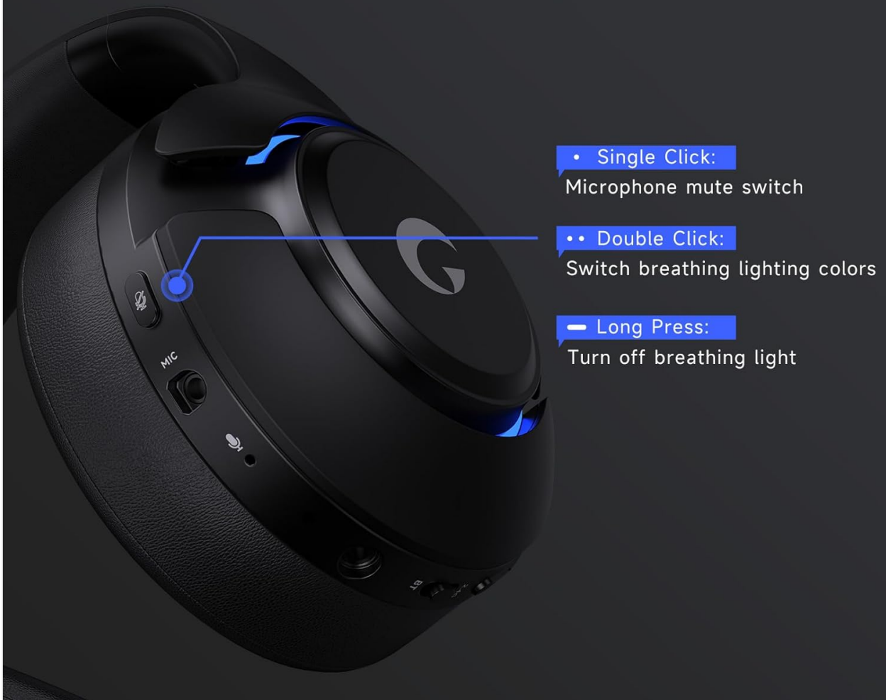
Image 3.1: Multi-function button for audio settings and RGB lights.

The headset features a multi-function button on the earcup for easy control: