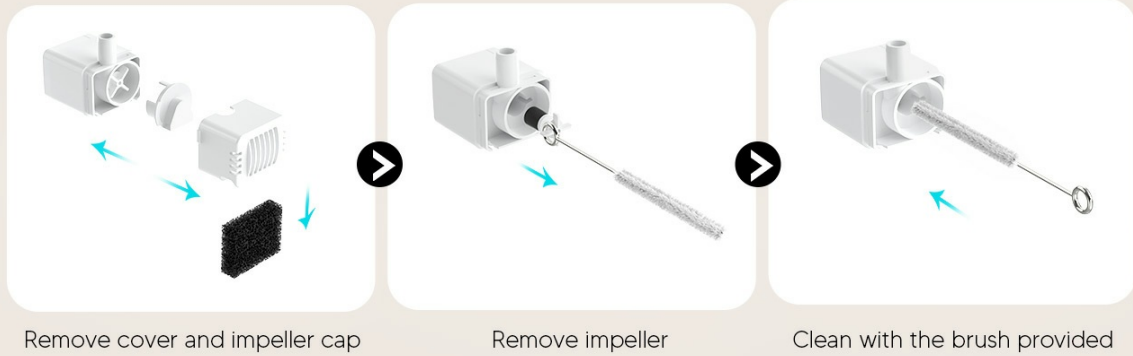
Image: Pump Cleaning Guide

Clean the pump weekly to prevent mineral buildup and ensure optimal performance: