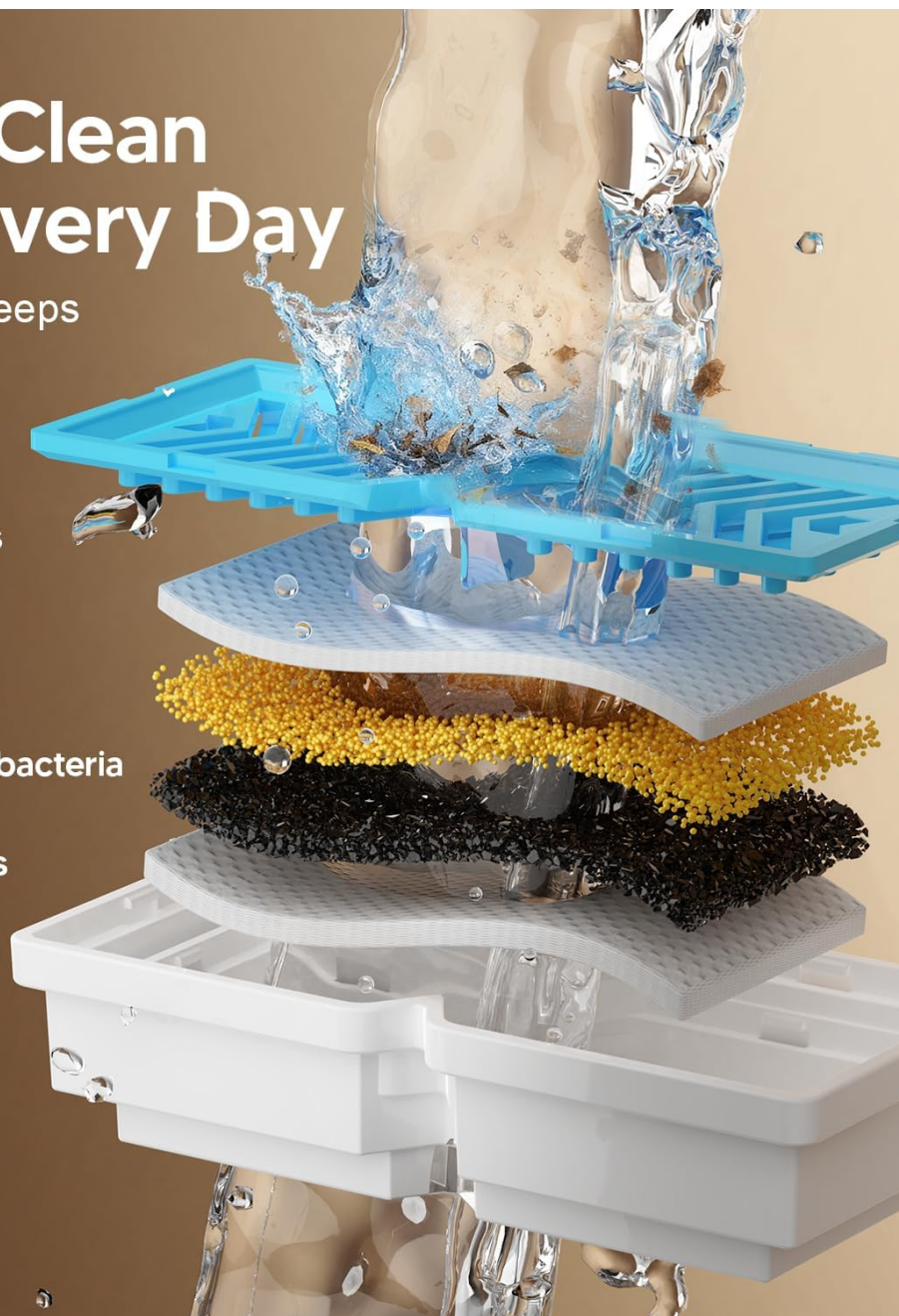
Image: 4-Layer Filtration System

The fountain utilizes a 4-layer filtration system to ensure clean and fresh water: