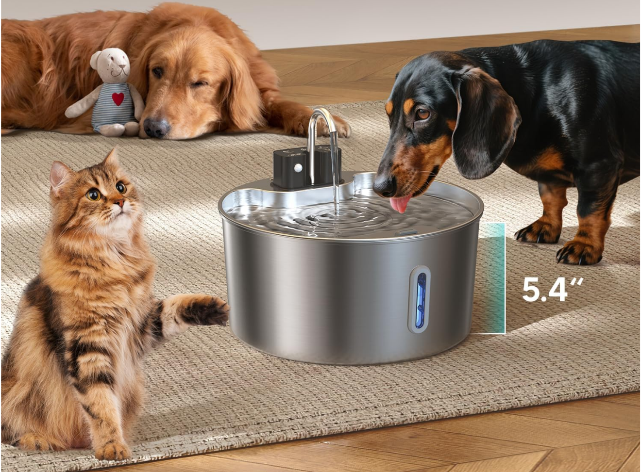
Image: Suitable for Various Pet Sizes