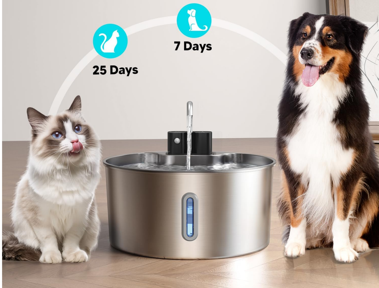
Image: 7L Large Capacity

Refill Just Once a Week for Endless Fresh Water!