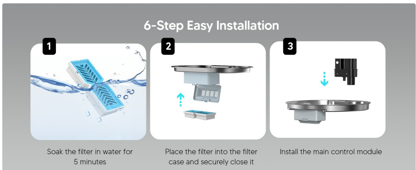
Image: 6-Step Easy Installation Guide

Follow these steps to correctly assemble and prepare your Voluas Dog Water Fountain for use.