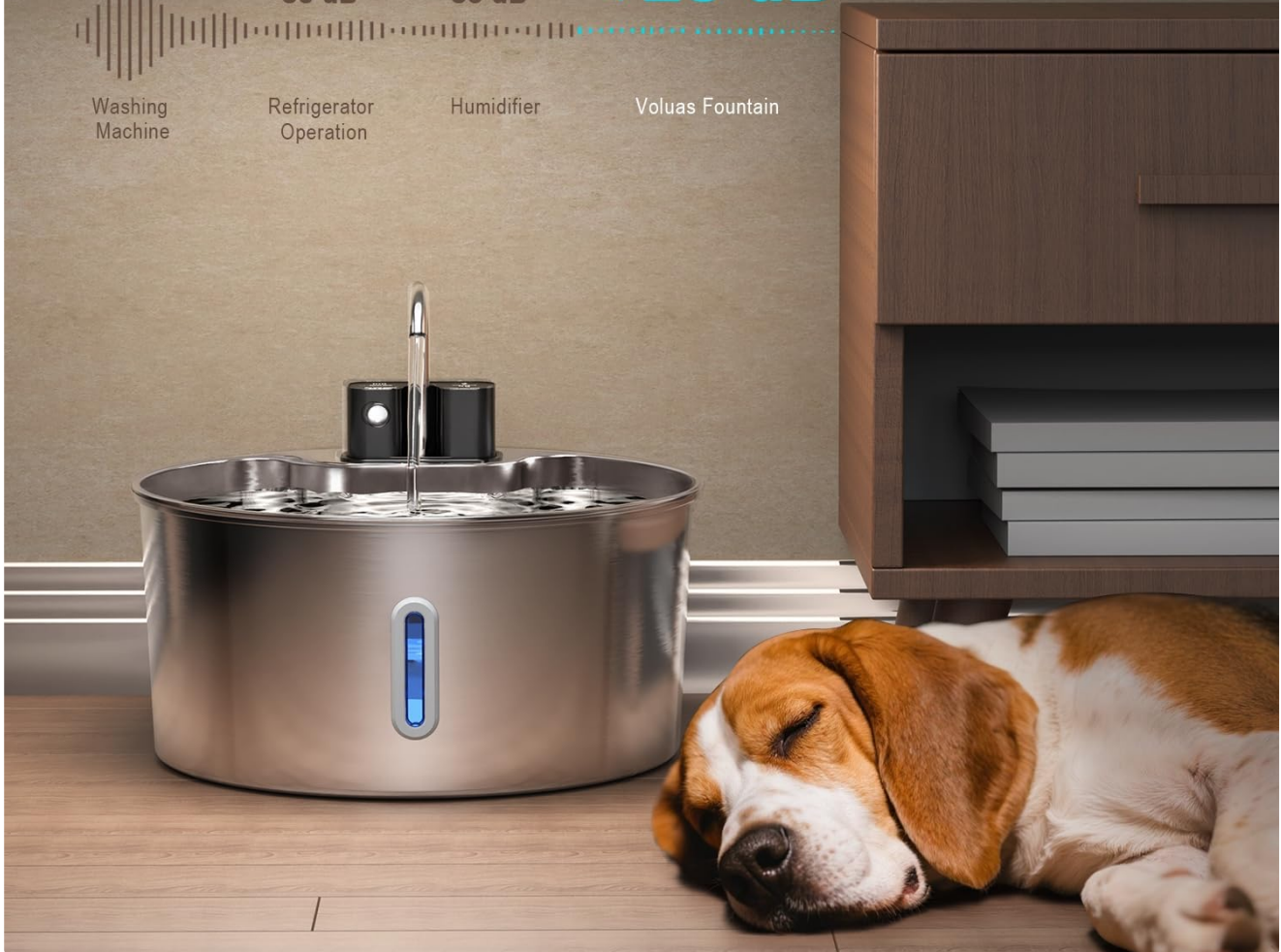
Image: Ultra-Silent Pump Operation

The ultra-quiet pump operates below 25dB, ensuring a peaceful environment for your pets and household.