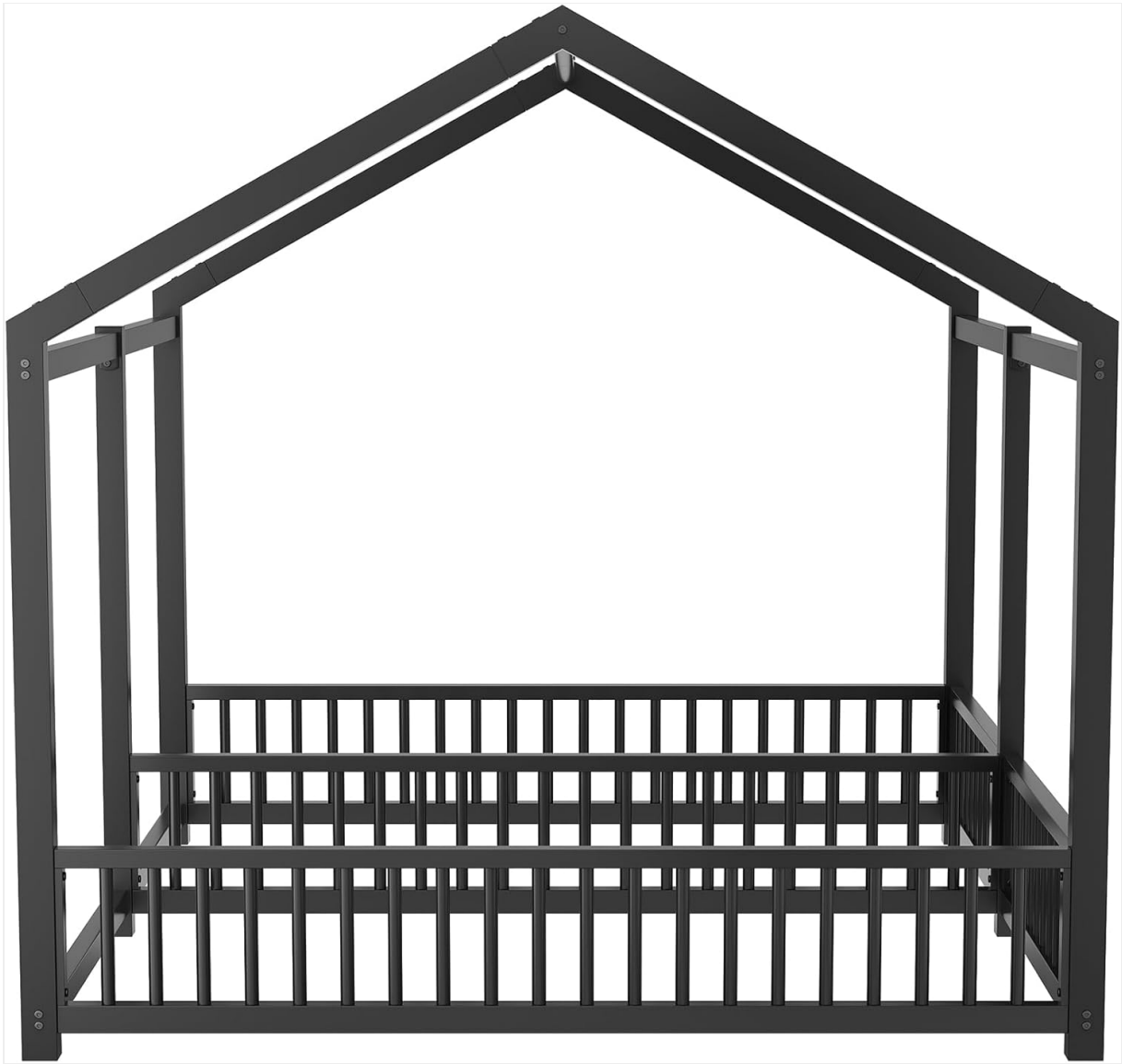
Image 4: Side view of the PVWIIK Double Montessori Floor Bed, highlighting the low profile and the height of the guardrails.