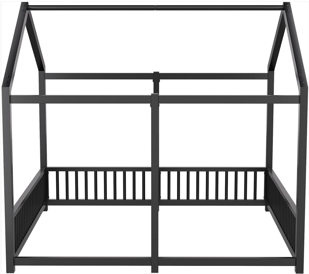
Image 3: Front view of the PVWIIK Double Montessori Floor Bed, showing the two distinct twin bed sections and the continuous guardrail.