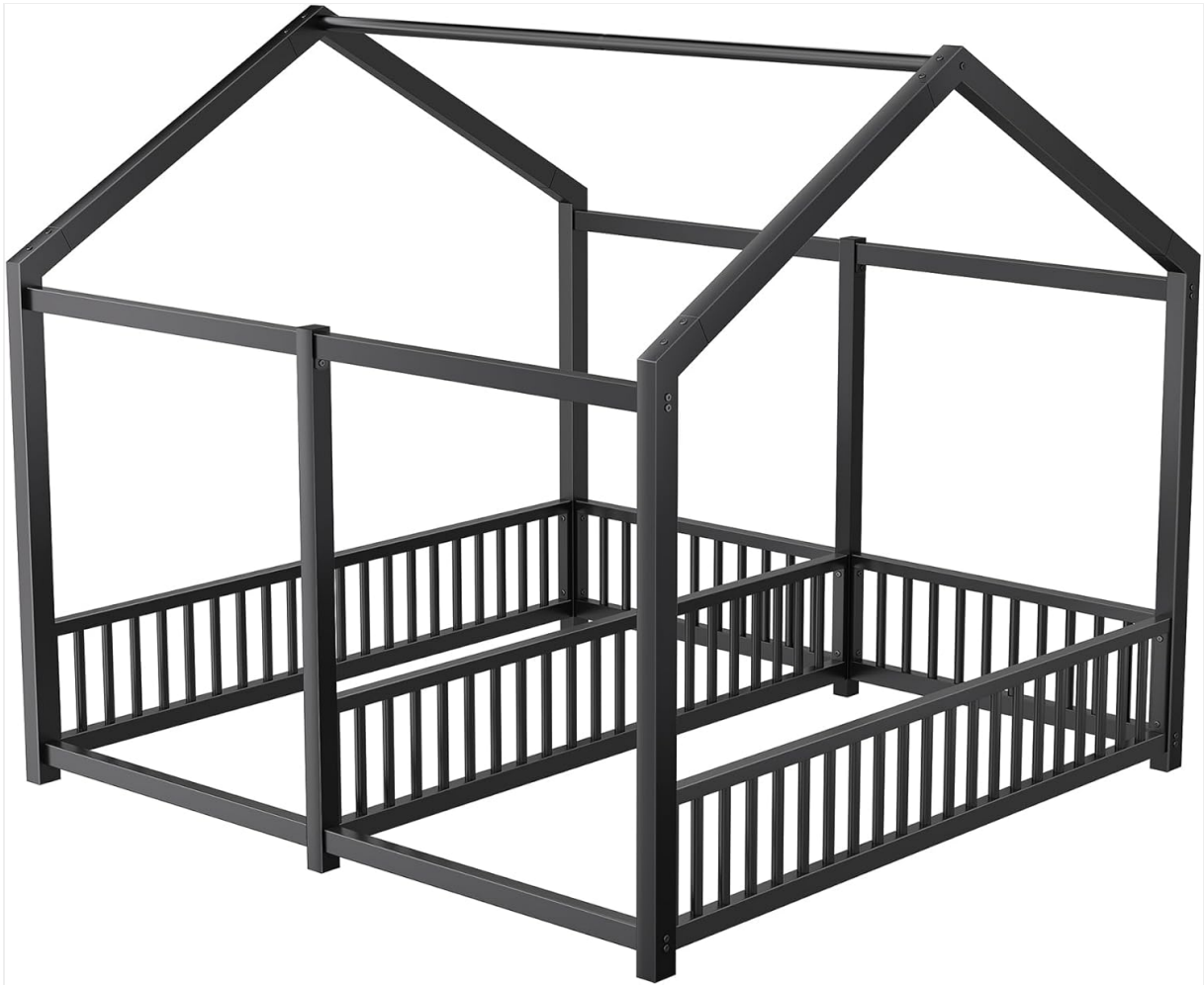
Image 2: Angled view of the PVWIIK Double Montessori Floor Bed, showcasing the dual twin platforms and the house-shaped roof structure.