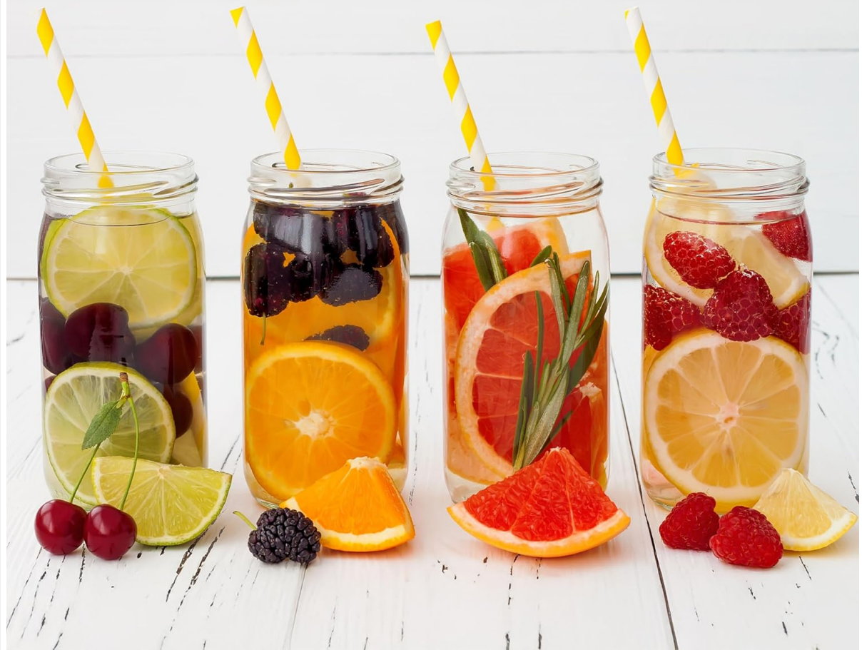
Image illustrating different fruit-infused beverages, demonstrating customization possibilities.

Before brewing, elevate your tea by adding sweeteners, fresh fruit, or fragrant herbs to the pitcher