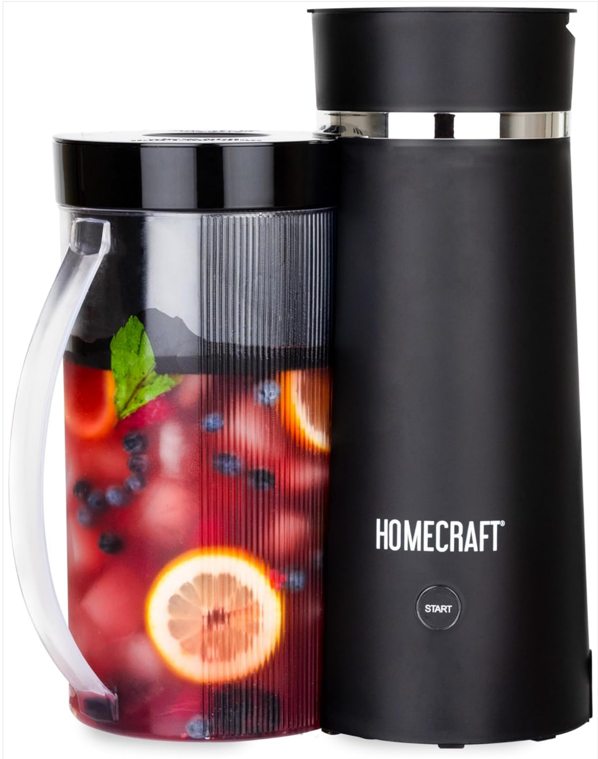
The Homecraft Iced Tea Maker and Cold Brew Coffee Machine, featuring its main components and a prepared beverage.

The Homecraft Iced Tea Maker & Cold Brew Coffee Machine allows you to brew a variety of iced beverages quickly and easily. It features a 2-quart double-insulated pitcher and a steeping basket for tea bags, loose leaf tea, or coffee grounds.