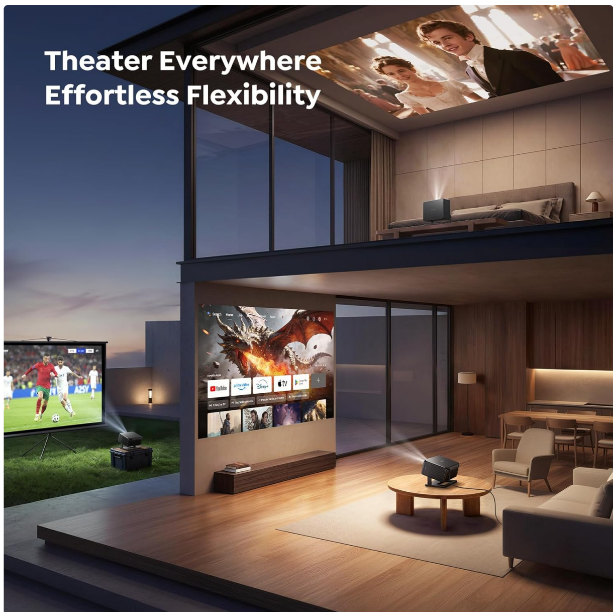
Image 4.2: The TOPTRO TP3 serving as a central entertainment hub with multiple connectivity options.