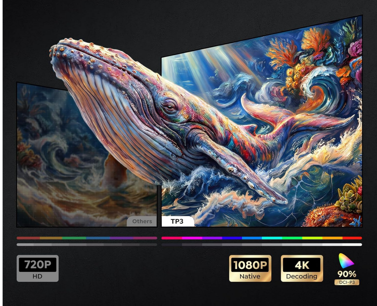
Image 3.2: Visual representation of the TOPTRO TP3's AI automatic adjustment features ensuring a perfect display.

Enjoy More Lifelike and Immersive Viewing Experience