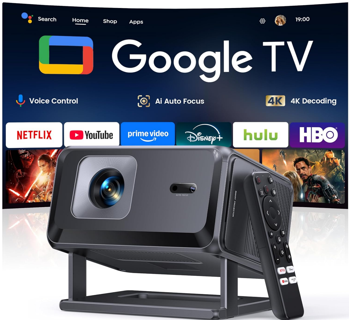
Image 1.1: The TOPTRO TP3 Smart Projector displaying its Google TV interface with popular streaming applications.