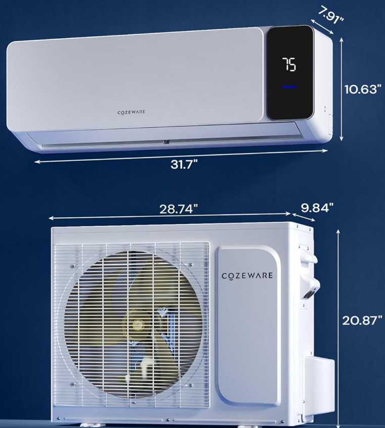
Image 11: Detailed dimensions and key specifications for the 12000 BTU Cozeware Mini Split Air Conditioner.