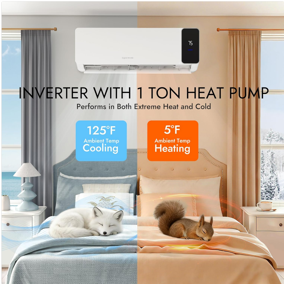
Image 2: The Cozeware Mini Split is designed to perform efficiently across a wide range of ambient temperatures, from 5°F for heating to 125°F for cooling.