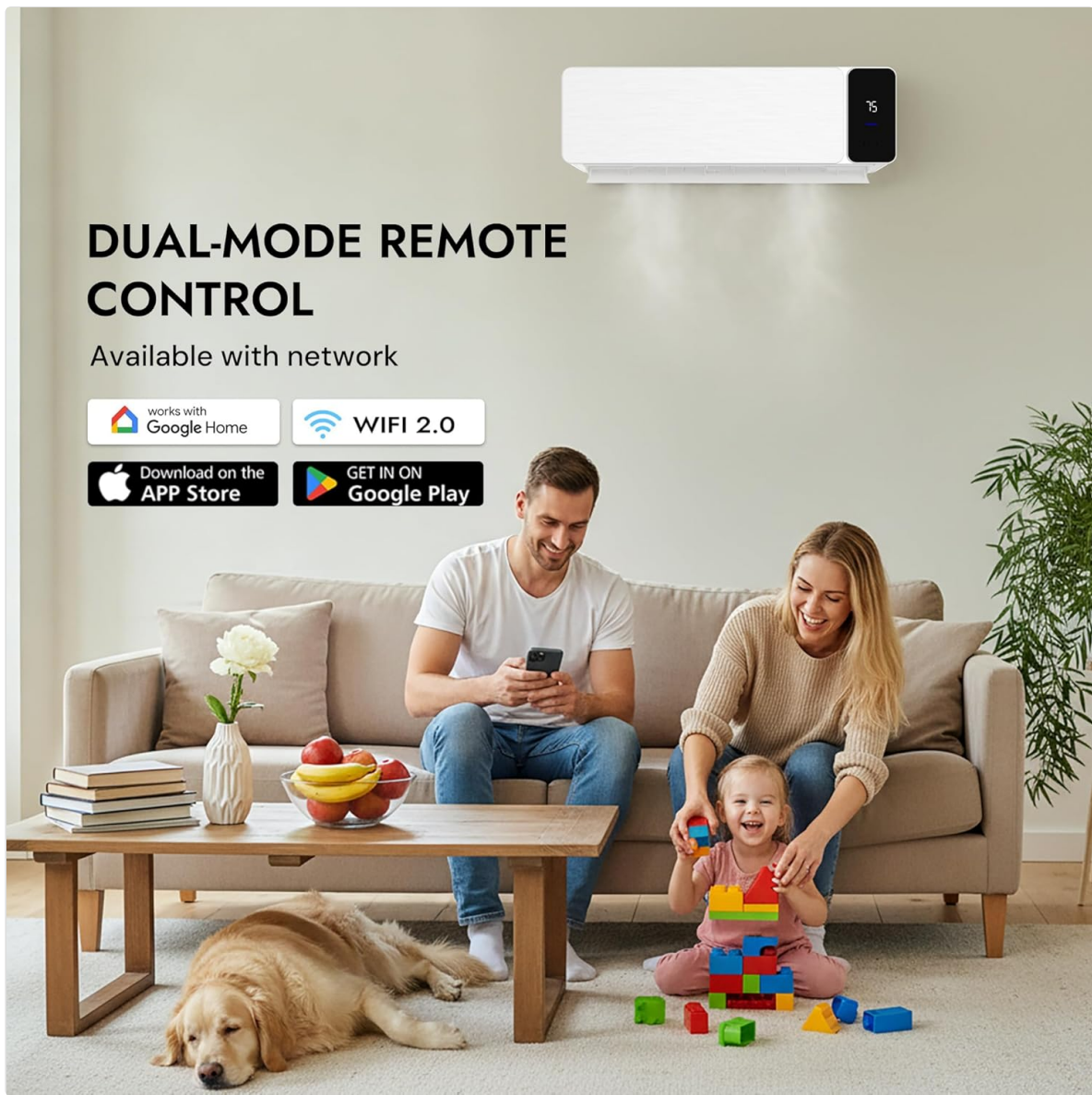
Image 7: The mini split can be controlled via a dual-mode remote control or through the COZEWARE app, which is compatible with Google Home and available on the App Store and Google Play.