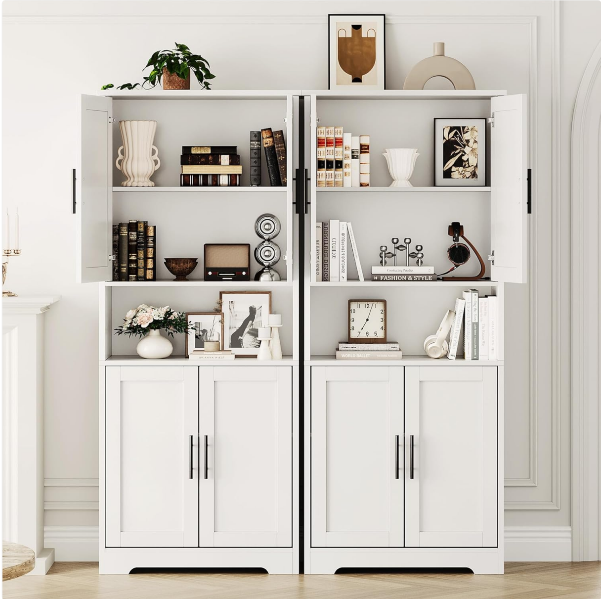
Image 3.1: Detailed view of key components: premium MDF board for durability, robust metal hinges for smooth door operation, and elegant handles for a refined finish.

Before assembly, verify that all components are present and undamaged. Refer to the packing list included in your product packaging for a complete itemized list. A spare parts pack is included for unexpected needs.