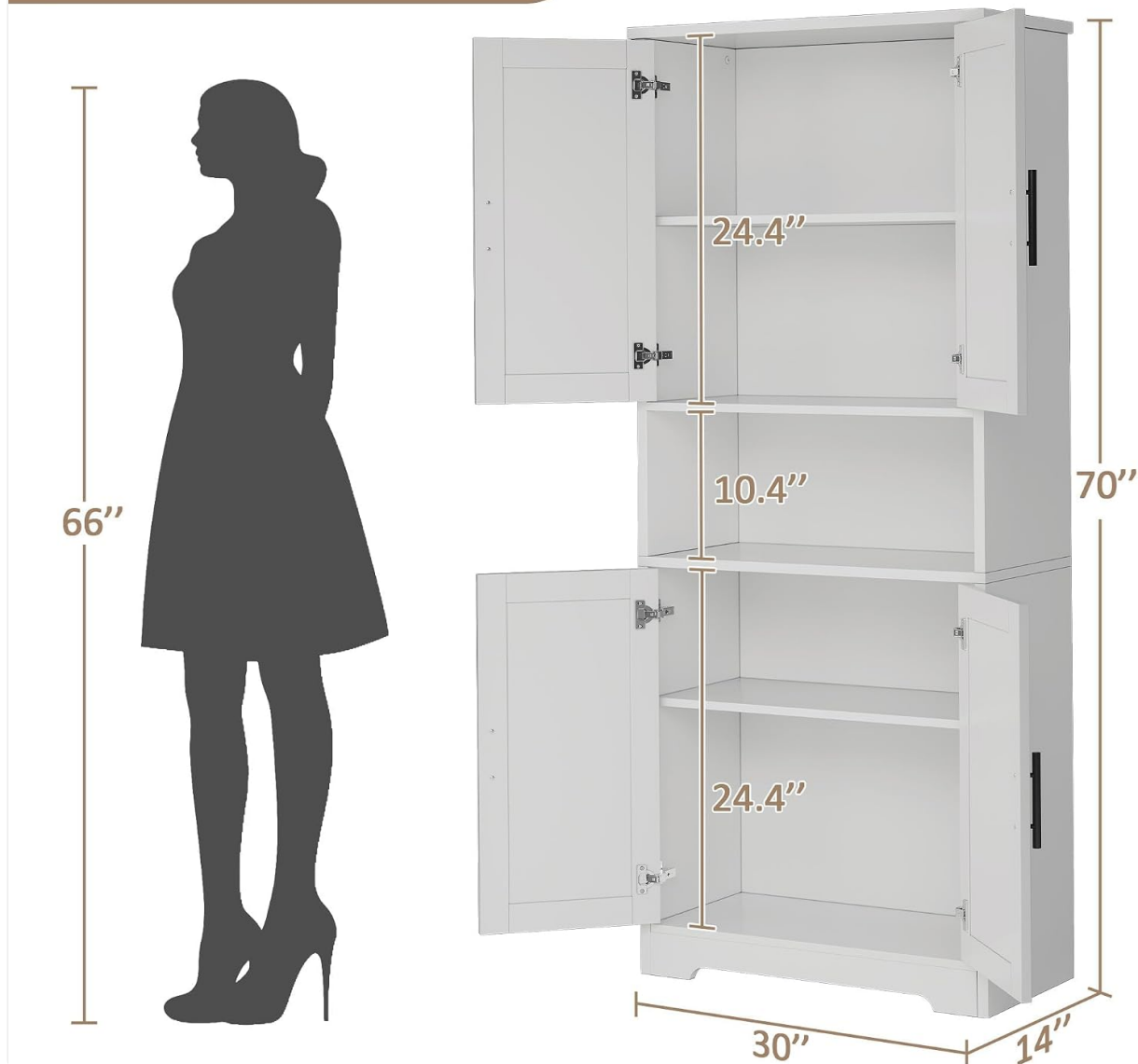
Image 1.1: The Garvee 70 Inch Tall Storage Cabinet, featuring a clean white finish and closed doors, ready for use in various home settings.