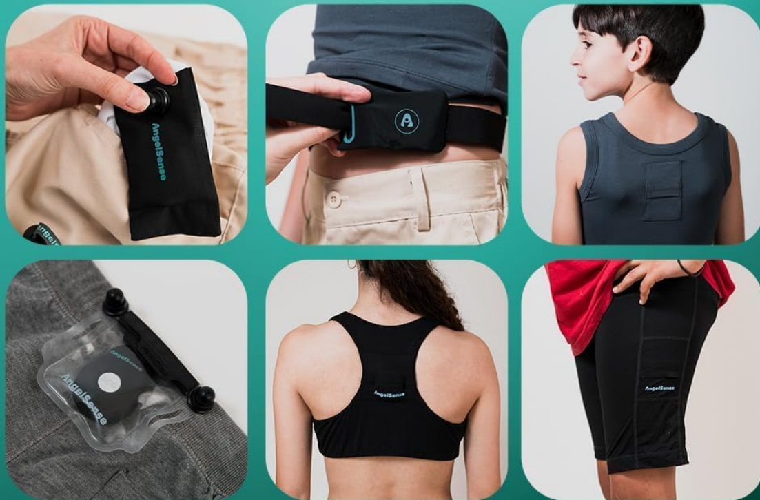
Figure 4: Sensory-Friendly Wearing Options

Keeps securely in place no matter the activity or behavior