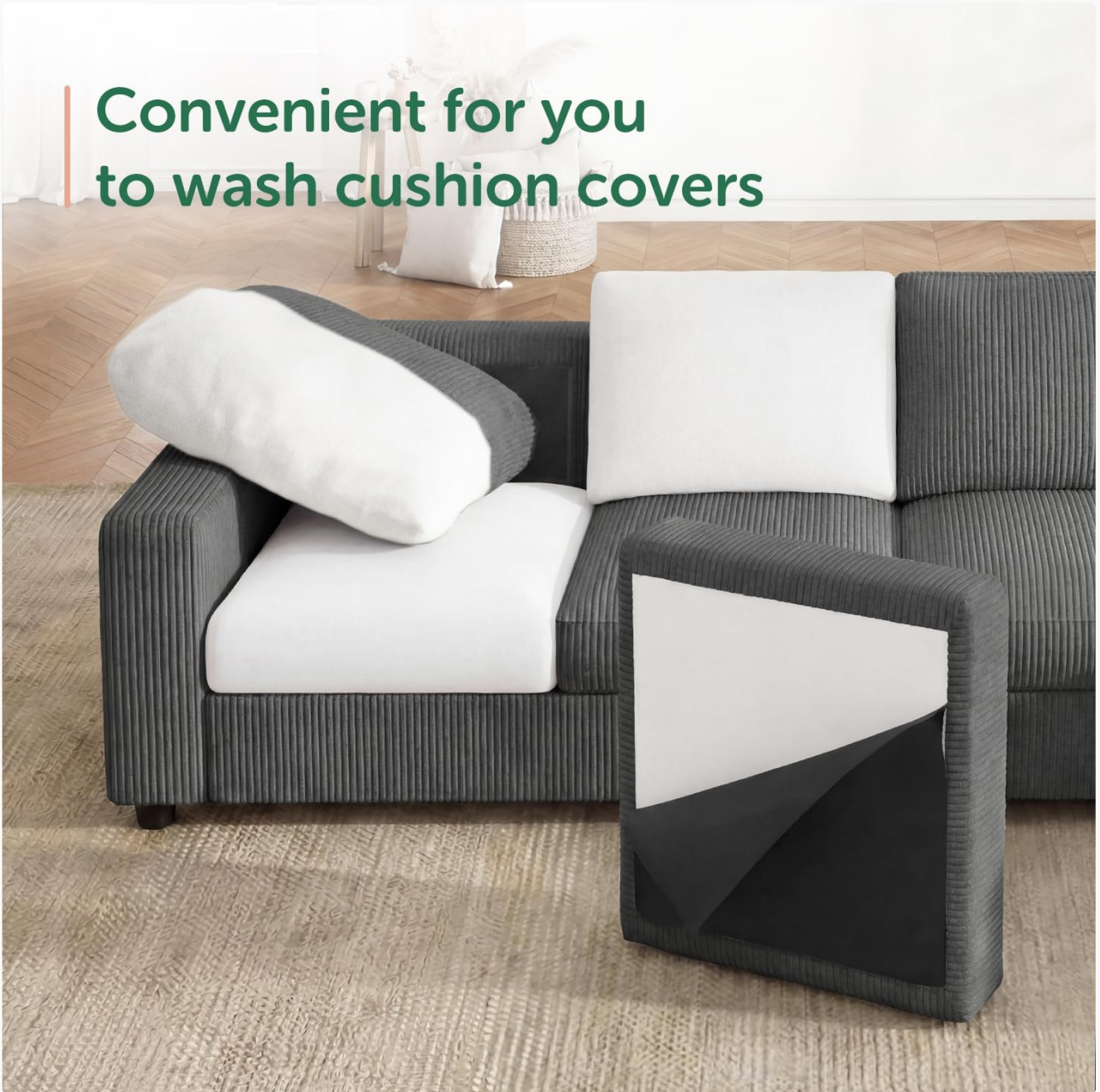
Image 6.1: Removable cushion covers simplify cleaning and maintenance.