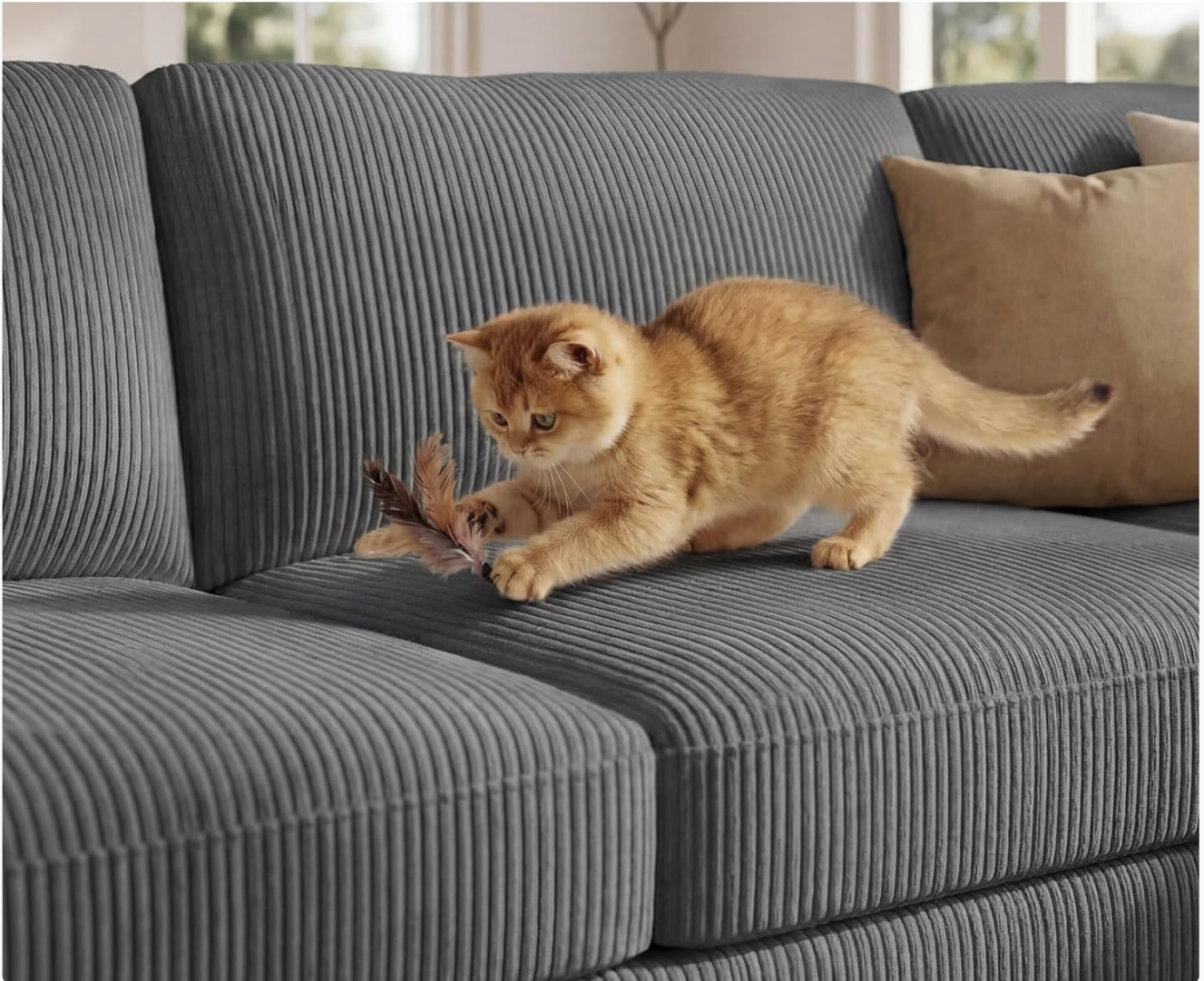
Image 5.2: The corduroy fabric is designed for durability and comfort, even with pets.