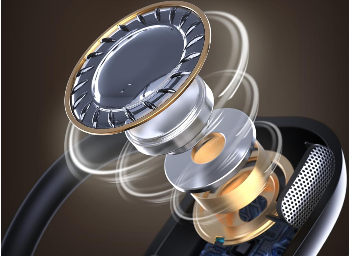
Image: Detailed view of the 16.3mm dynamic driver, highlighting the HI-FI stereo sound capability of the CXK O34 headphones.

Enjoy immersive audio sound quality with 16.3 dynamic drivers