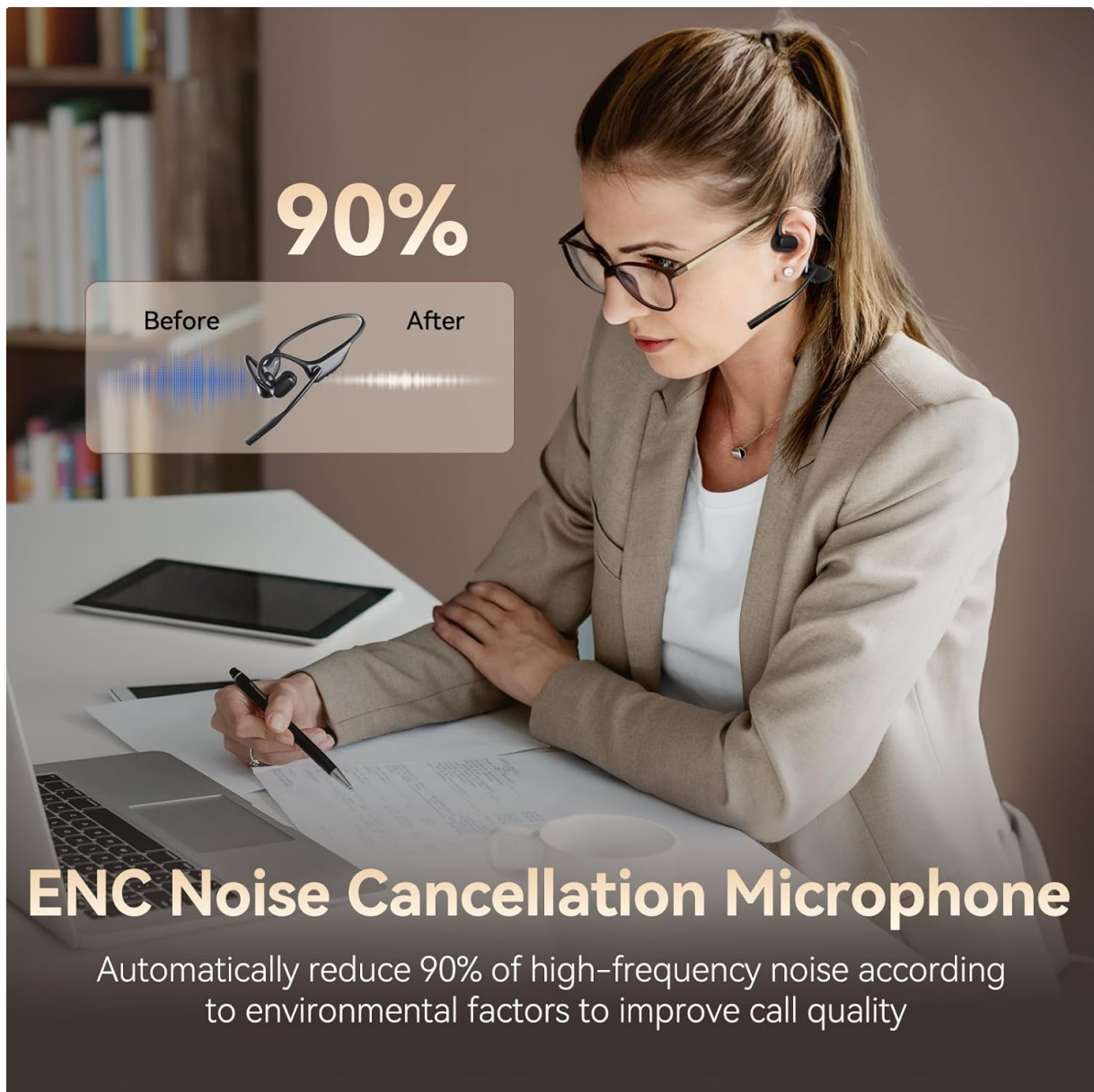
Image: Illustration demonstrating the AI Noise Cancellation Microphone's effectiveness in reducing background noise for clearer calls.