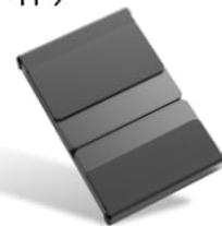
Image: The Ewin keyboard, USB-C cable, and instruction manual as typically found in the product package.