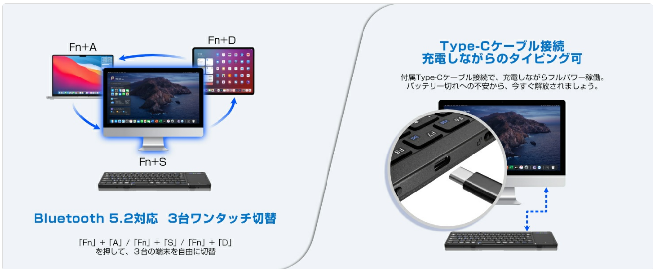
Image: A diagram illustrating how to switch between three paired Bluetooth devices using Fn+A, Fn+S, and Fn+D keys.