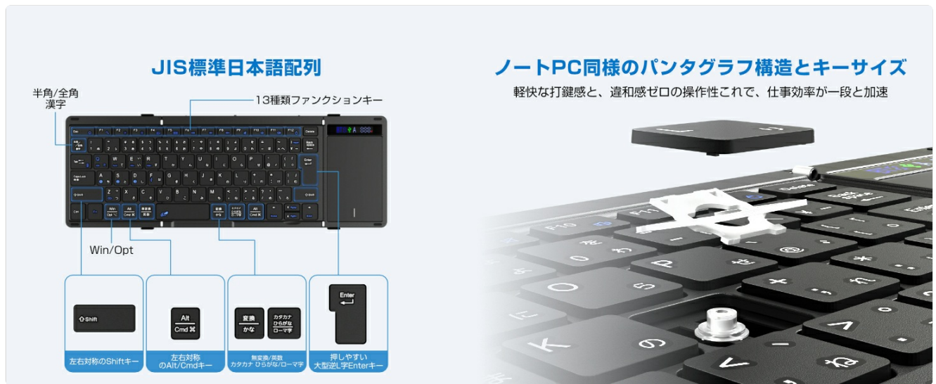
Image: A detailed view of the Ewin keyboard's JIS Japanese layout, showing the placement of the large Enter key, symmetrical Shift keys, and 13 function keys. The scissor-switch mechanism is also illustrated.

The keyboard features a JIS standard Japanese layout with a large inverted L-shaped Enter key and symmetrical Shift keys for comfortable typing. It includes 13 dedicated function keys for various shortcuts.