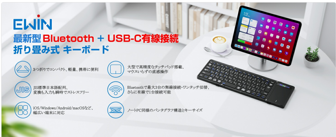
Image: The Ewin keyboard in its unfolded state, highlighting the display screen for connection and battery status, and a detail of the hinge lock for stable typing.

Unfold the keyboard to automatically power it on. Fold the keyboard to power it off and protect the keys. The hinge lock mechanism ensures stability when unfolded.