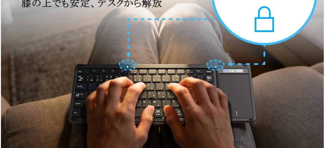
Image: The Ewin Wireless Foldable Bluetooth Keyboard, showcasing its compact, folded form and its full-size, unfolded layout with an integrated touchpad.