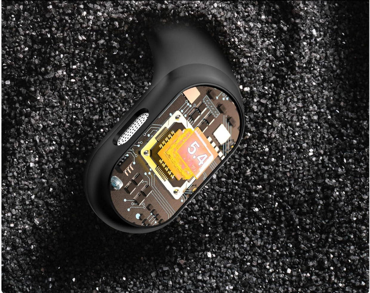
Image: An internal view of the QXUFV QX68 earbud, emphasizing its Bluetooth 5.4 chip for stable and fast wireless connectivity.