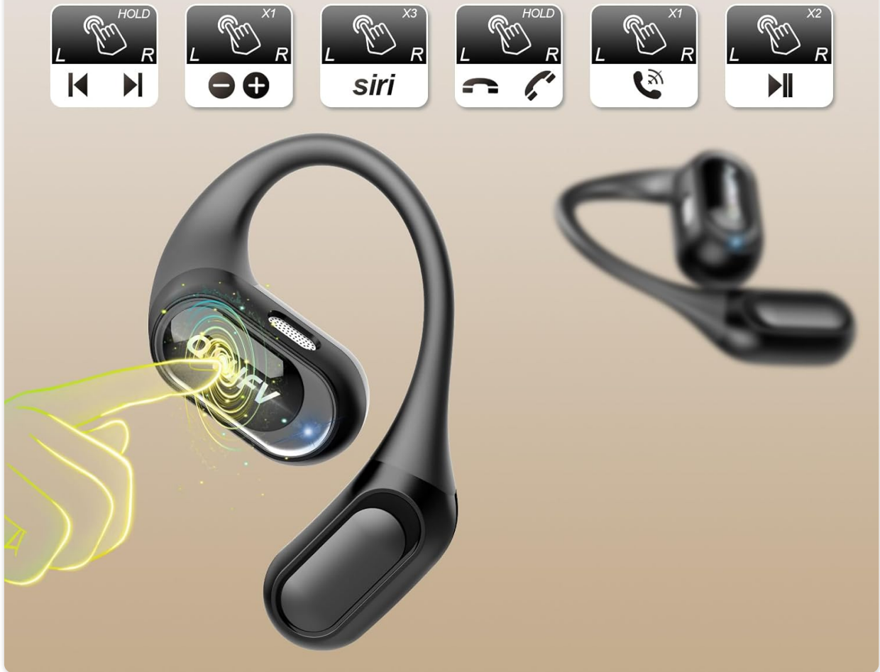
Image: A visual guide to the touch controls on the QXUFV QX68 earbuds, detailing actions for music, calls, and voice assistant.

Music incoming calls can be controlled at any time