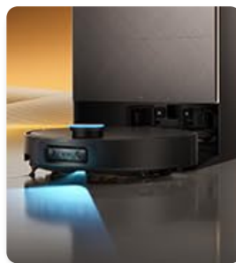
Figure 5: The powerful 35,000Pa suction and DuoBrush system for deep cleaning.