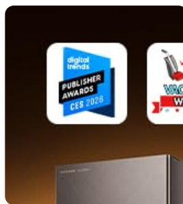
Figure 1: DREAME X60 Max Ultra Complete Robot Vacuum showcasing its ultra-thin design for reaching under furniture.

The DREAME X60 Max Ultra Complete integrates cutting-edge technology for superior cleaning. Its ultra-thin profile allows it to access hard-to-reach areas, while dual AI cameras and proactive illumination ensure precise navigation and obstacle avoidance. The enhanced DuoBrush system delivers powerful suction and tangle-free performance. The robot also features hot water mopping and a 10-in-1 multifunctional dock for automated maintenance.