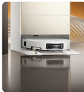
Figure 6: MopExtend RoboSwing and SideReach features for thorough edge and corner cleaning.