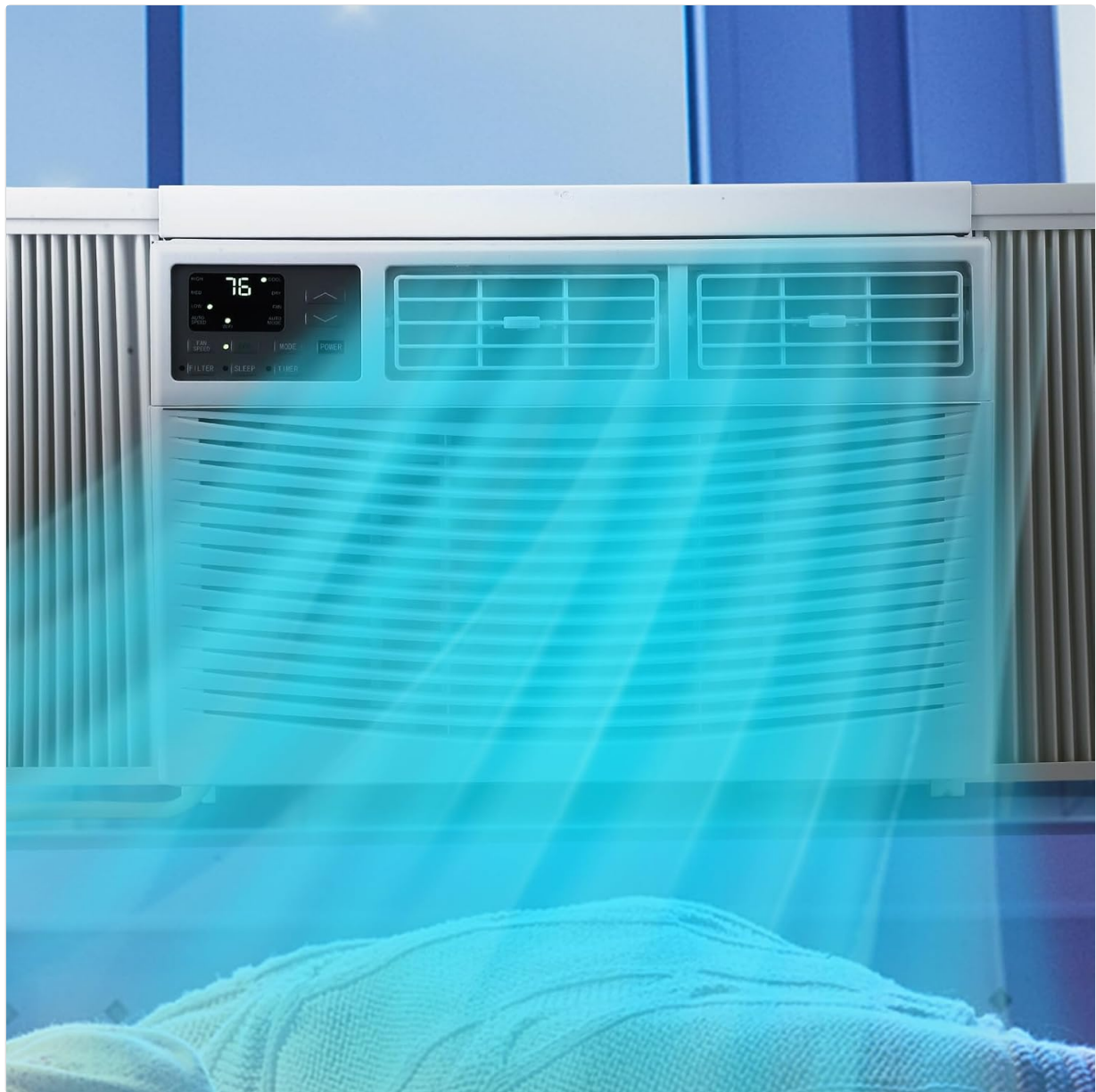
Image: Close-up view of the Garvee 10000 BTU Window AC unit's digital control panel and display, indicating current temperature settings.