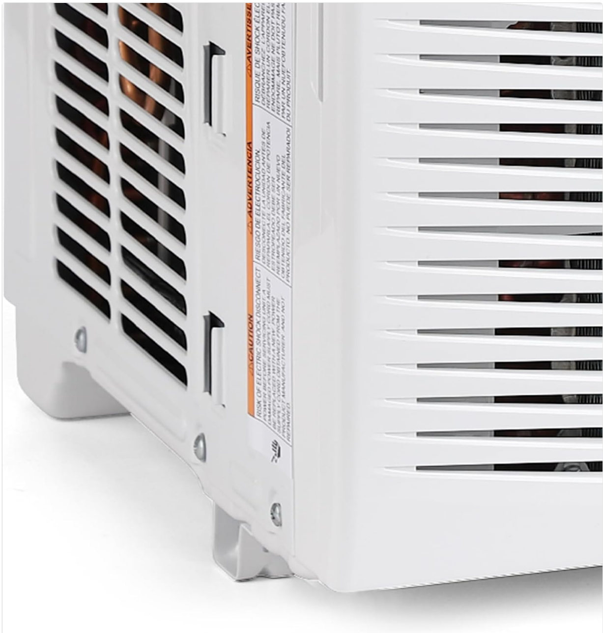
Image: Close-up of the adjustable horizontal and vertical louvers on the Garvee 10000 BTU Window AC unit, allowing for directional airflow control.