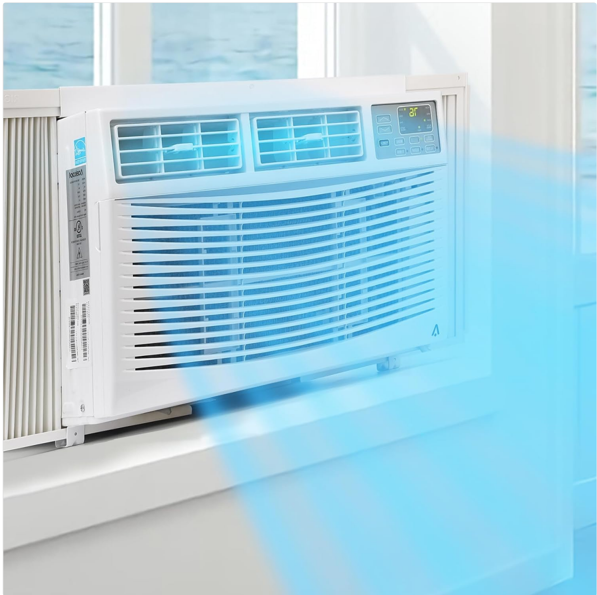
Image: Garvee 10000 BTU Window AC unit installed in a window, showing cool air flow from the vents. This illustrates a properly installed unit.