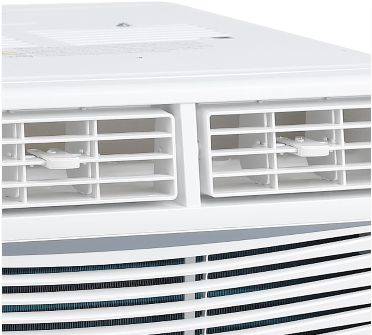
Image: Close-up of the Garvee 10000 BTU Window AC unit's front grille, behind which the air filter is located for easy access and cleaning.