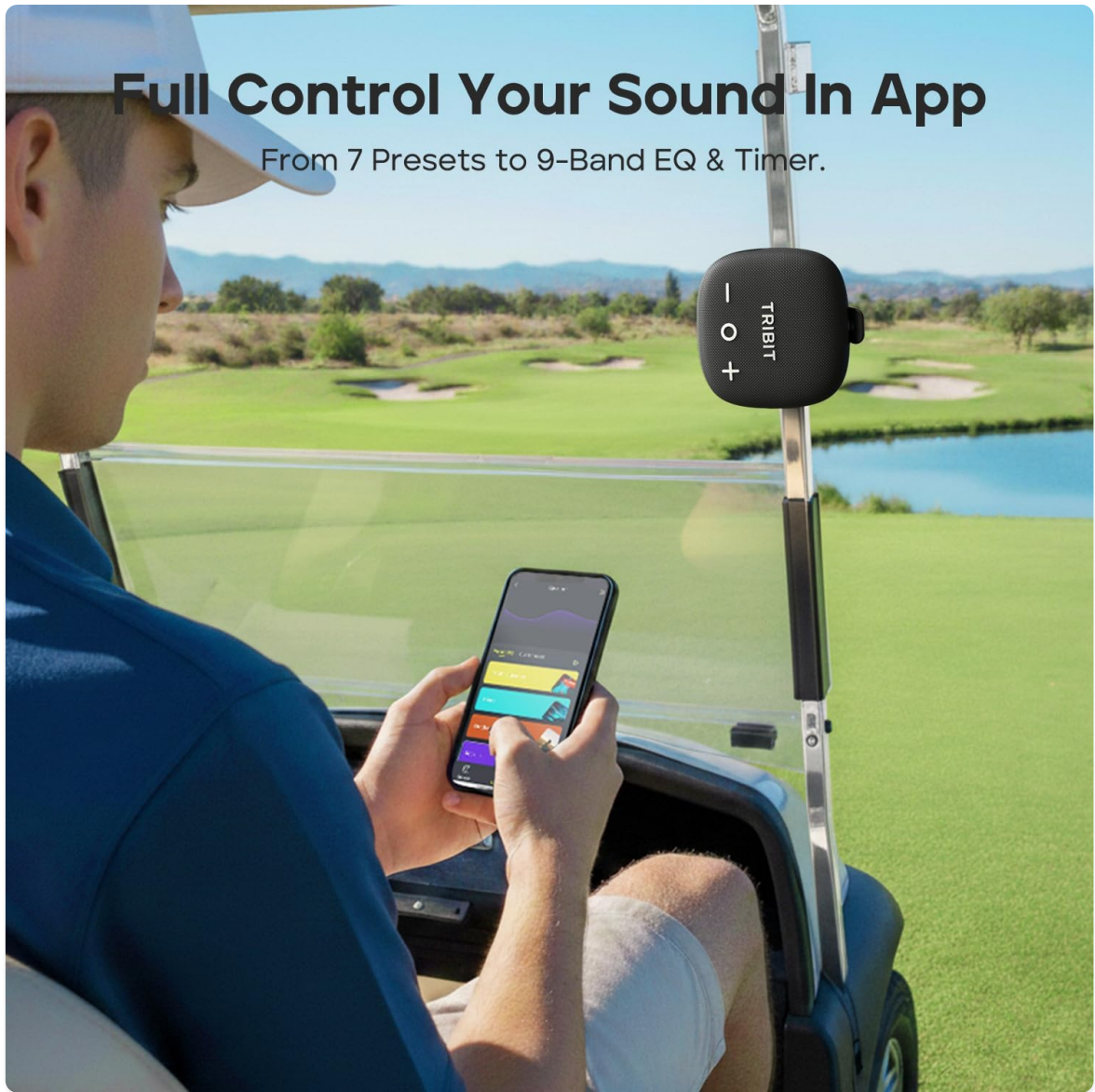
Image: A man in a golf cart using the Tribit App on his smartphone to control the Tribit StormBox Micro 3 speaker, showing the app's equalizer and preset options.