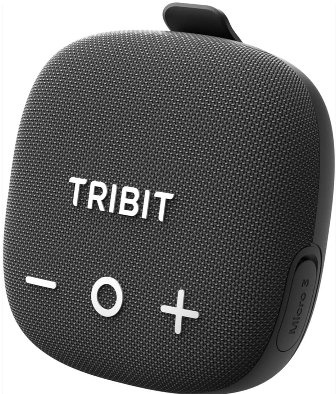
Image: The Tribit StormBox Micro 3 Portable Bluetooth Speaker in black, showcasing its compact design and front grille.