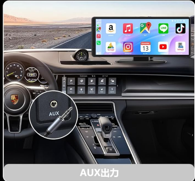
Image: A collage demonstrating the four audio output options: built-in speaker, Bluetooth connection, FM transmission, and AUX cable connection to the car's audio system.