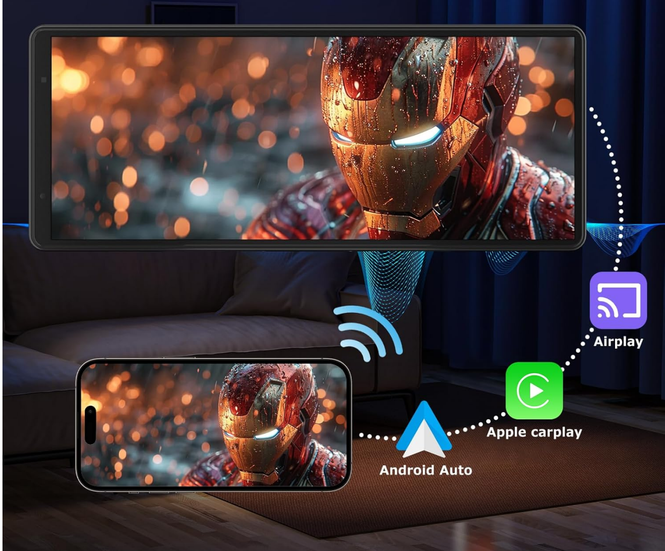
Image: An illustration of wireless mirroring functionality, showing a smartphone screen duplicated on the 8.1-inch display, alongside Apple CarPlay and Android Auto icons.