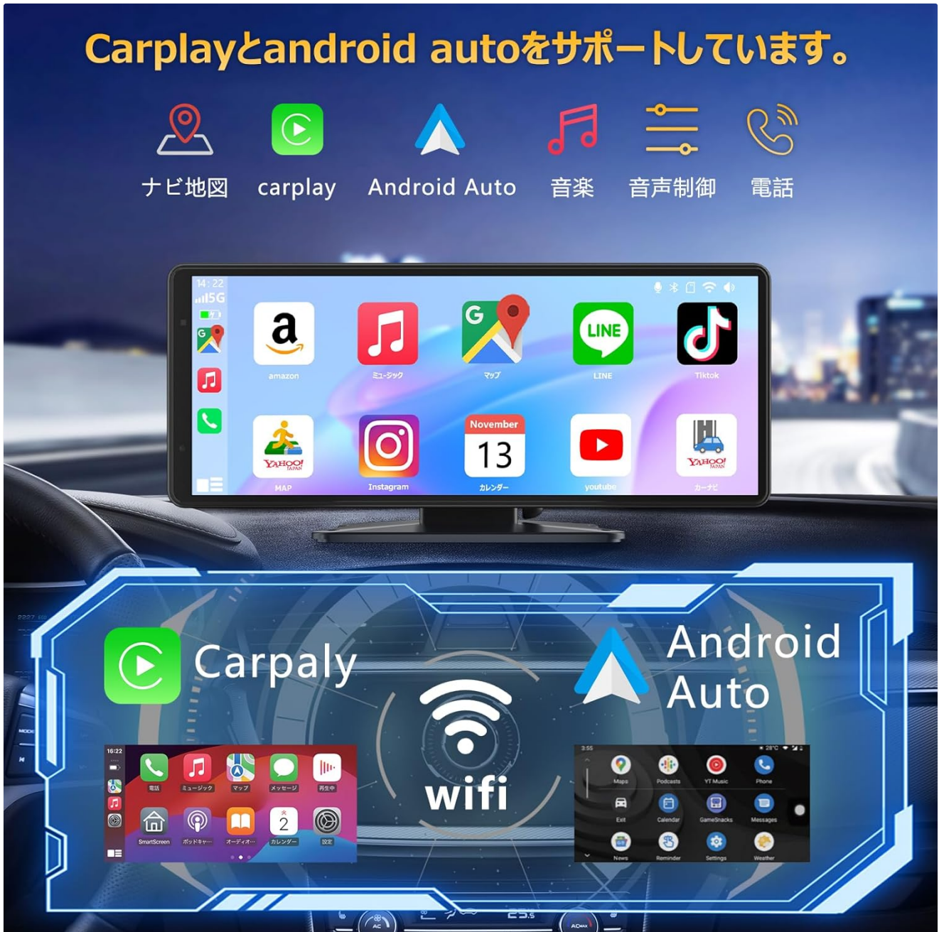
Image: The display showing both CarPlay and Android Auto interfaces, illustrating support for navigation, music, voice control, and phone functions.

4. Use voice commands (Siri/Google Assistant) for hands-free operation of navigation, music, and calls.