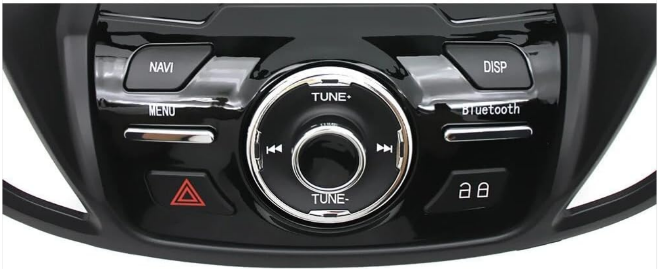
Image: Close-up of the car radio's controls and display.