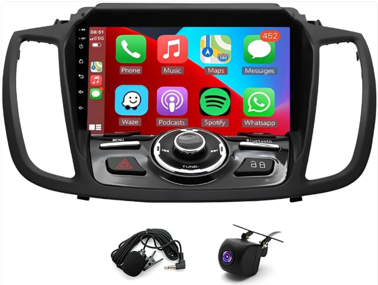
Image: Android interface displaying various applications.