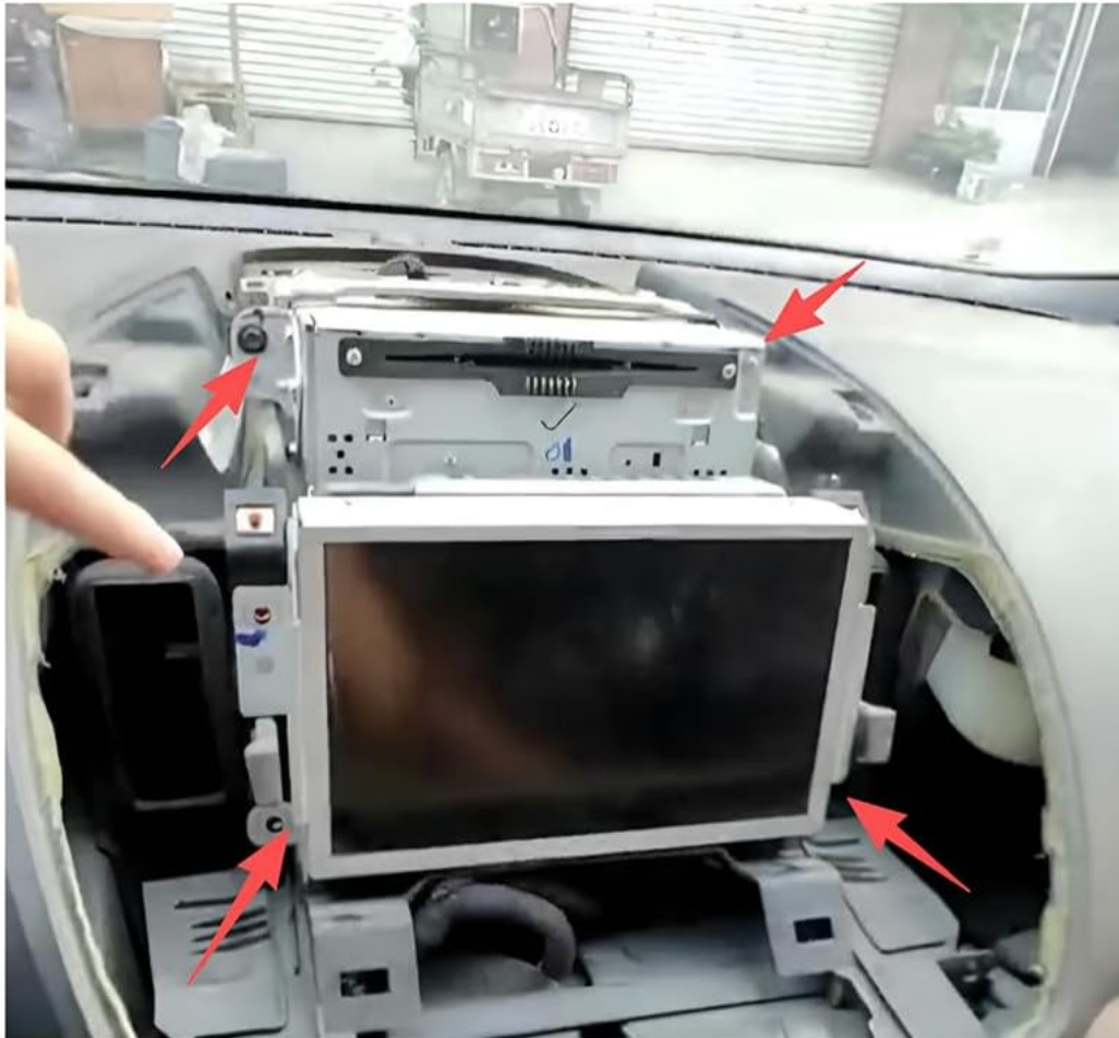
Image: Steps for removing the original CD unit in high-trim models.