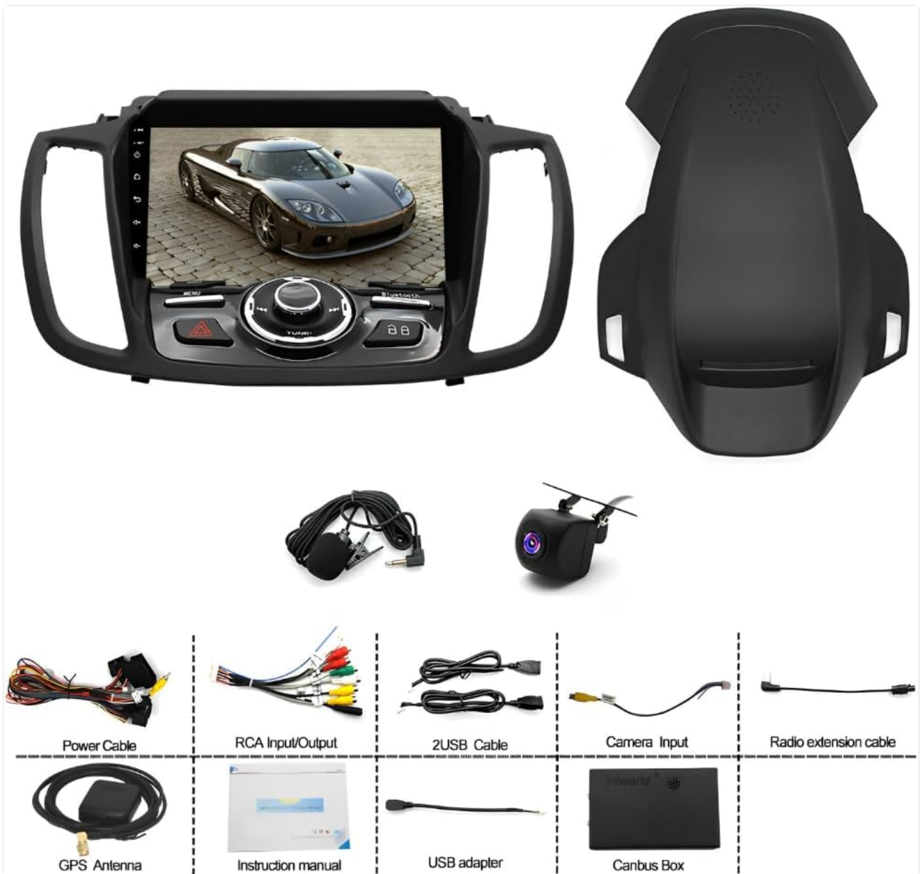
Image: Overview of all components included in the moseiny car radio package.