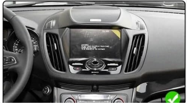
Image: Main interface of the car radio with various applications.