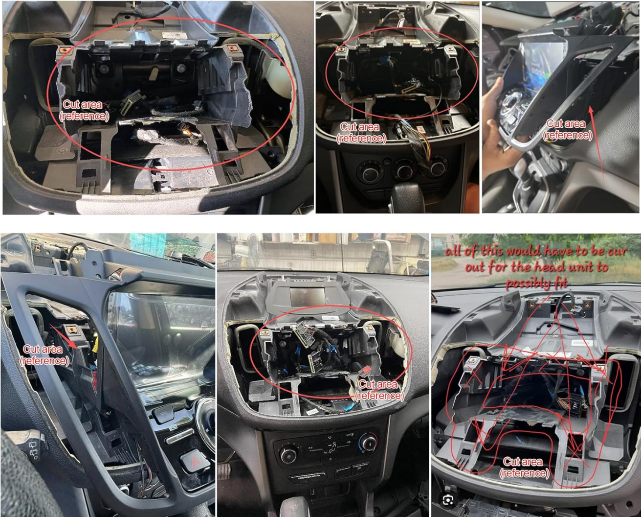
Image: Reference guide for dashboard cutting areas in screenless/low-configuration models.

Screenless Low-Configuration Models: Minor installation cutting required (area varies by vehicle, easy to operate). Reference only for common cutting areas shown. Professional installation recommended.