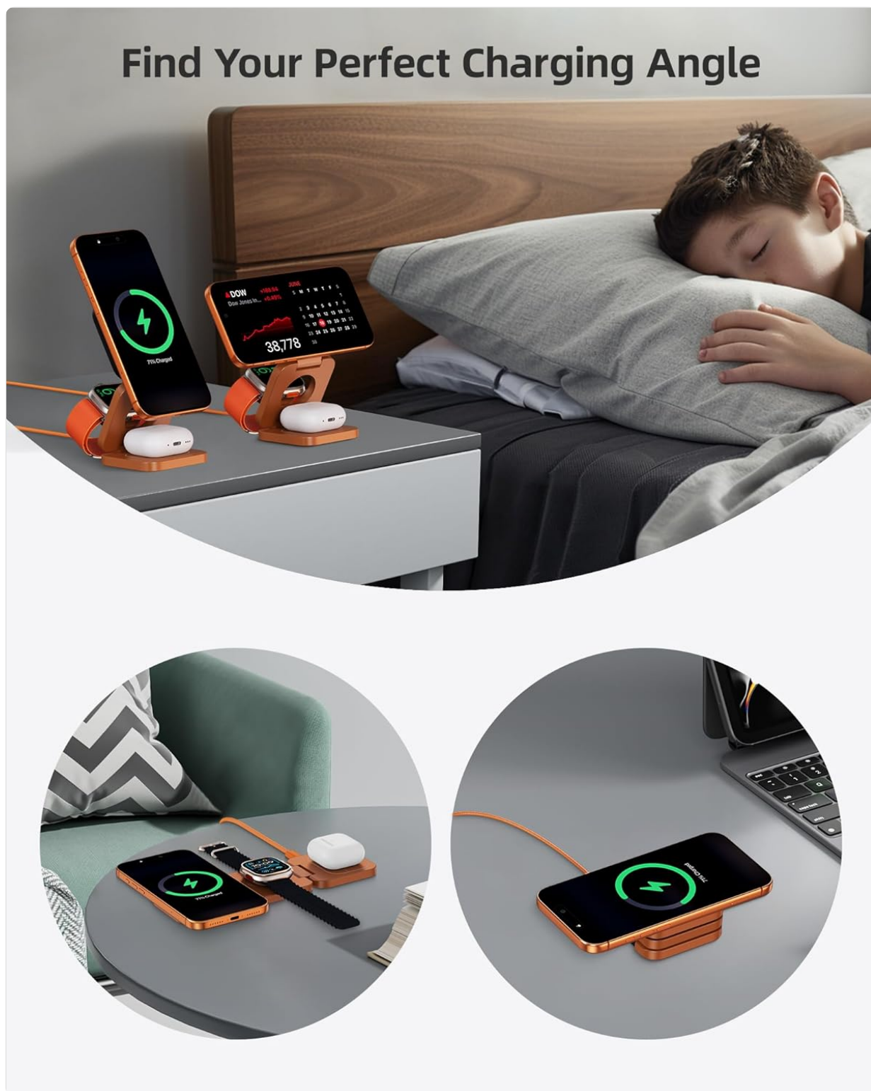
Image: The charging station in an upright position, ready to charge multiple devices, demonstrating adjustable phone charging angles.