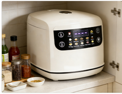
Image 2.1: The rice cooker positioned on a kitchen counter, demonstrating its compact footprint suitable for various spaces.