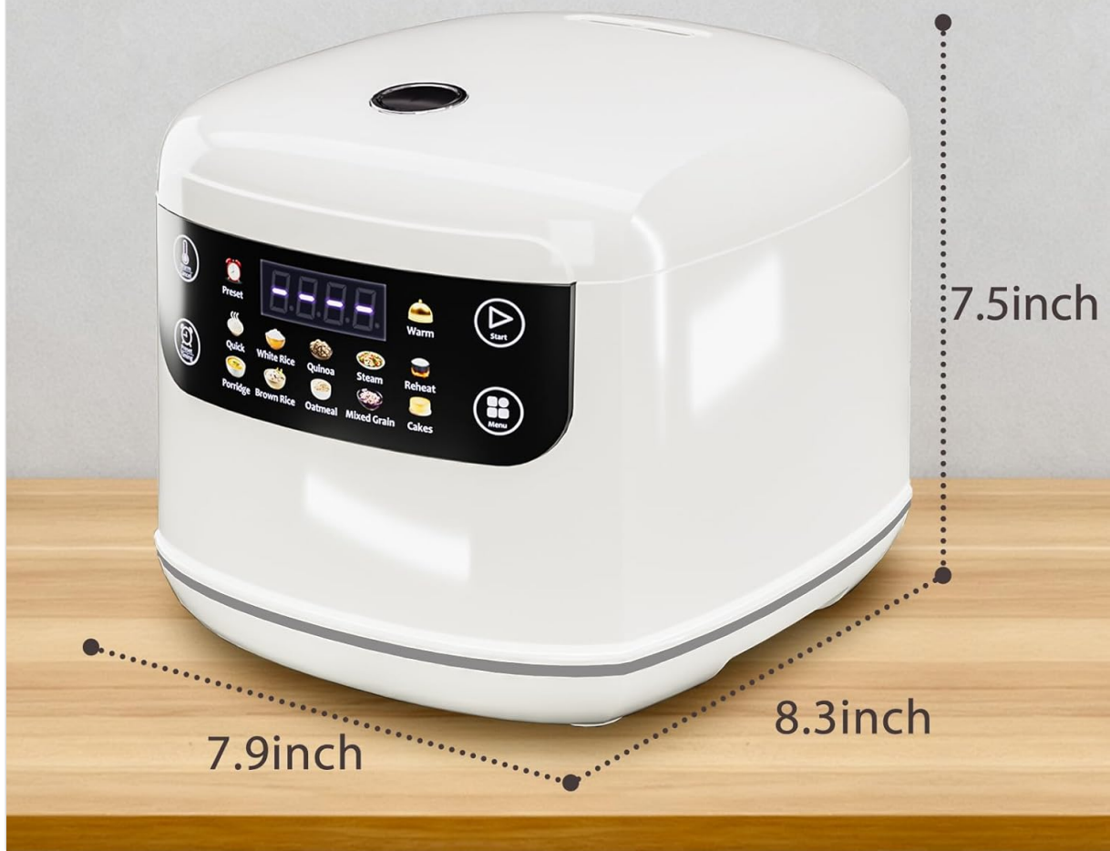
Image 1.1: The SANPTENT QF-208A Portable Digital Rice Cooker, showcasing its compact size with dimensions of 8.3 inches (depth), 7.9 inches (width), and 7.5 inches (height).