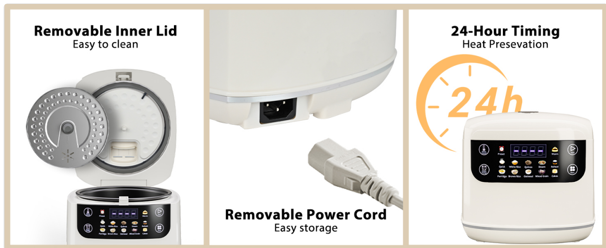
Image 5.2: Features like the removable inner lid and power cord, designed for easy cleaning and convenient storage.