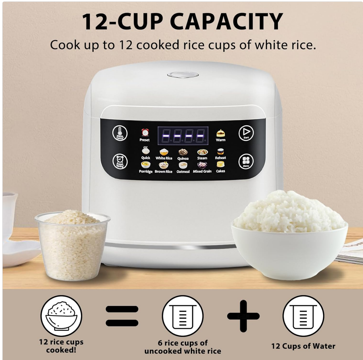
Image 4.1: Visual representation of the cooker's capacity, showing that 6 cups of uncooked white rice yield 12 cups of cooked rice.

Note: These ratios are general guidelines. Adjust water amounts based on desired texture and specific rice type.