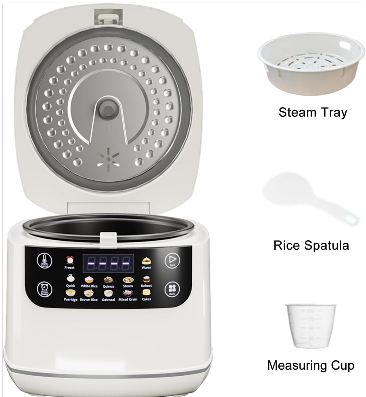
Image 1.2: The rice cooker displayed with its essential accessories: the steam tray, rice spatula, and measuring cup.