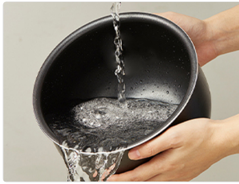
Image 5.1: A close-up view of the non-stick inner pot, highlighting its easy-to-clean surface.