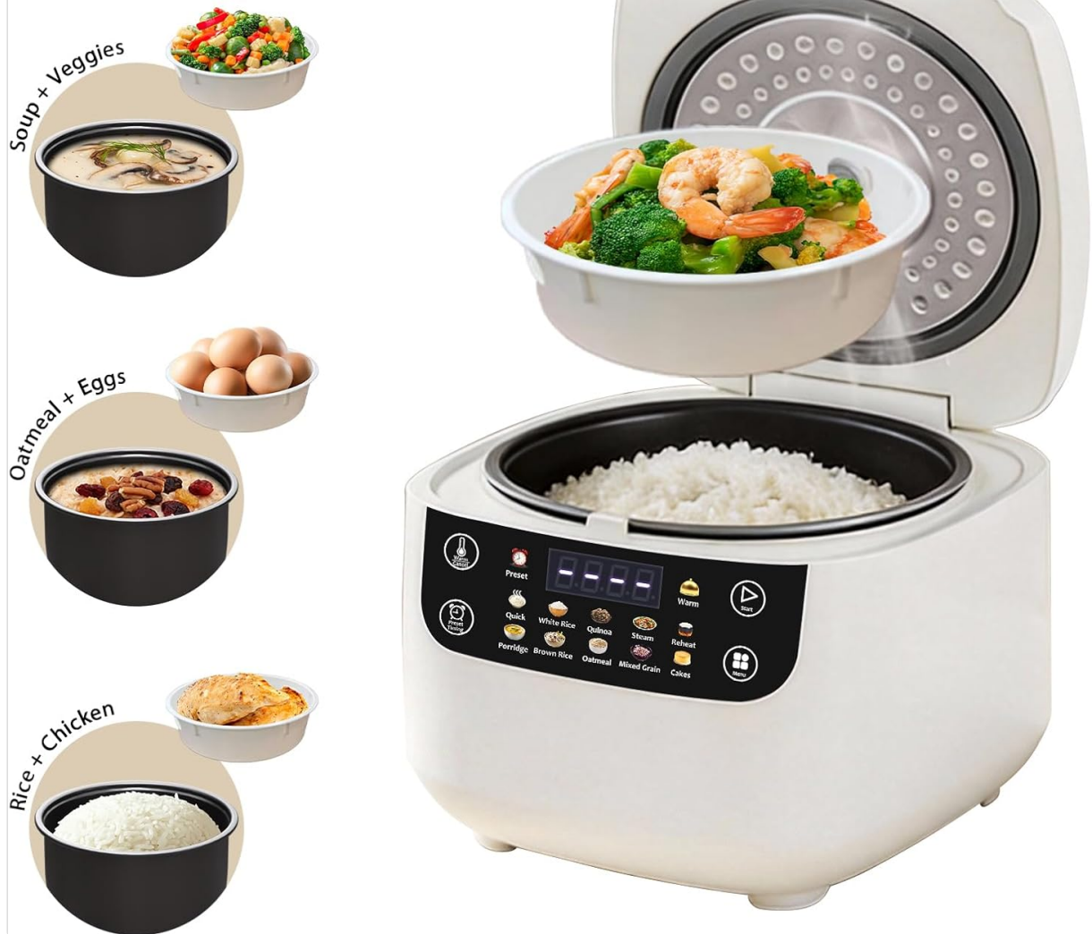
Image 3.3: The rice cooker demonstrating its dual functionality, cooking rice in the main pot while steaming vegetables in the upper basket.

Effortlessly cook a variety of rice, grains, soups and steamed veggies with just one versatile appliance.