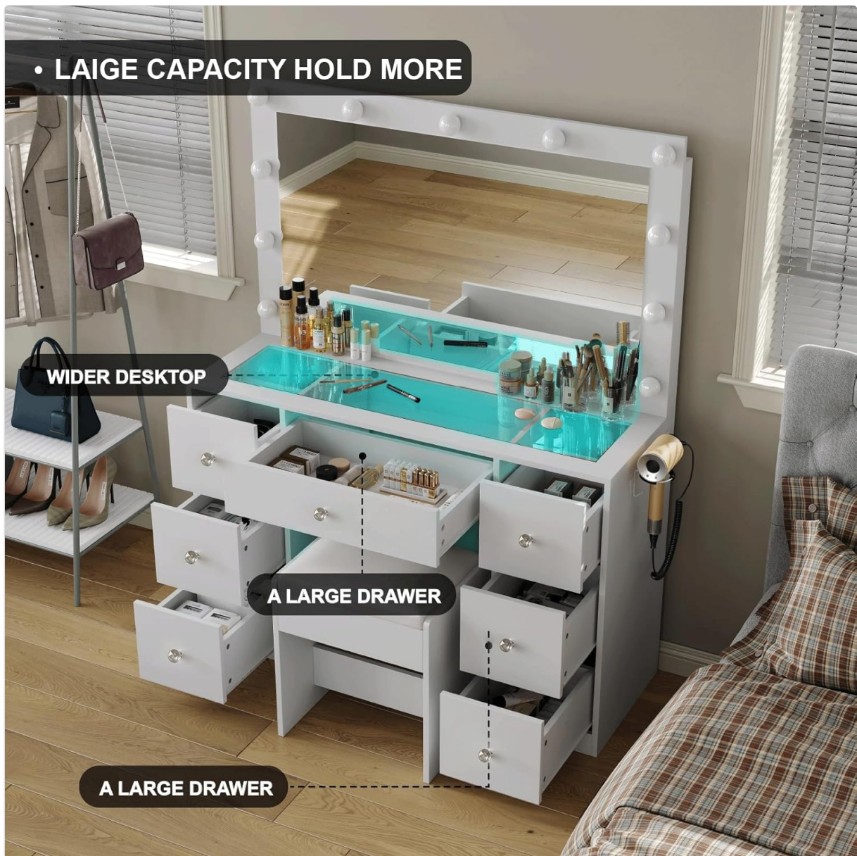
Figure 5: The vanity desk with all seven drawers open, illustrating the generous storage capacity for various items.