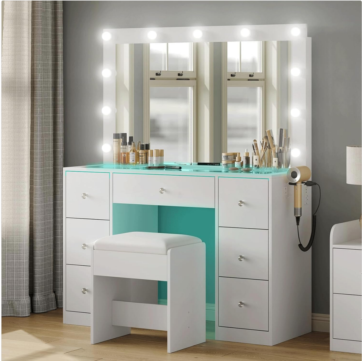
Figure 2: The vanity desk features integrated power outlets and USB ports for convenient device charging and power supply.