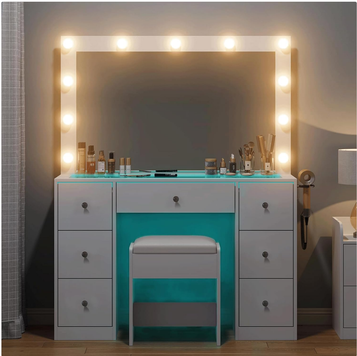
Figure 4: The vanity desk illuminated with warm yellow lighting, demonstrating one of the adjustable color modes.