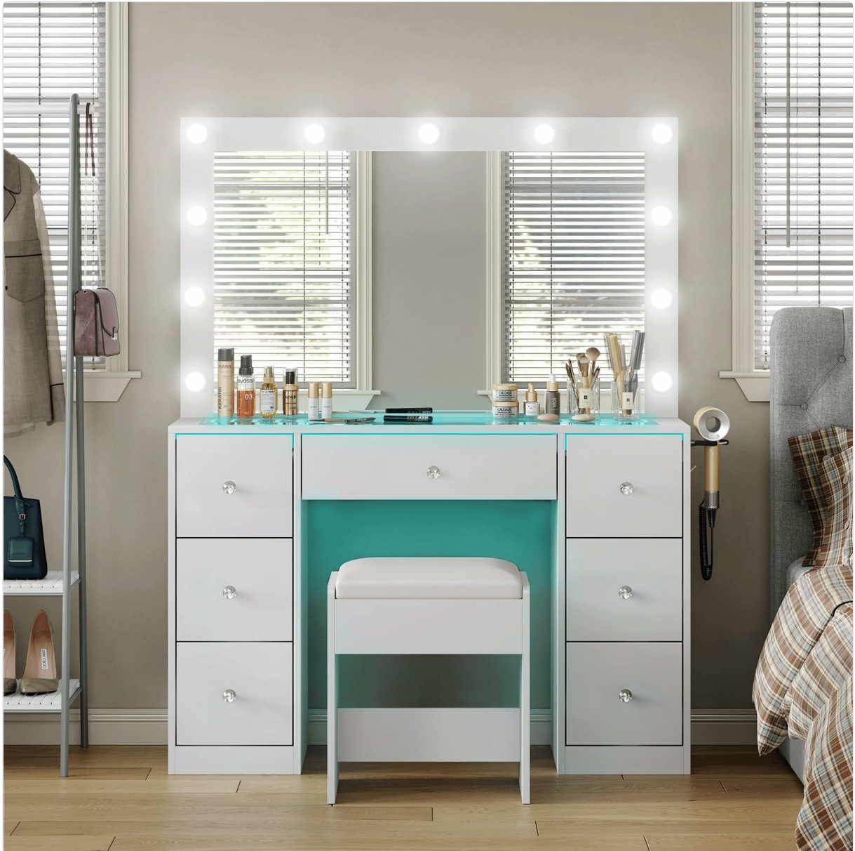
Figure 1: Overall dimensions of the vanity desk and stool. The desk measures approximately 31.49 inches deep, 31.49 inches wide, and 53.1 inches high, with the mirror extending above the desk surface.