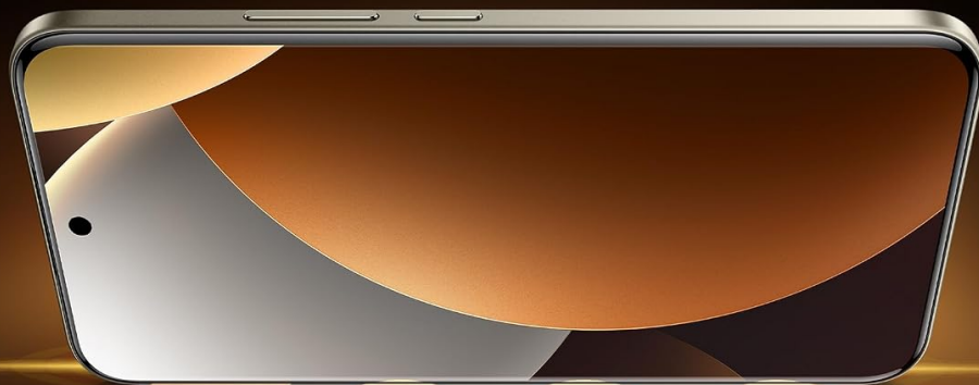
Figure 10: Device durability with Corning Gorilla Glass Victus 2 and IP69K protection.

Immersive clarity for work, play, and everything in between