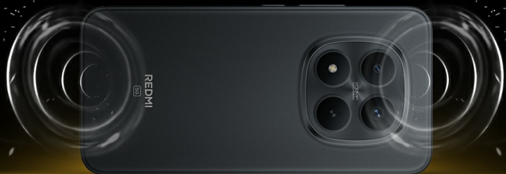
Figure 6: Symmetric stereo speakers with Dolby Atmos for immersive sound.

Symmetric stereo speakers with Dolby Atmos® deliver up to 400% louder sound, immersive depth, and crystal-clear dialogue.