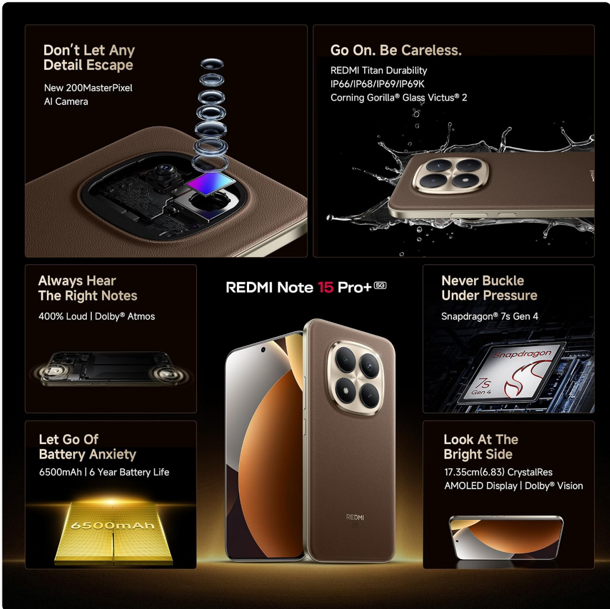
Figure 3: Detail of the 200MasterPixel OIS Camera system.