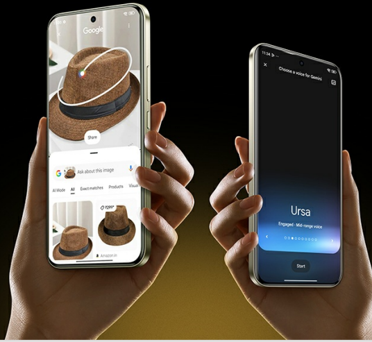
Figure 9: Xiaomi HyperOS 2 for seamless and intelligent cross-device connectivity.

Xiaomi HyperOS brings intelligent AI features and Offline Communication, enabling device-to-device calling even without network coverage.