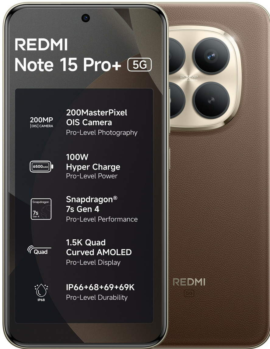
Figure 1: Rear view of the REDMI Note 15 Pro+ 5G smartphone.