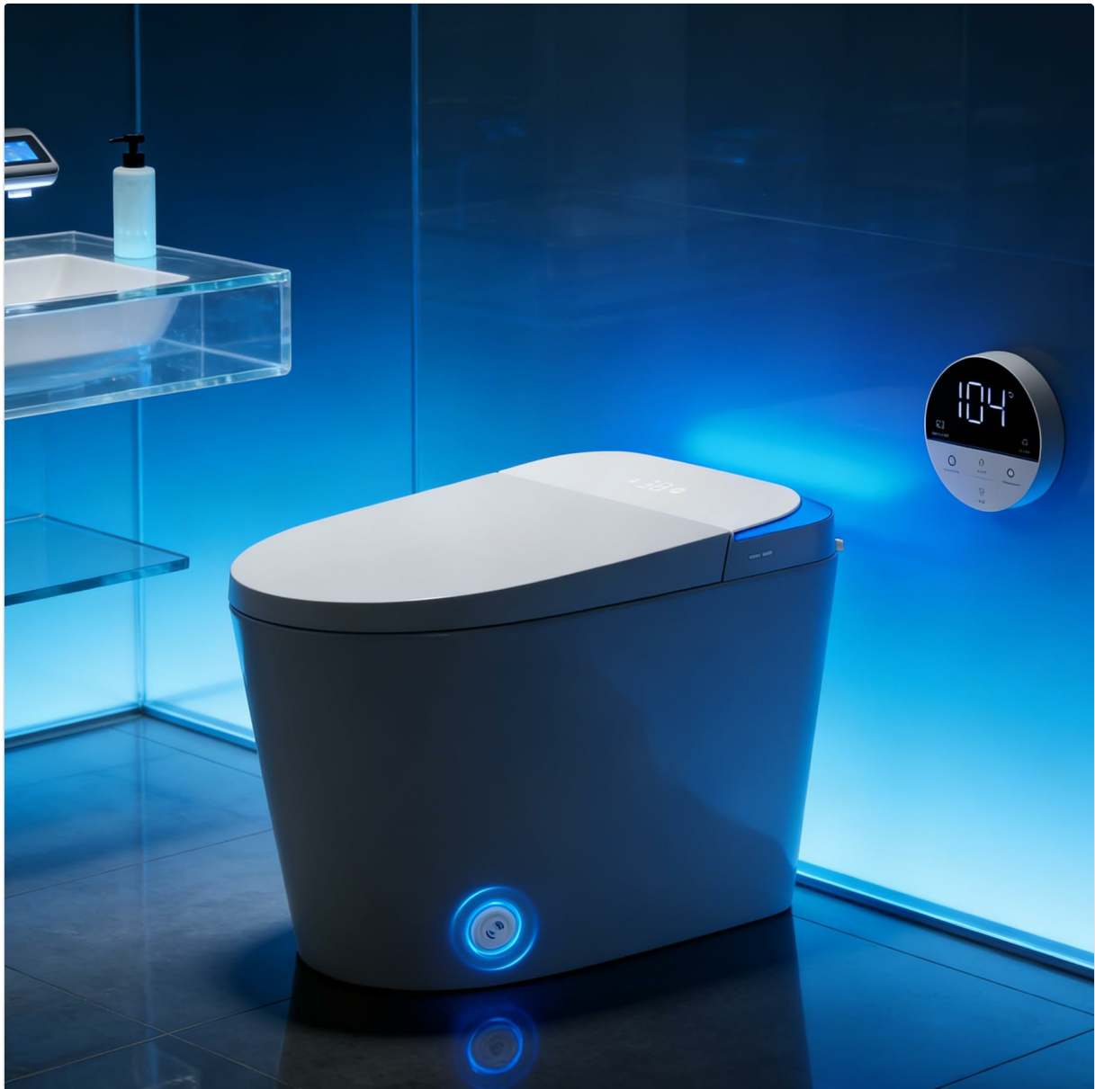
Figure 1: VIPBEAR Smart Toilet with dimensions (18.11" H x 16.54" W x 26.77" D, 12" rough-in).