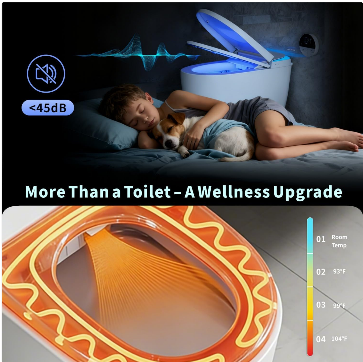
Figure 4: The smart toilet features an auto open/close seat and lid for hands-free operation.