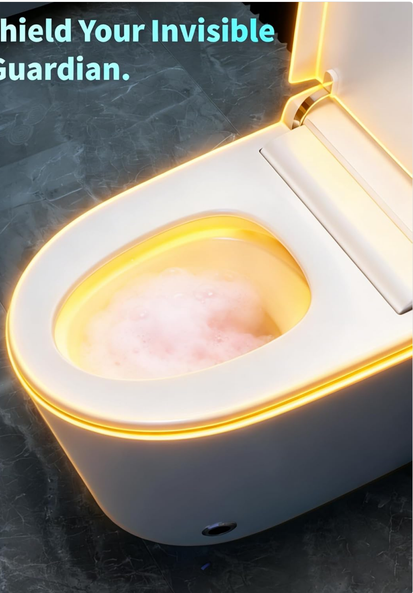
Figure 7: The heated seat provides adjustable temperature settings for comfort.