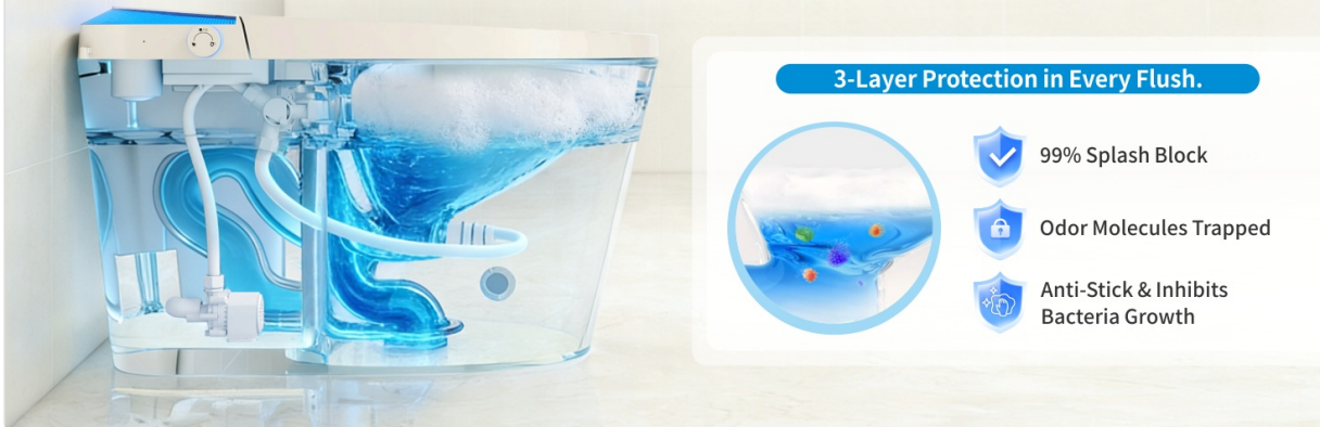
Figure 12: Detailed diagram of the Foam Shield mechanism providing 3-layer protection.