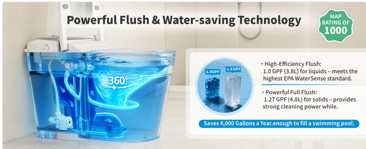
Figure 9: Illustration of the powerful flush and water-saving technology, with a MaP rating of 1000.

ensures that flushing functionality remains available.