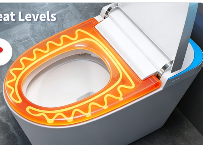
Figure 8: Visual representation of the four adjustable heated seat levels.