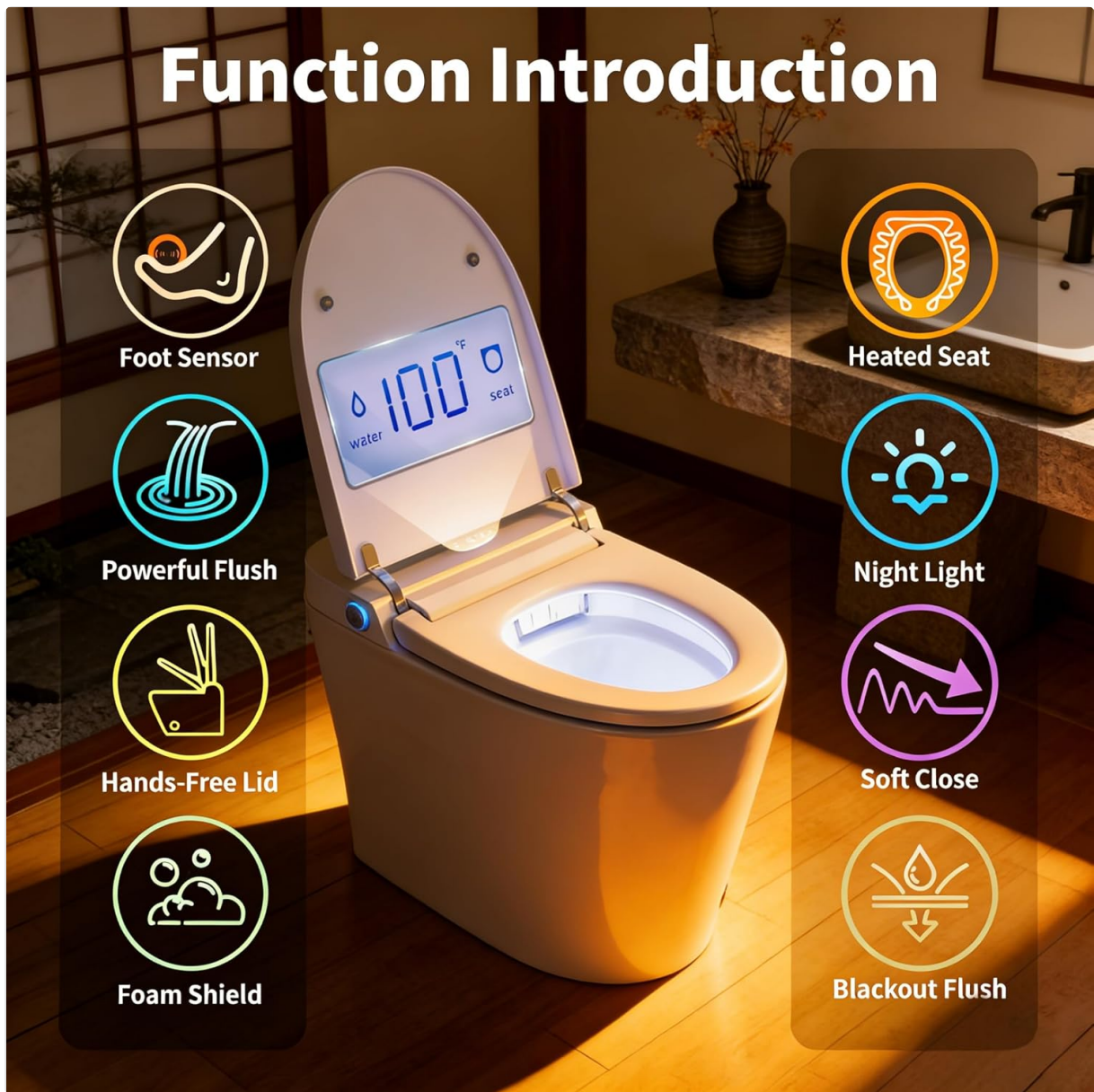
Figure 2: Overview of smart toilet functions including Foot Sensor, Heated Seat, Powerful Flush, Night Light, Hands-Free Lid, Soft Close, Foam Shield, and Blackout Flush.