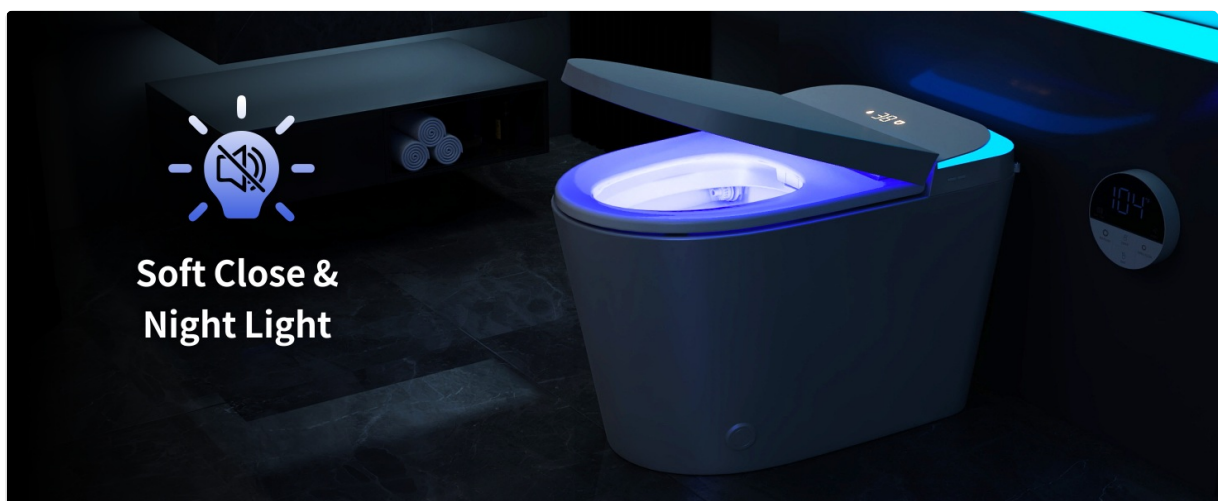
Figure 5: The soft-glow night light provides illumination for nighttime use.