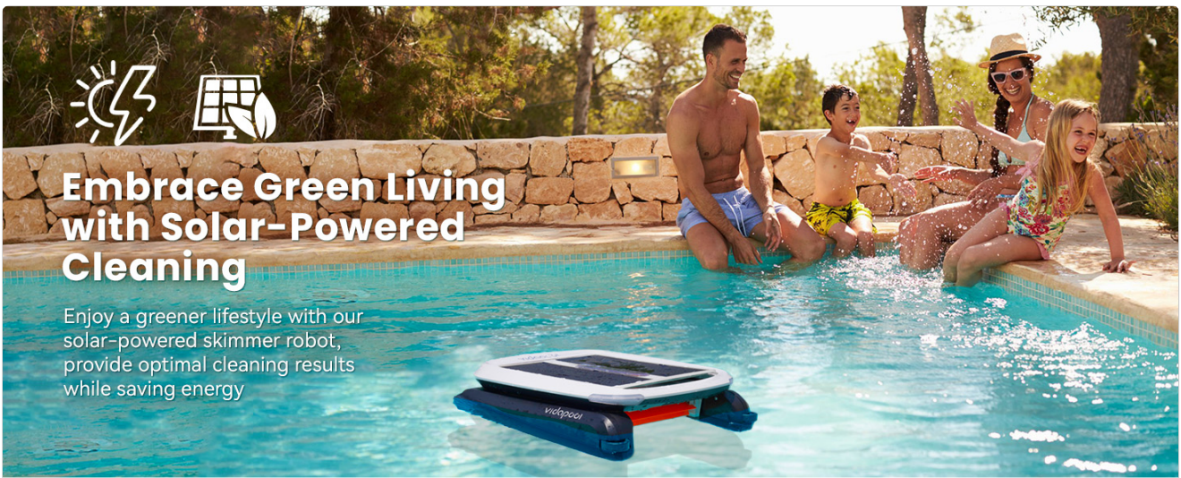
Image: The Vidapool VPSC01 skimmer showcasing its solar panels for cordless operation.