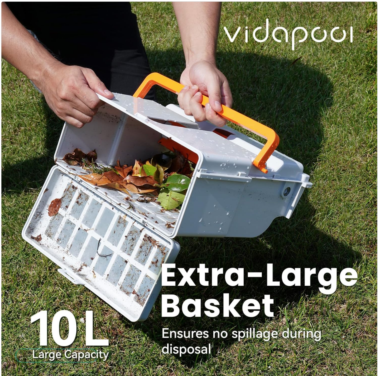
Image: A person demonstrating the easy removal and emptying of the extra-large debris basket.