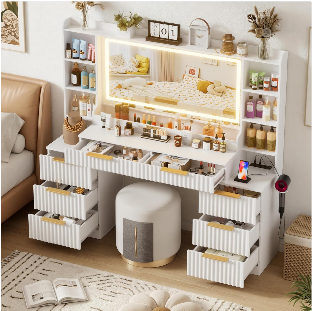
Image 5.1: The vanity desk with multiple drawers open, showcasing the storage capacity. This image represents the assembled state of the storage components.