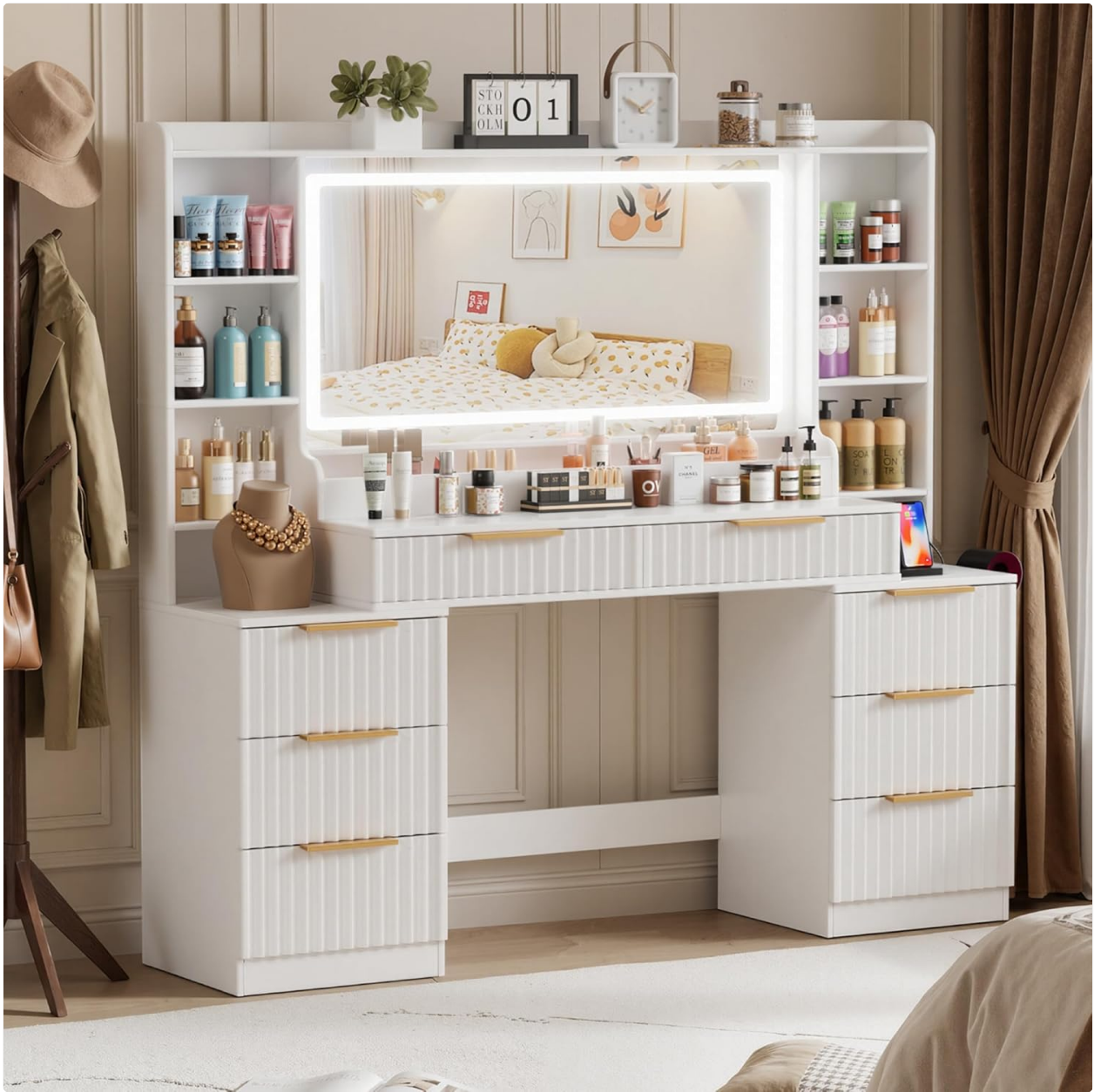
Image 1.1: Fully assembled CASANOOKK Vanity Desk with various items displayed on shelves and tabletop.