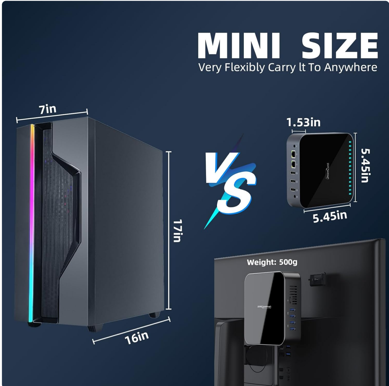
Image: Size comparison of the Mini PC and examples of VESA mounting behind a monitor or on a wall.