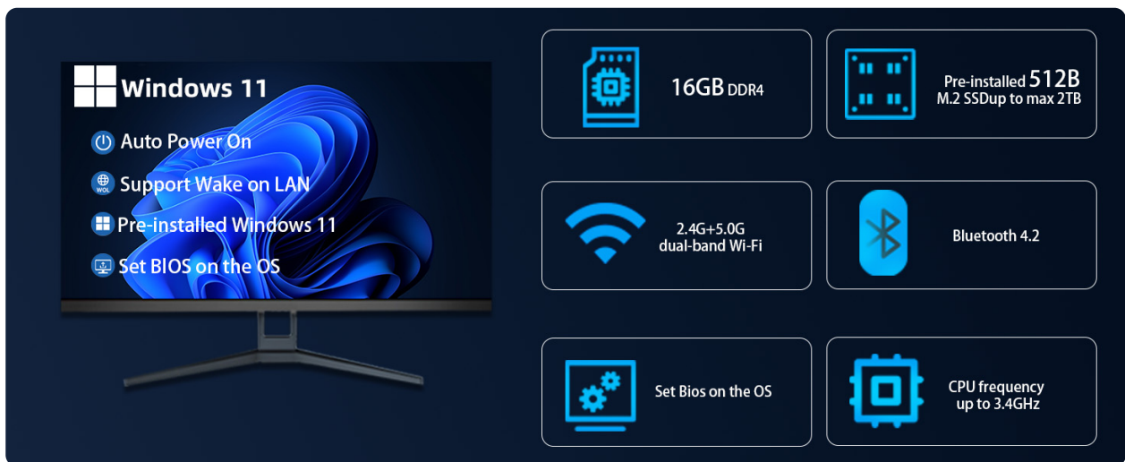
Image: Visual representation of Windows 11 Pro features and core hardware specifications.

With three HDMI 2.0 ports, the Mini PC can drive up to three 4K@60Hz displays simultaneously, providing an expansive workspace or immersive entertainment experience.