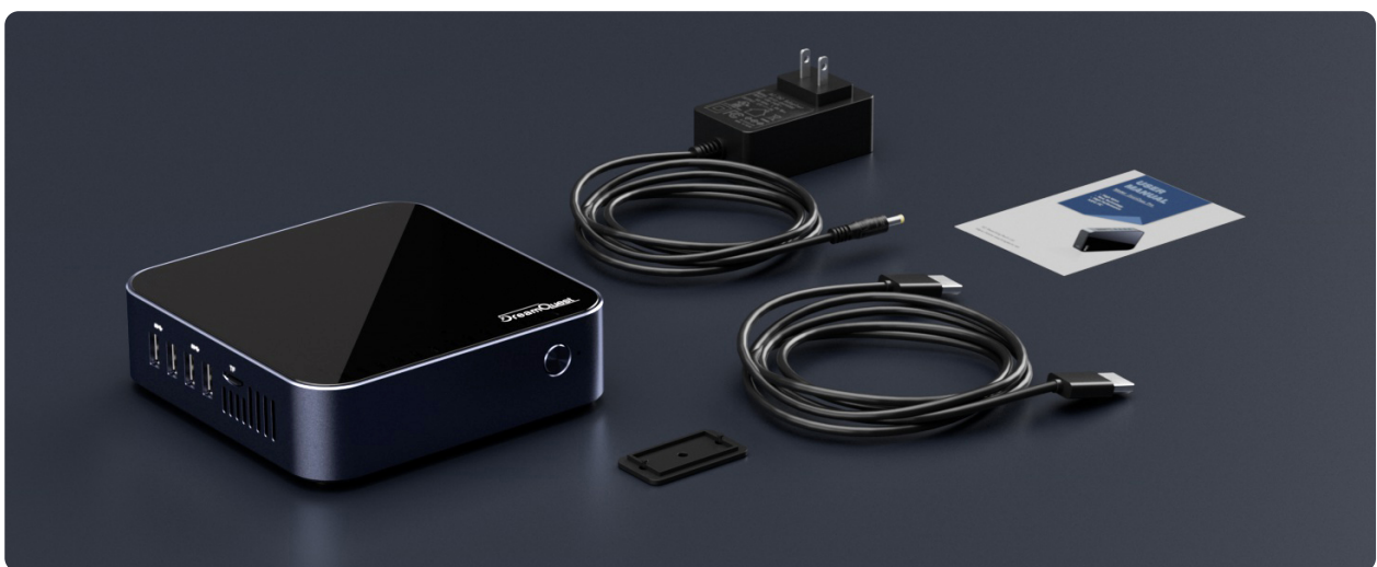
Image: The DreamQuest Mini PC and its accessories, ready for connection.