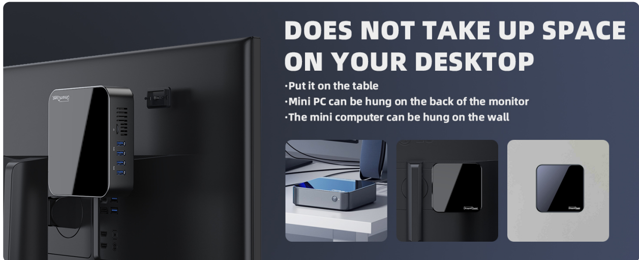
Image: The compact size of the DreamQuest Mini PC and various mounting options, including VESA mount.