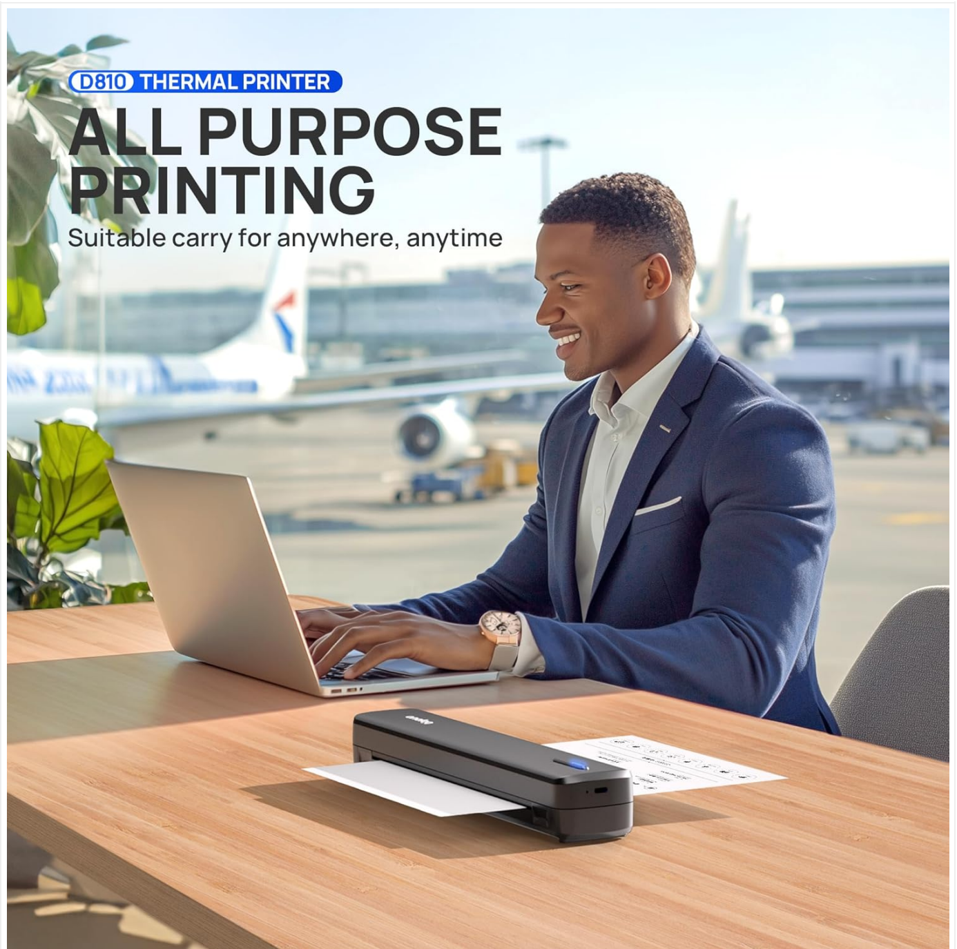
Image: The POLONO D810 printer in use with a laptop, suitable for various printing needs.

The D810 printer delivers crisp, high-resolution black and white prints. It is suitable for office documents, inventory lists, business checks, and more.