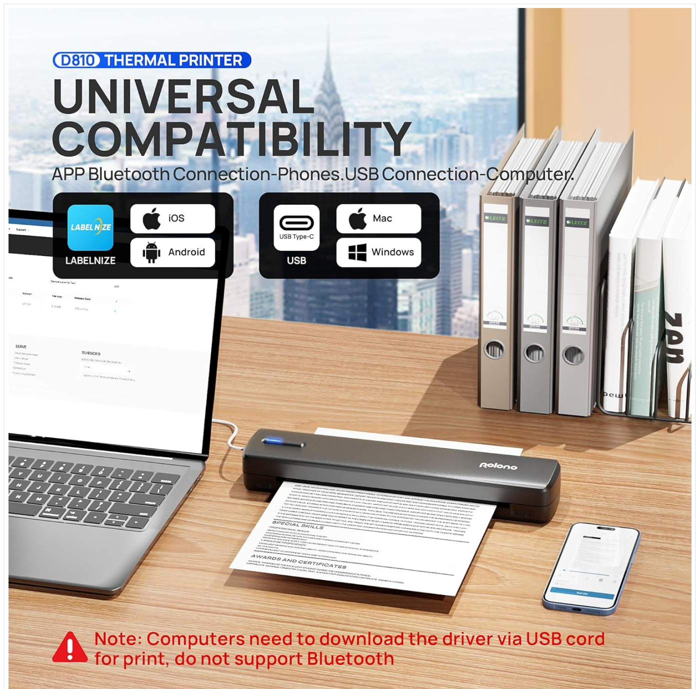
Image: POLONO D810 printer connected to a laptop and a smartphone, illustrating its universal compatibility.