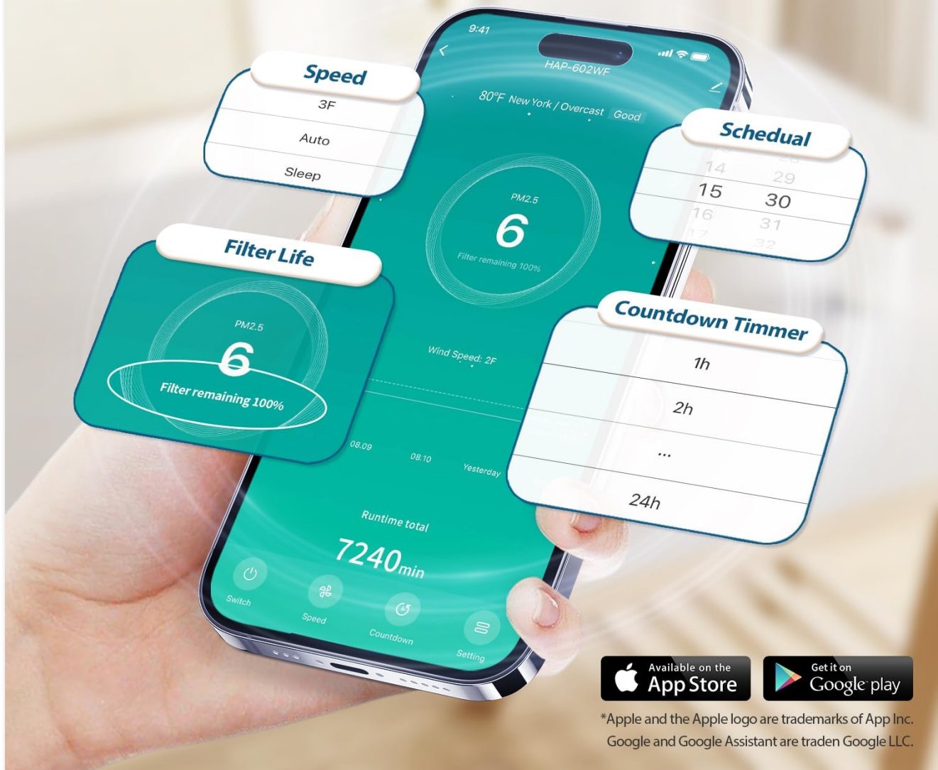
Figure 4.5: The Ecoself app provides comprehensive smart control over your air purifier from your smartphone.

Your browser does not support the video tag.