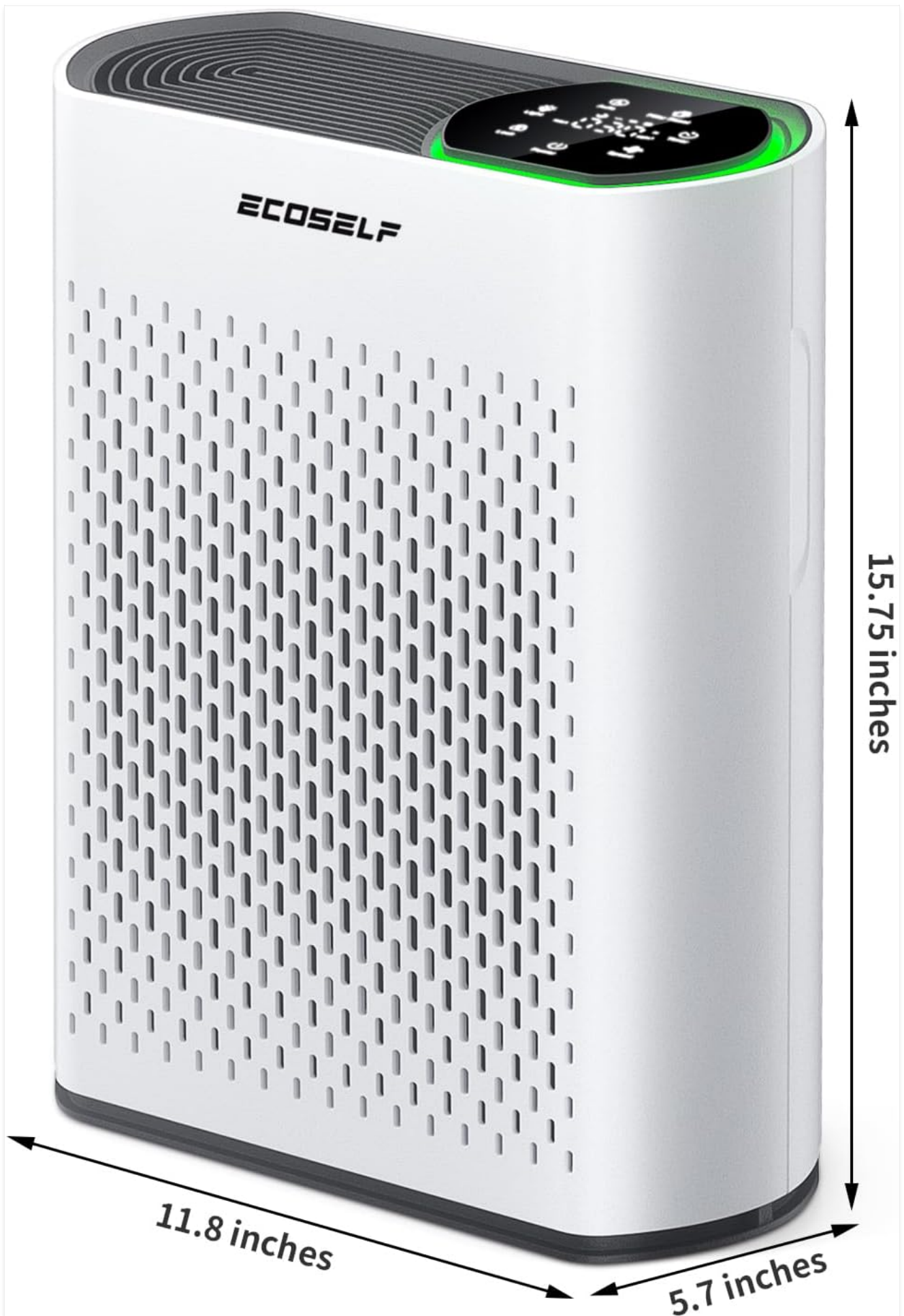
Figure 7.1: Physical dimensions of the ECOSELF HAP602WF air purifier.