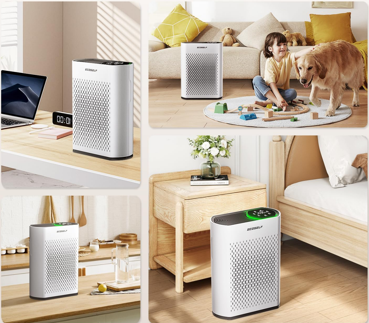
Figure 3.2: Examples of optimal placement for the ECOSELF HAP602WF air purifier in different rooms of a home.