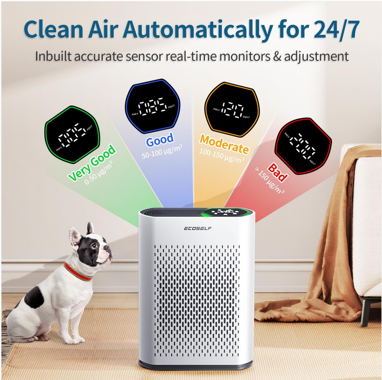
Figure 2.1: The ECOSELF HAP602WF Smart Air Purifier, illustrating its air quality monitoring feature with color-coded indicators (green for very good, blue for good, yellow for moderate, red for bad).