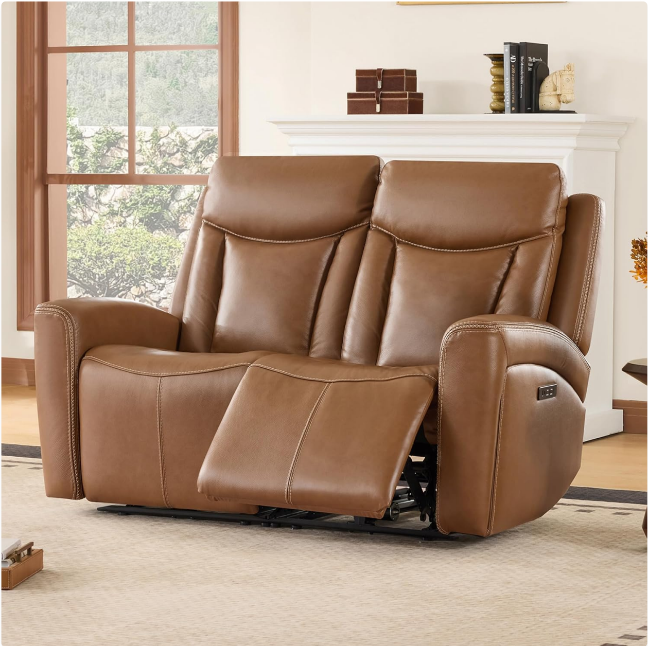
The fully assembled CHITA Genuine Leather Power Reclining Loveseat.