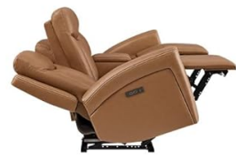
140°Super Zero-Gravity Experience

Adjust the power headrest for personalized comfort and support.