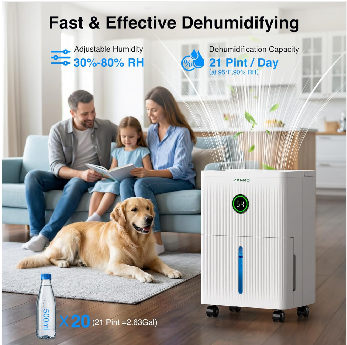
Image: ZAFRO Dehumidifier demonstrating its fast and effective dehumidifying capability in a home environment.