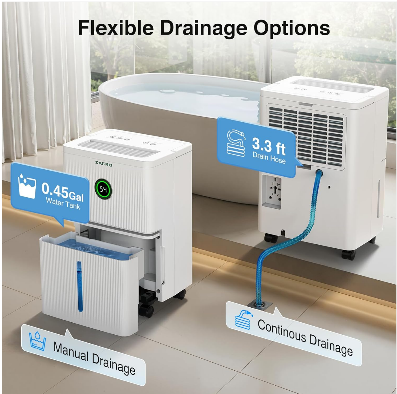
Image: Illustration of the flexible drainage options, including manual water tank emptying and continuous drainage via the provided hose.