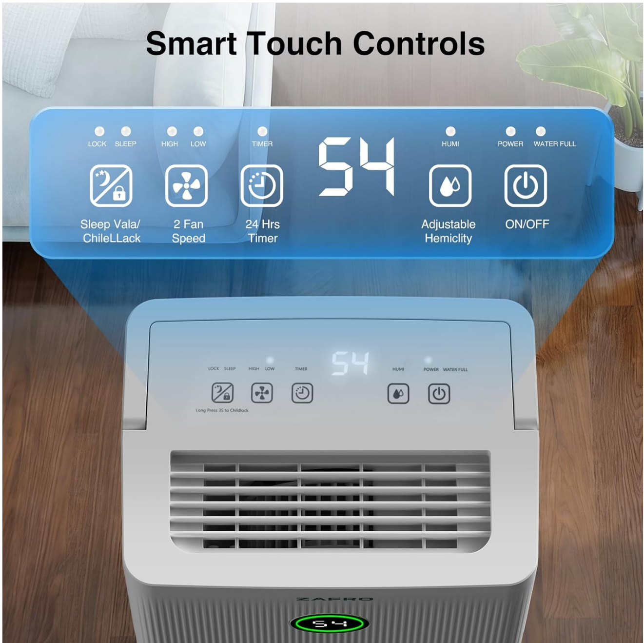
Image: Detailed view of the smart touch control panel, highlighting various functions and indicators.

The dehumidifier features a smart touch control panel and dual digital displays for easy operation and monitoring.