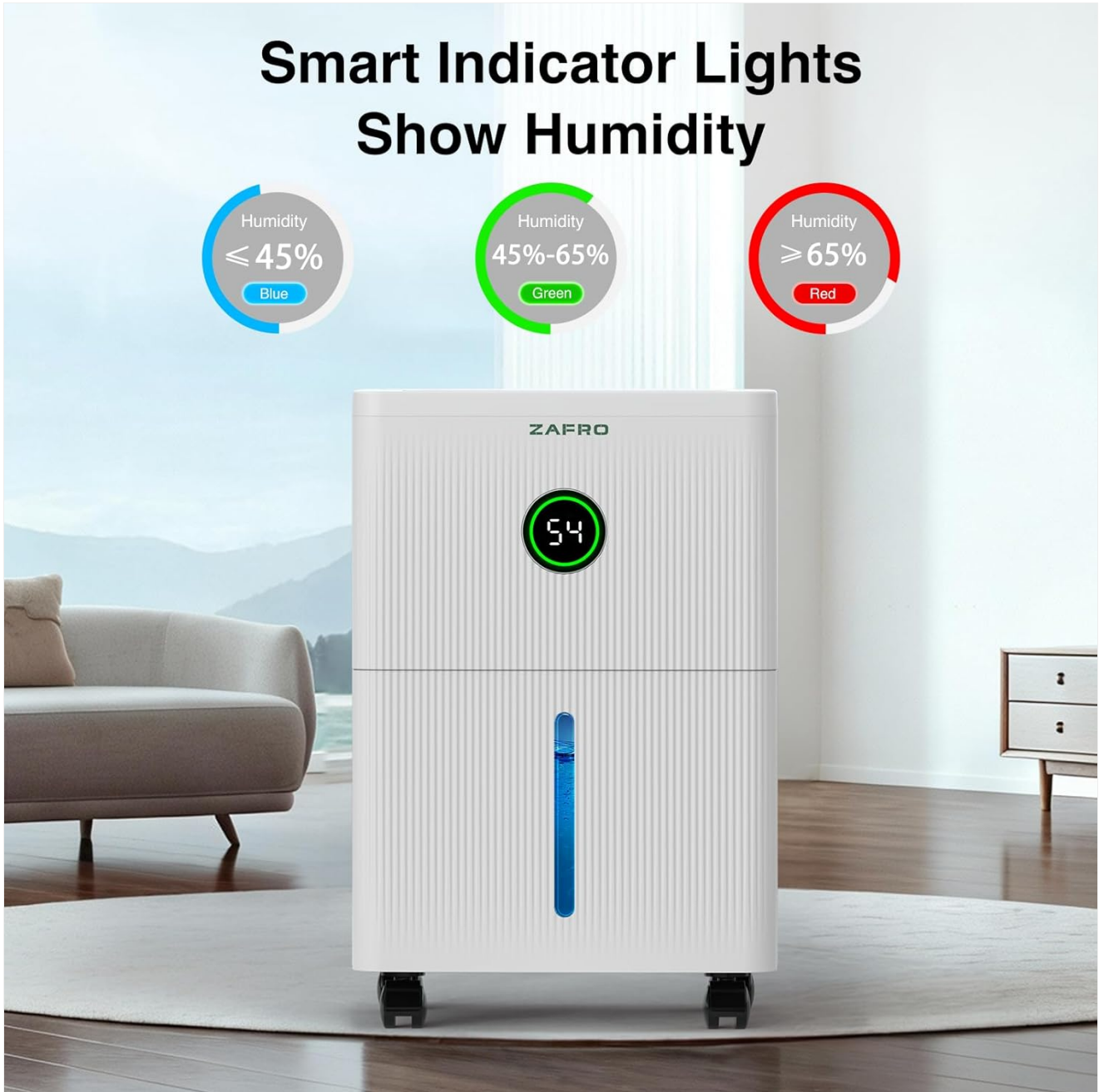
Image: Smart indicator lights displaying humidity levels (Blue, Green, Red).