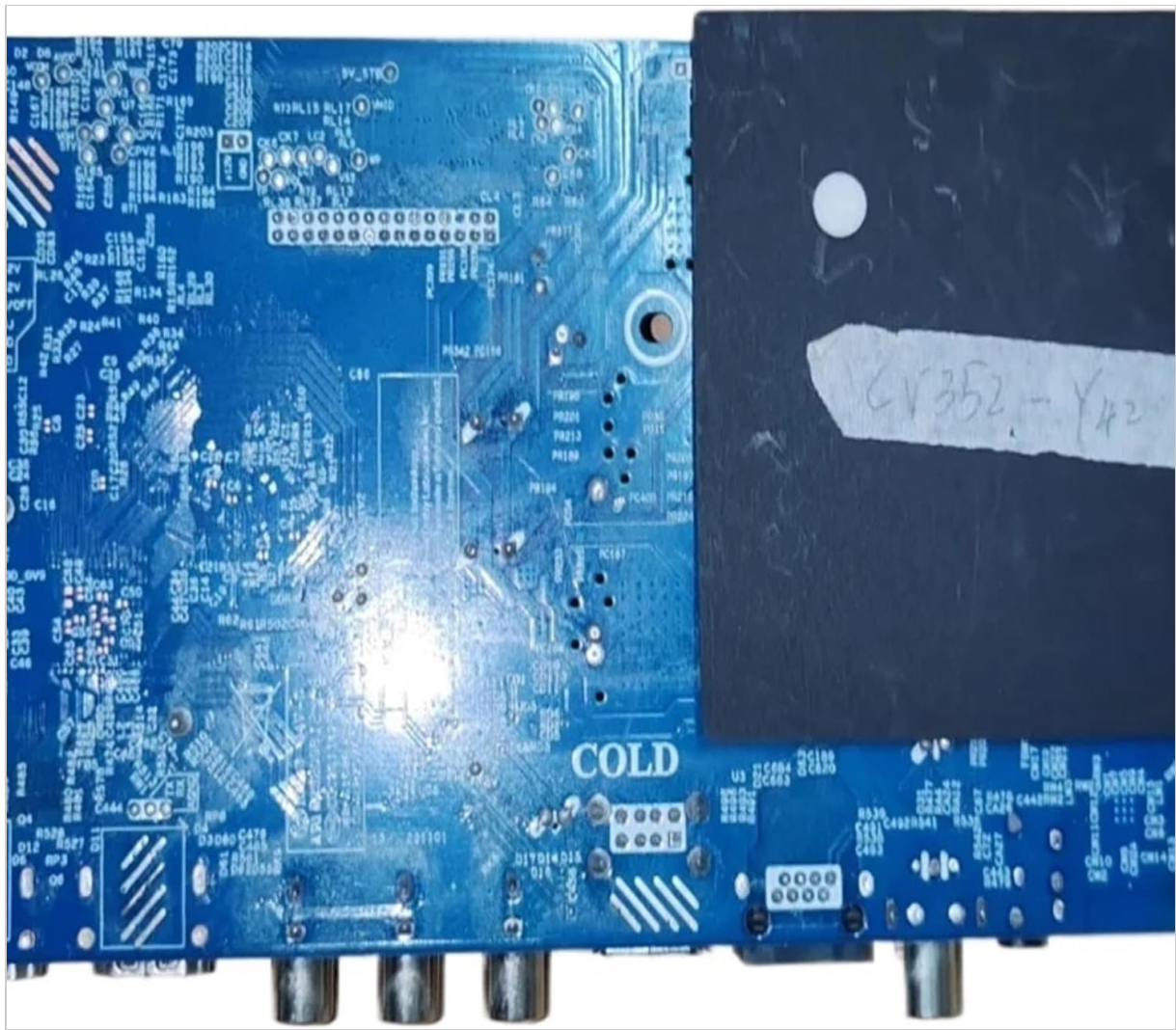
Image 1: Rear view of the Wxvuqpkg CV352-Y42 TV Motherboard, showing the layout of components and connection ports.