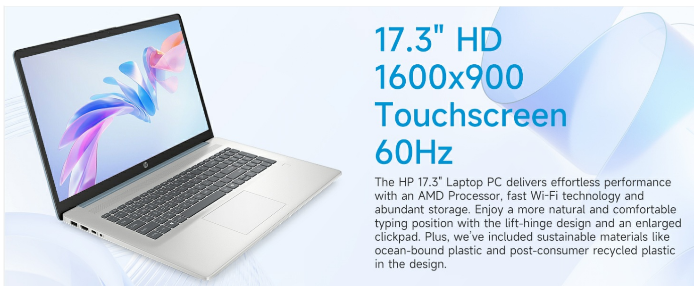
Image: The 17.3-inch touchscreen display of the HP laptop, illustrating its touch capabilities.

The 17.3" HD+ (1600 x 900) display supports touch input. You can interact with Windows 11 and applications directly on the screen using gestures similar to a tablet or smartphone. Ensure your screen is clean for optimal touch responsiveness.