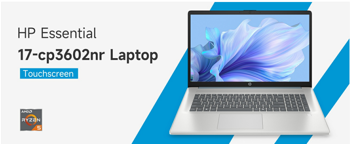
Image: An infographic highlighting key specifications such as the AMD Ryzen 5 processor, Windows 11 Home, storage, and connectivity options.