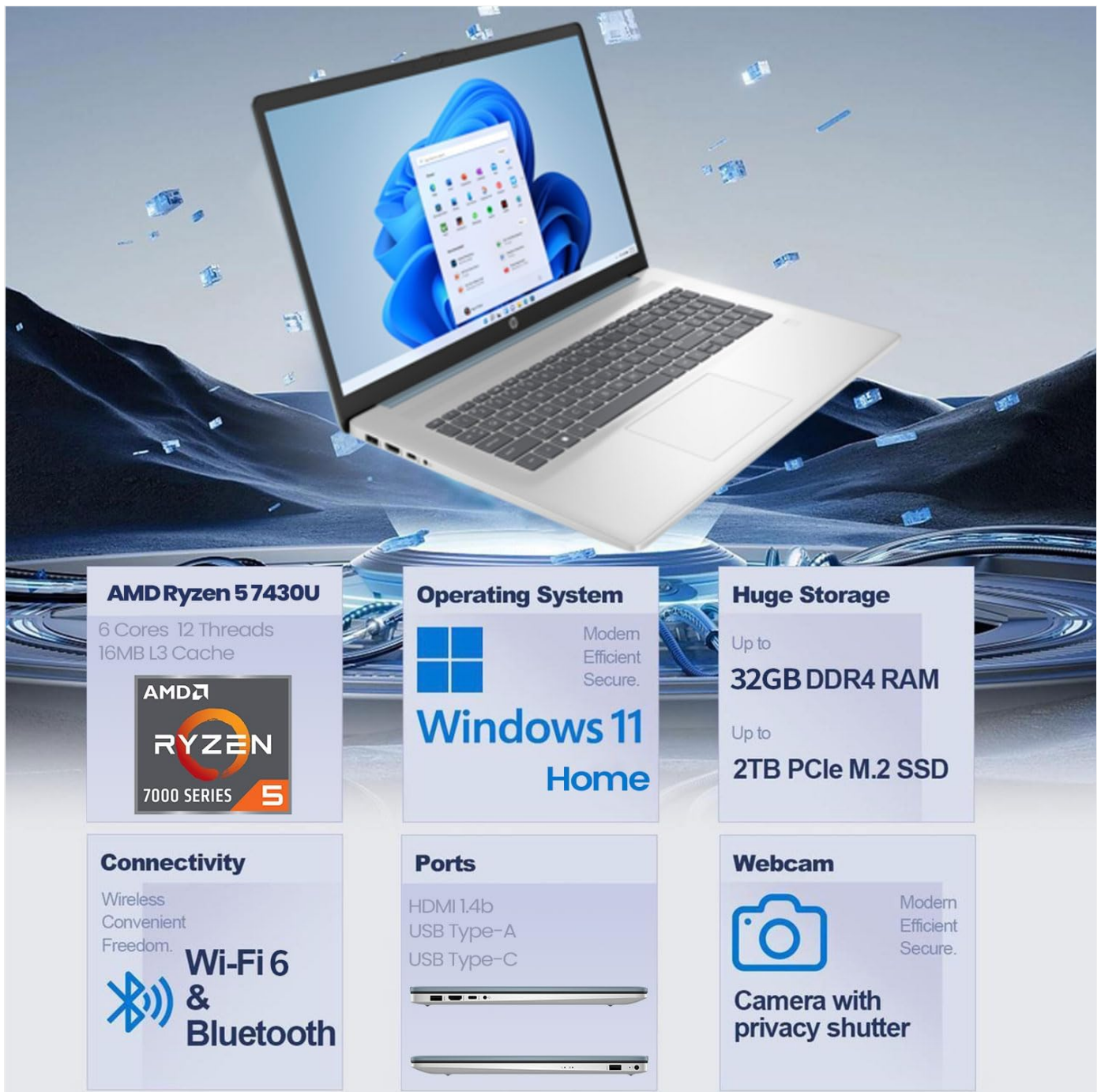
Image: The HP 17.3" Touchscreen Laptop and its included power adapter.