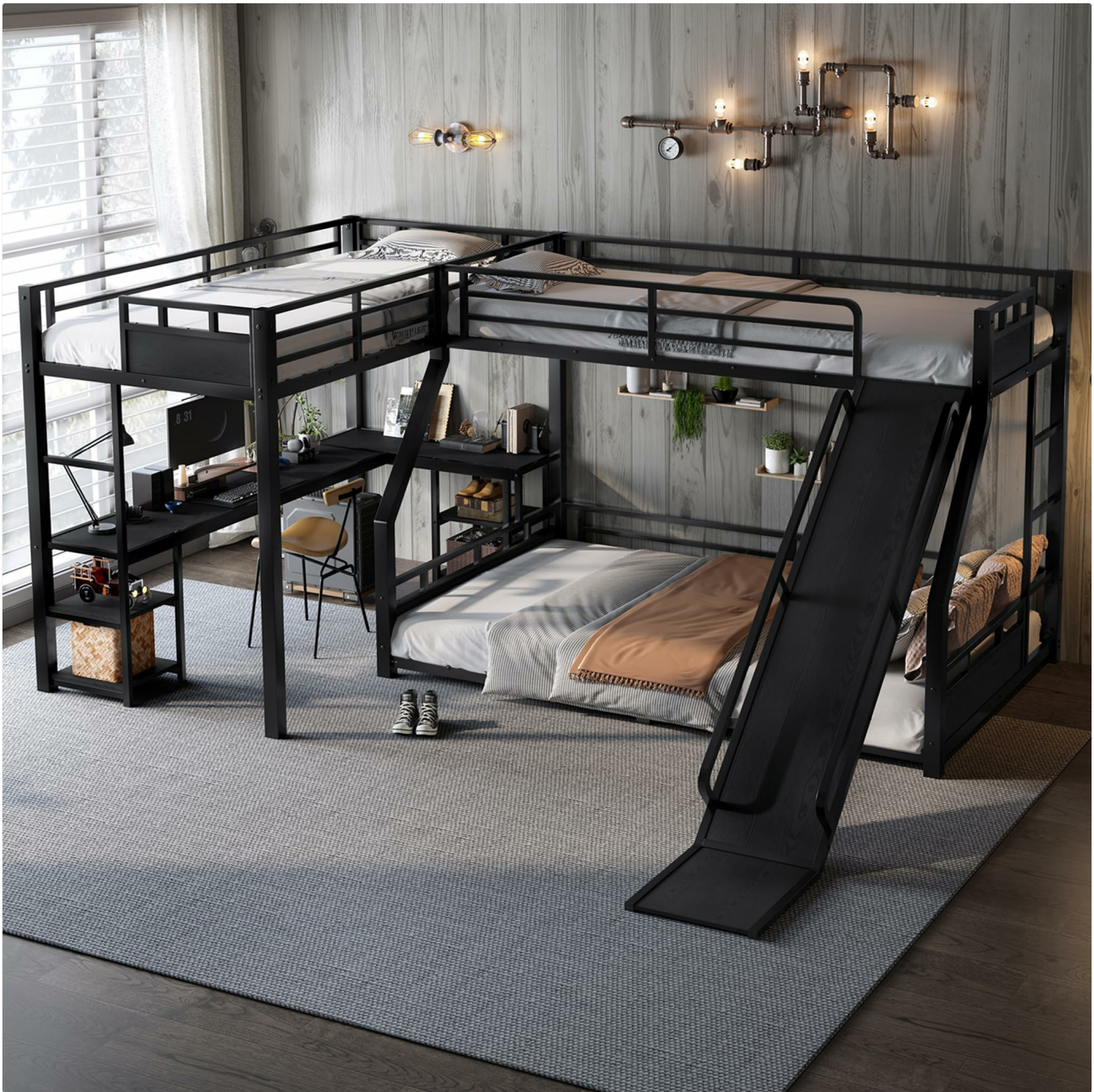
Detailed dimensions of the SOFTSEA Metal Triple Bunk Bed, including length, width, and height measurements for each section and component.