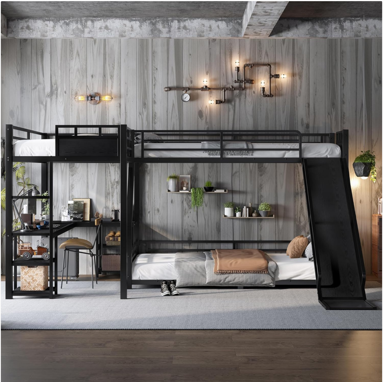
A detailed view of the slide component, showing its attachment to the bunk bed structure.