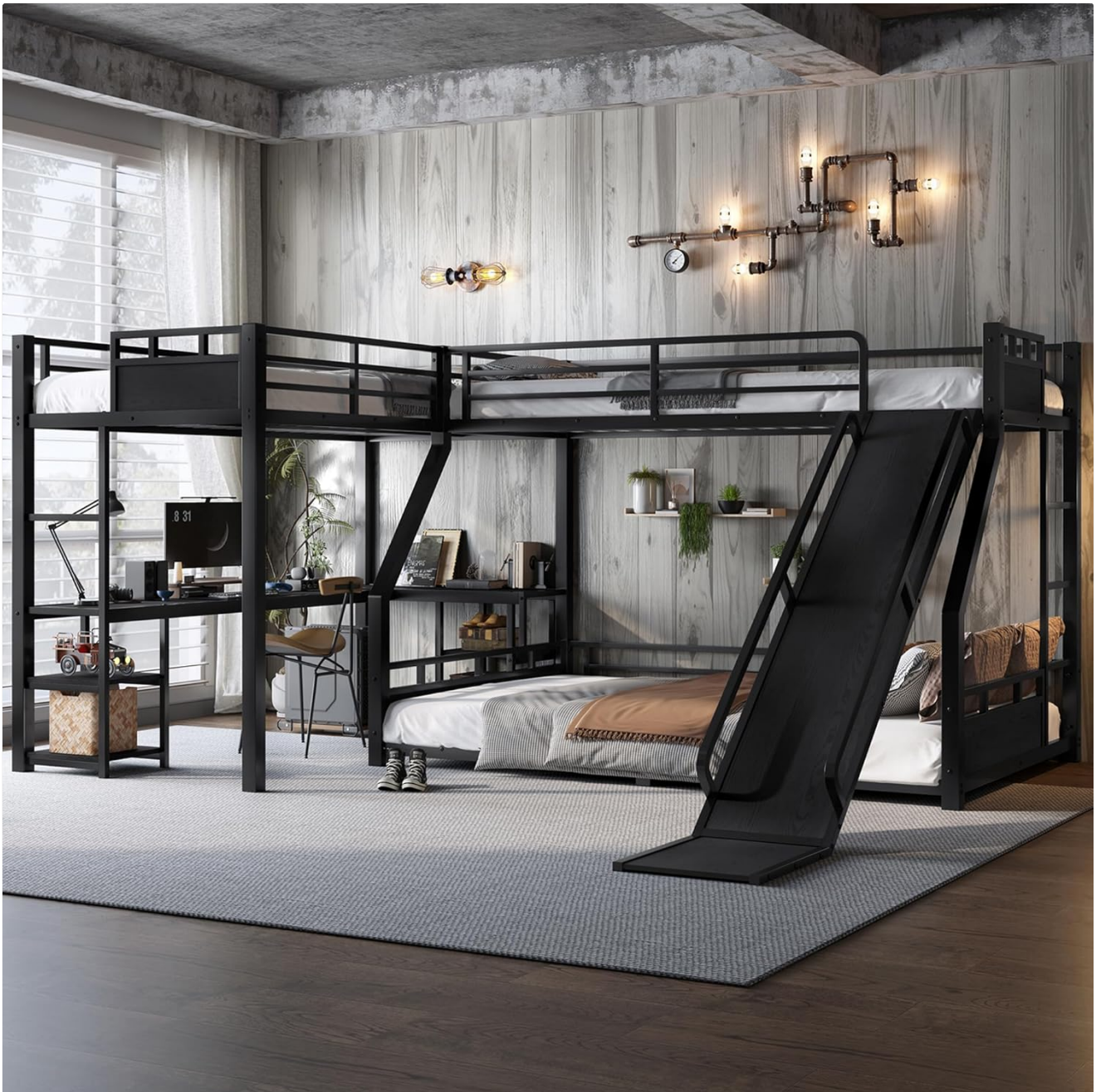
A lifestyle image showing the SOFTSEA Triple Bunk Bed in a room setting, with the desk area being utilized for study.