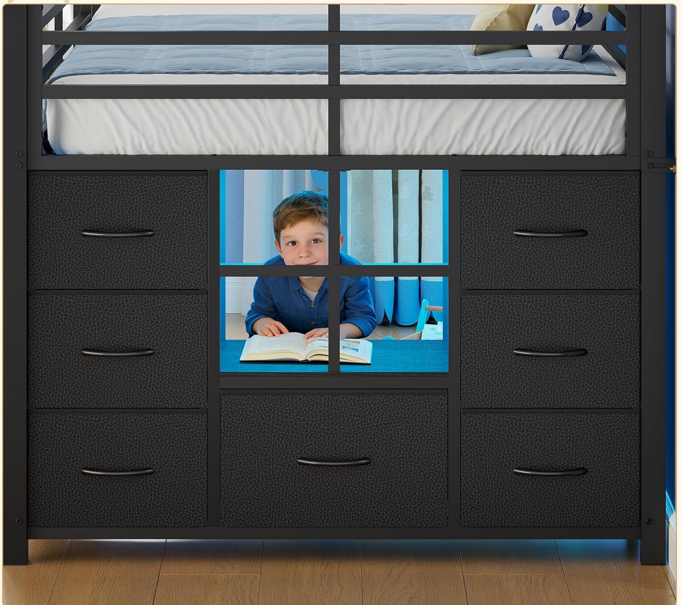
Figure 5: The RGB LED lighting system with multiple modes for customization.