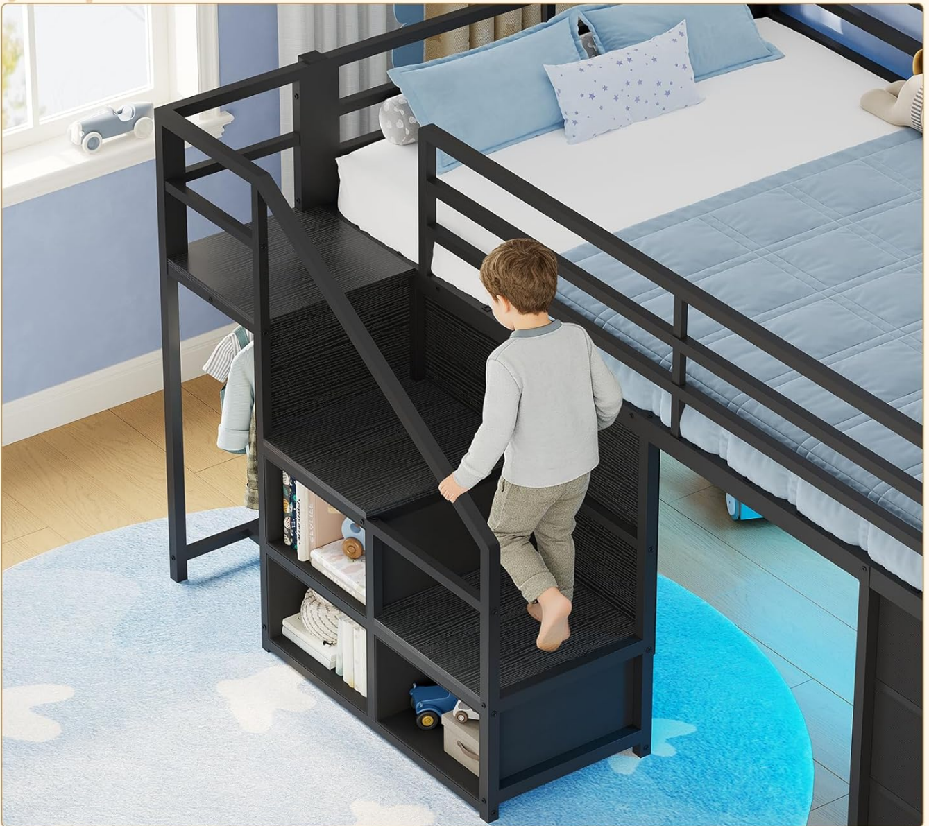
Figure 8: The loft bed's safety features, including guardrails and anti-tipping device.