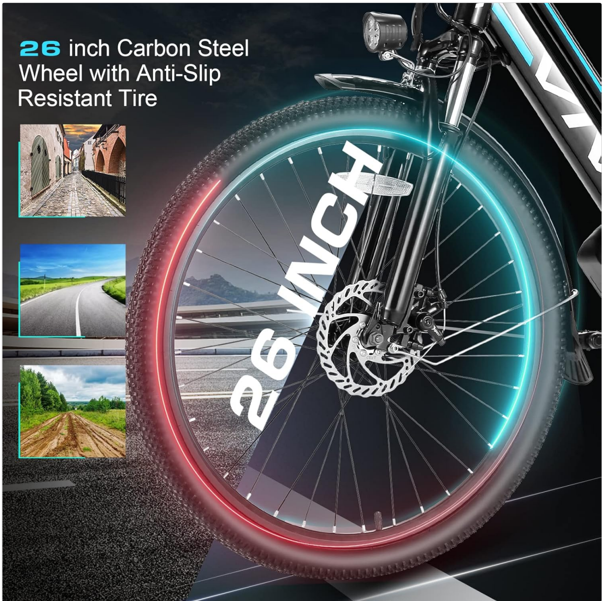
Image: The 26-inch carbon steel wheel with an anti-slip resistant tire, designed for various terrains.