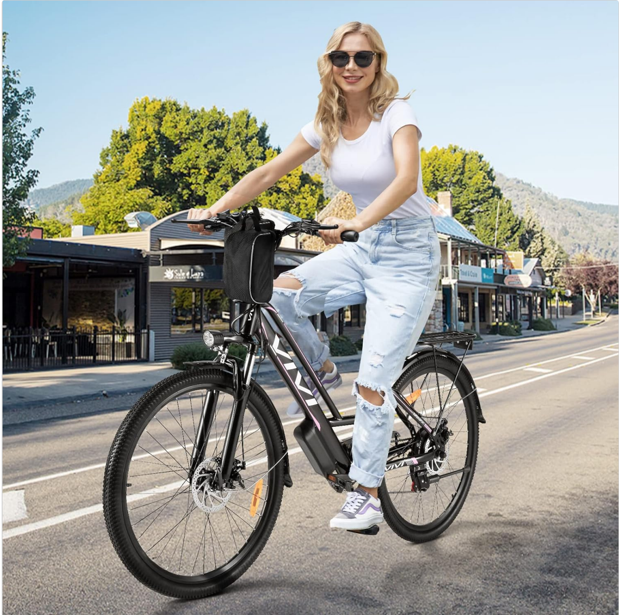
Image: A woman riding the Vivi MT26GUL Electric Bike on a paved road.

This manual provides essential information for the safe and efficient operation, assembly, and maintenance of your Vivi MT26GUL 26" Step-Through Electric Bicycle. Please read this manual thoroughly before your first ride and keep it for future reference.