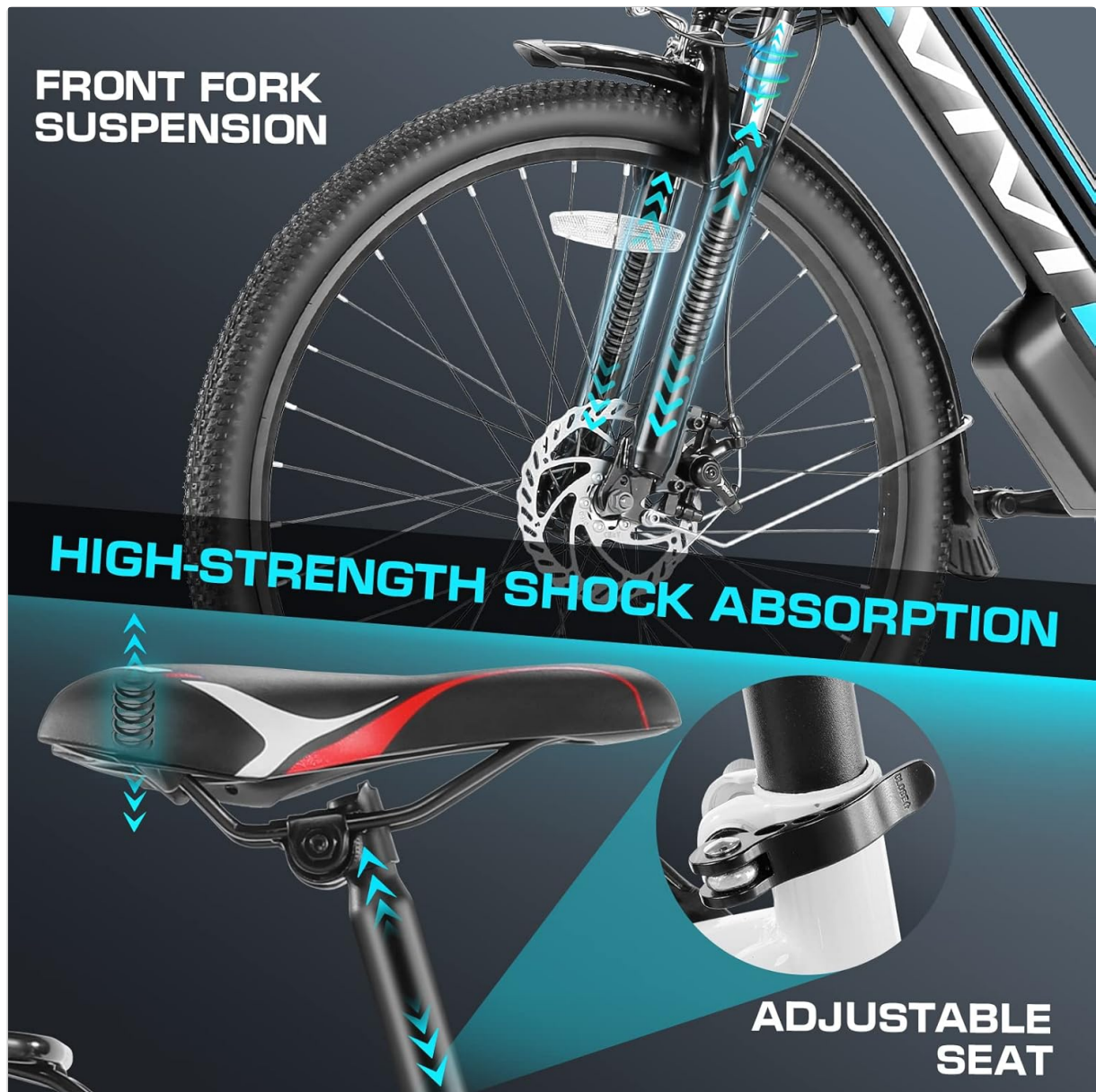
Image: Illustration of the adjustable seat and front fork suspension, designed for comfort and shock absorption.