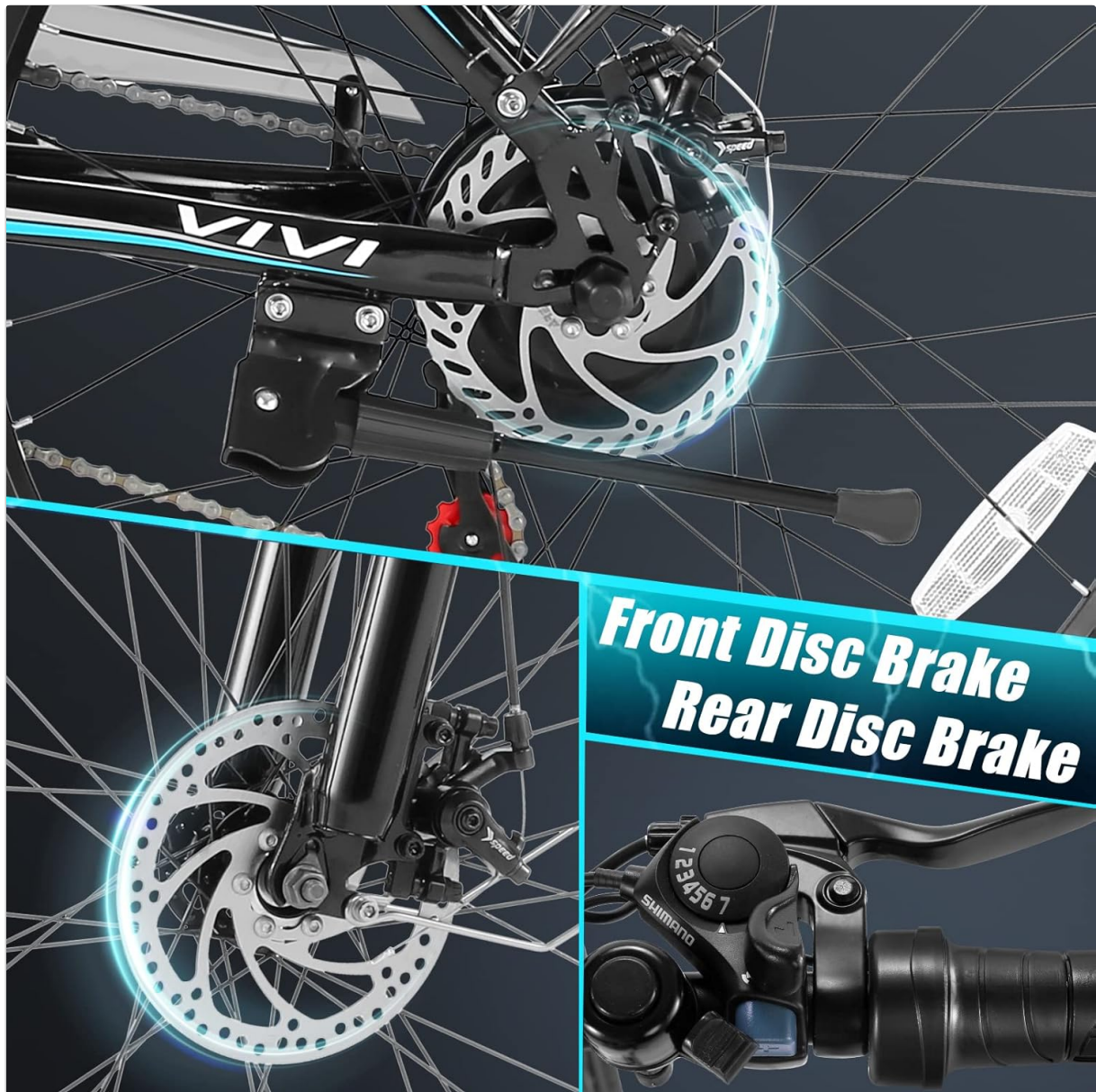
Image: Close-up of the front and rear disc brakes, highlighting the braking mechanism for reliable stopping power.