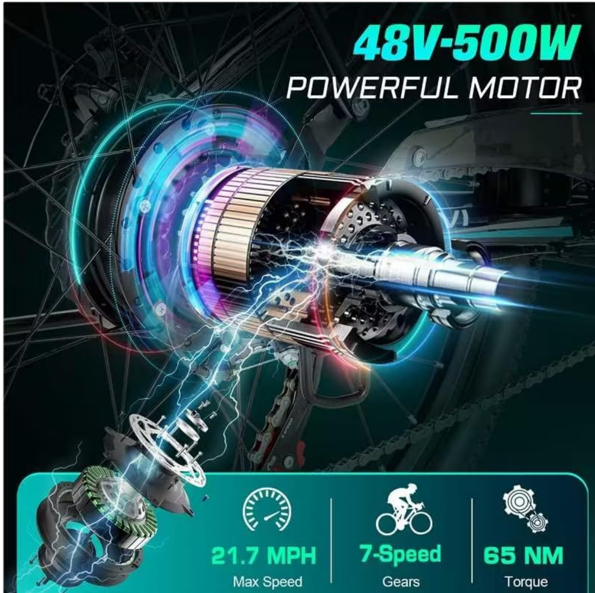
Image: Diagram illustrating the 48V-500W powerful brushless motor, highlighting its maximum speed of 21.7 MPH, 7-speed gears, and 65 NM torque.

Refer to the LCD display for current speed, battery level, and mode selection. The 7-speed gear system allows for efficient pedaling across different terrains.