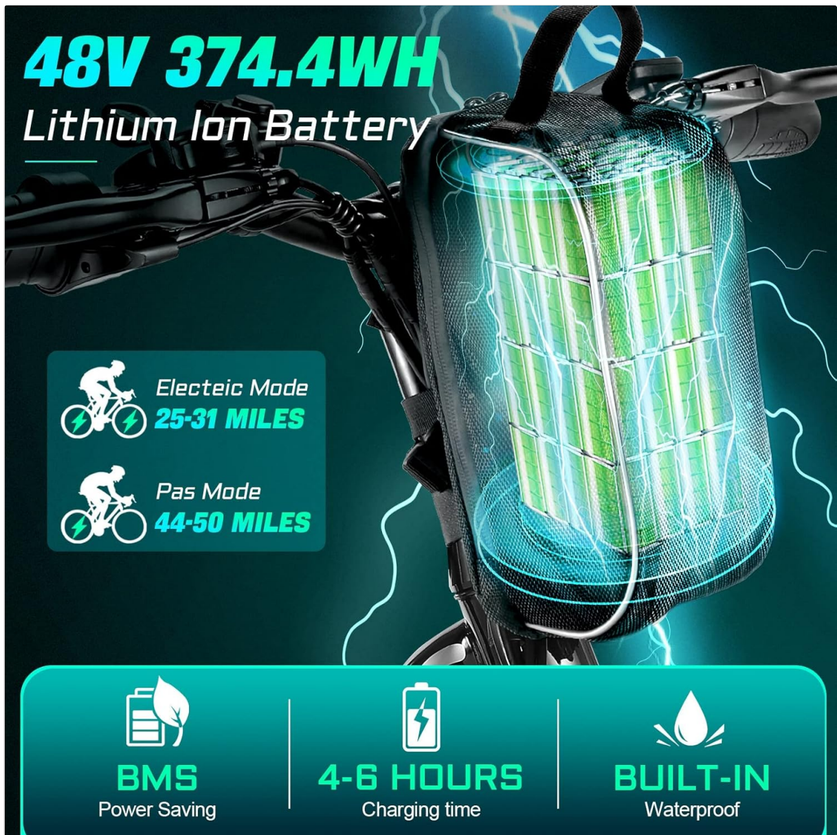
Image: The 48V 374.4Wh Lithium-ion battery, showing its waterproof design and estimated range.