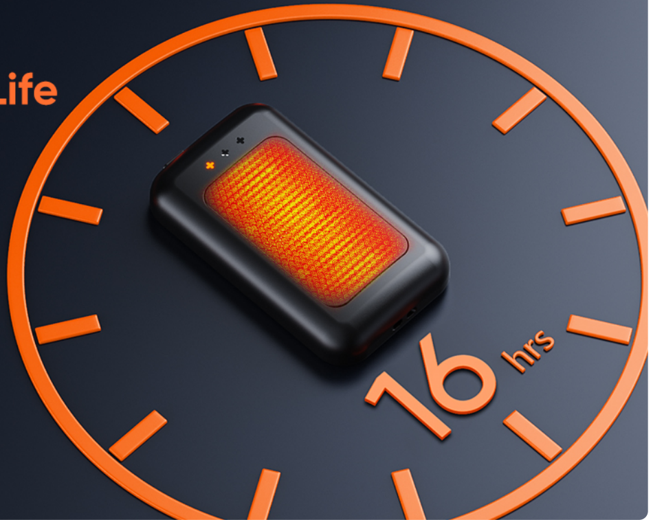
Image: The hand warmer with a prominent '16' graphic, illustrating its rapid heating capability.

Up to 16 hours of continuous warmth. Stay cozy wherever, whenever.