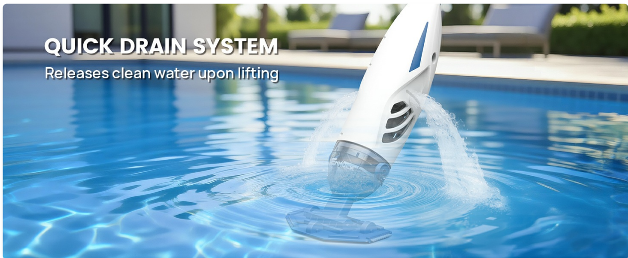
Image: The quick drain system in action, releasing water upon lifting.

The vacuum features a quick drain system that releases clean water upon lifting the unit from the pool. This simplifies removal and reduces mess.