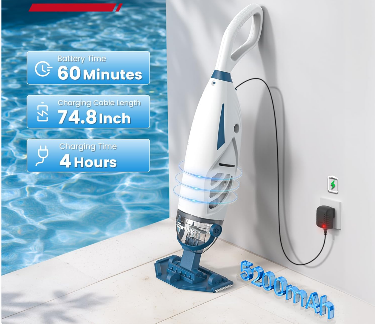
Image: The ENHULK PC68 connected to its charger, illustrating charging time and battery life.