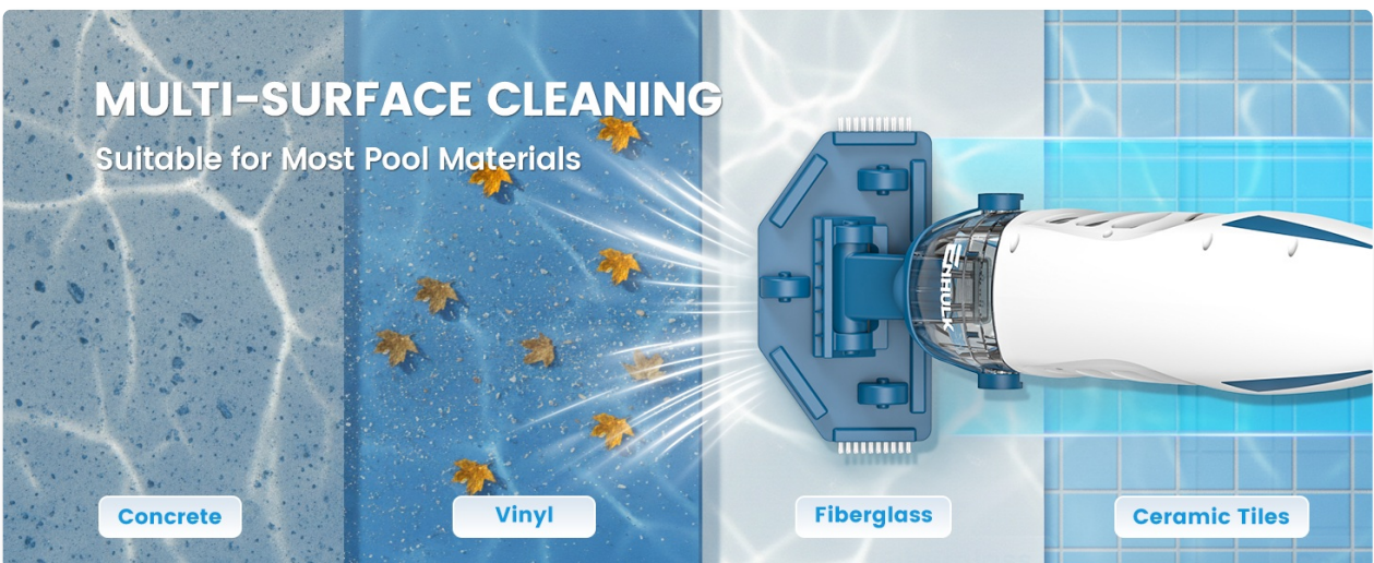
Image: The ENHULK PC68 is designed for multi-surface cleaning.