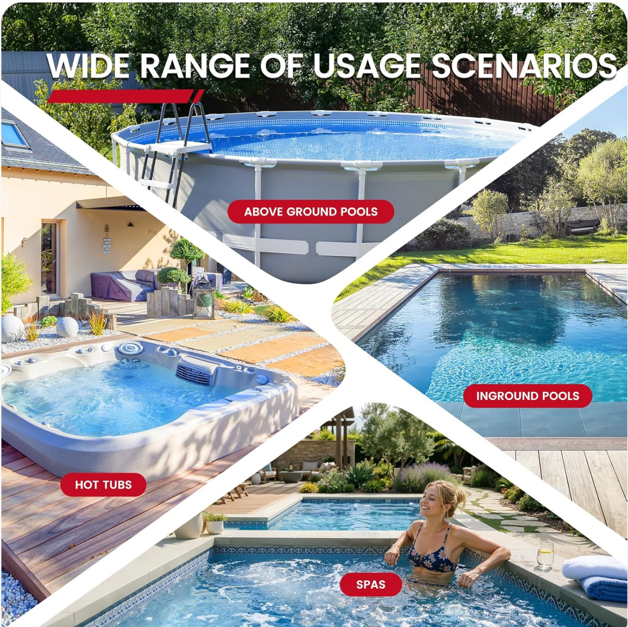
Image: The ENHULK PC68 is suitable for a wide range of usage scenarios, including different pool types.