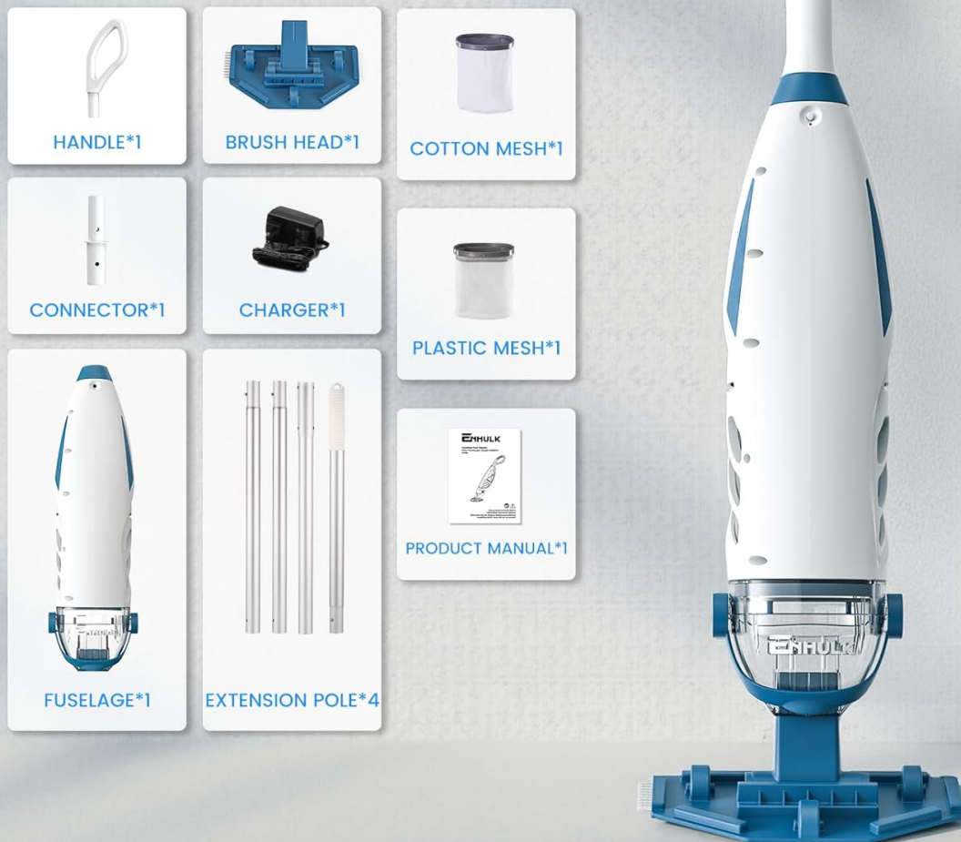
Image: All components included in the ENHULK PC68 package.